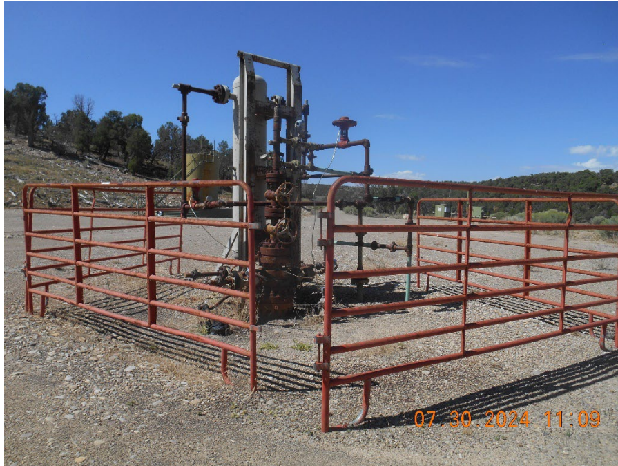
Wellhead with fencing and Sign

Inspection Date: 7/30/2024 Inspection Doc#: 693807562