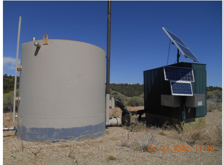
Fresh water tanks