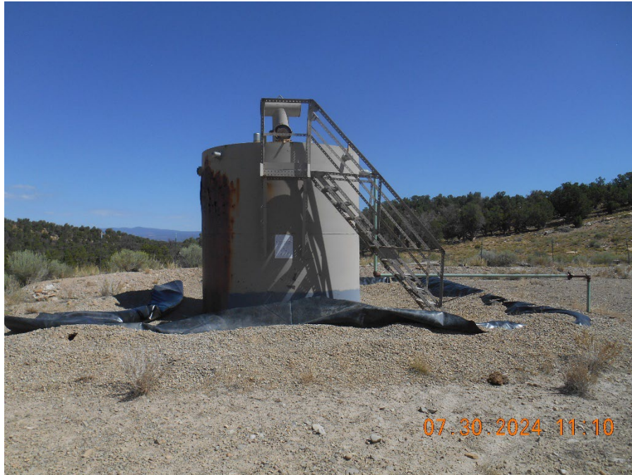
Produced water tank. Side rusted out. Tank hatch open and venting.

Inspection Date: 7/30/2024 Inspection Doc#: 693807562