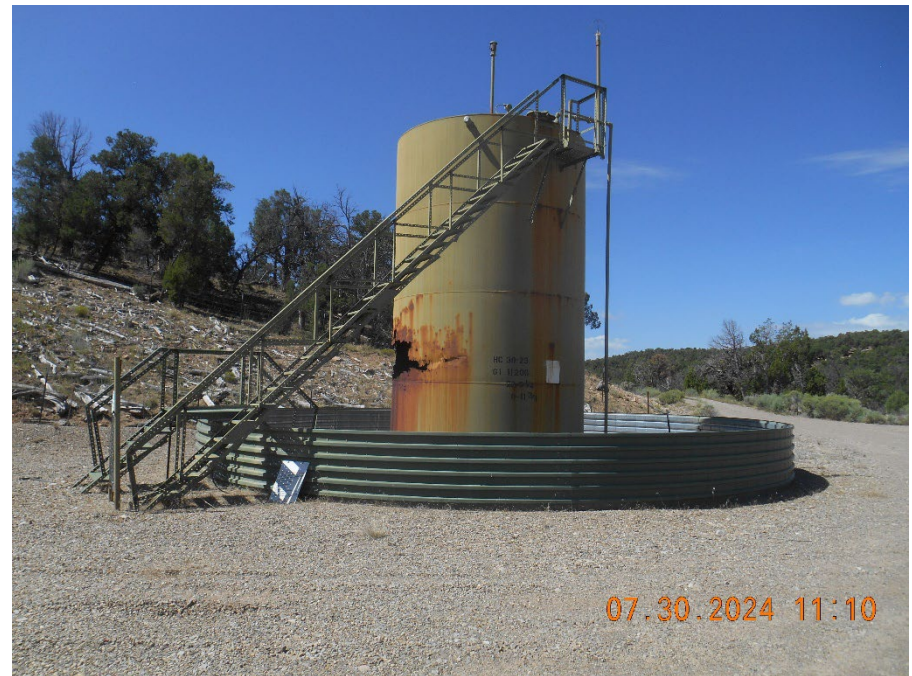
Tank Battery Rusted out