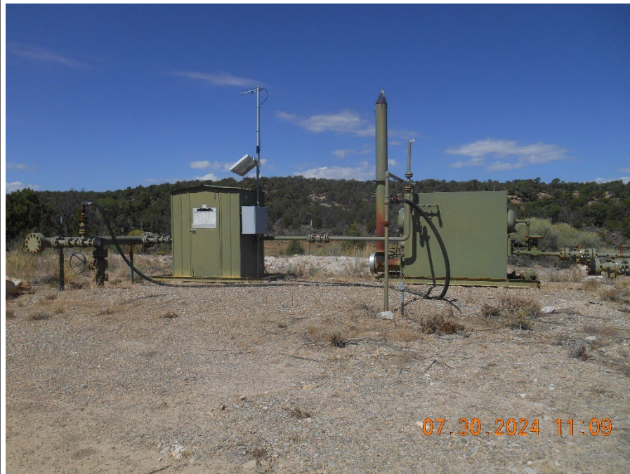
Separator and Meter housing

Inspection Date: 7/30/2024 Inspection Doc#: 693807562