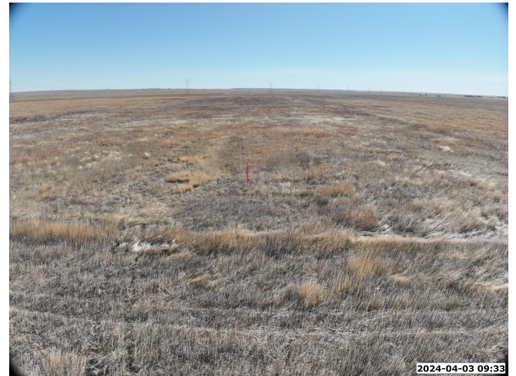
VIEW - EAST