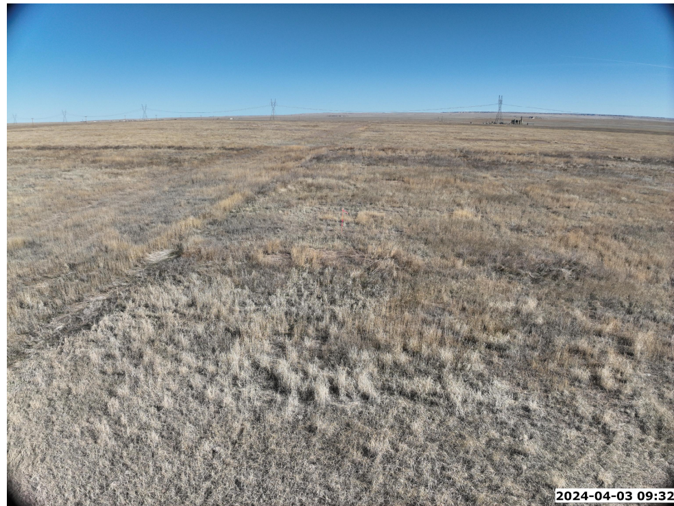
VIEW - NORTH

NW1/4 SW1/4 SECTION 6, TOWNSHIP 8 NORTH, RANGE 60 WEST, 6TH P.M., WELD COUNTY, COLORADO