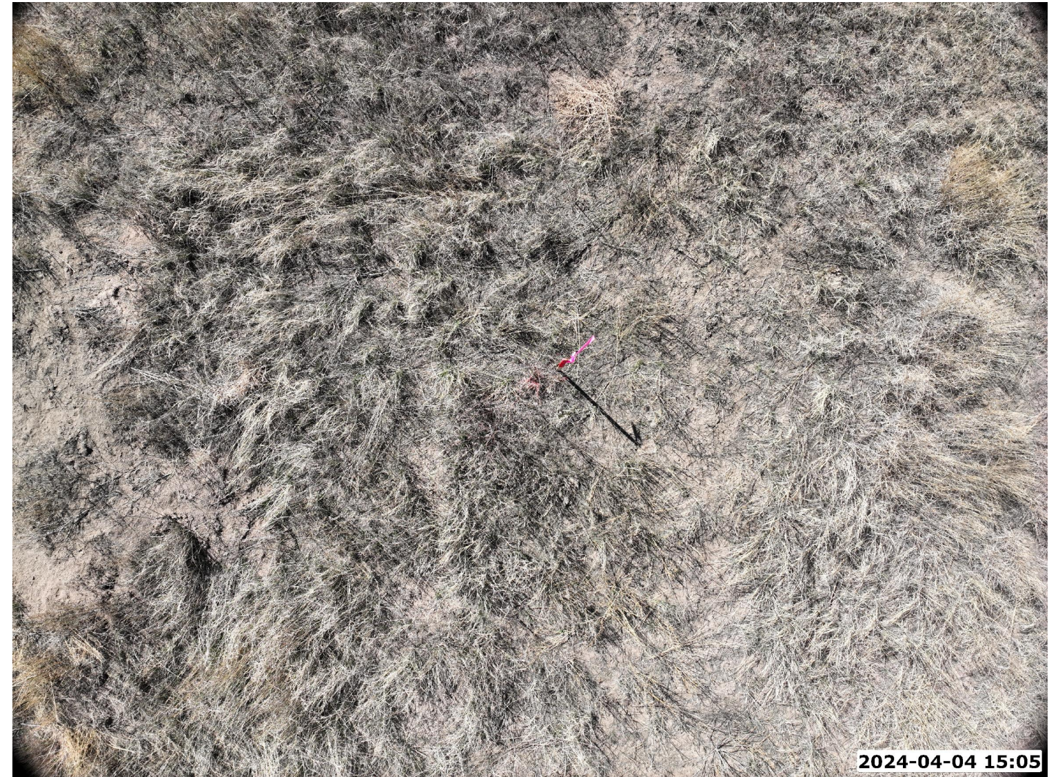
VIEW - CLOSE UP

K:\VERDAD\2023_145_HUNT_TBN_TBN_R60W_SEC_6\DWG\HUNT_TBN_R60W_SEC_6.dwg, 4/24/2024 7:06:50 AM, saundberg