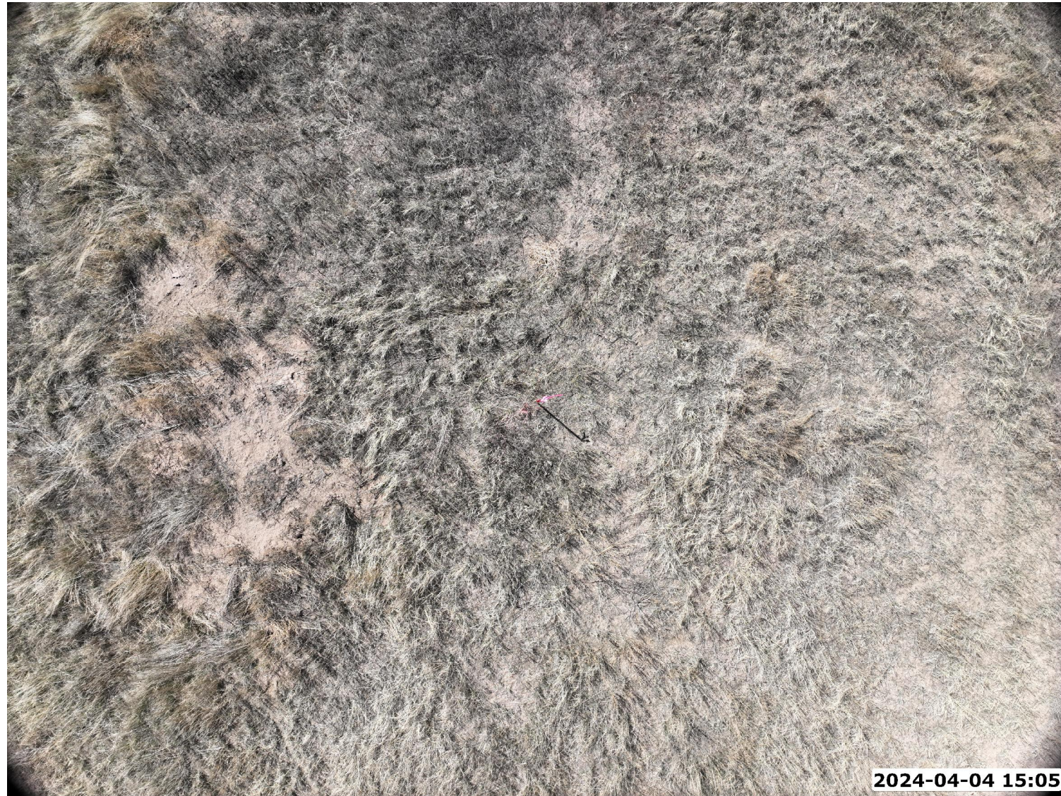
VIEW - OVERHEAD (DRONE)

NW1/4 SW1/4 SECTION 6, TOWNSHIP 8 NORTH, RANGE 60 WEST, 6TH P.M., WELD COUNTY, COLORADO