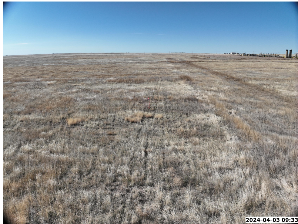
VIEW - SOUTH