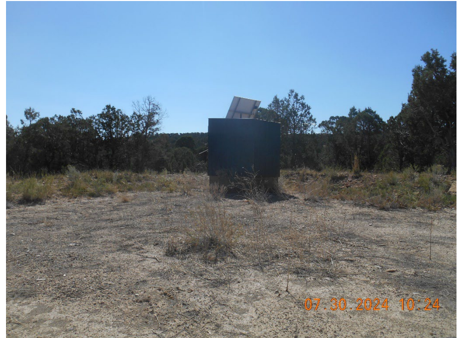
Fresh water tank - unused