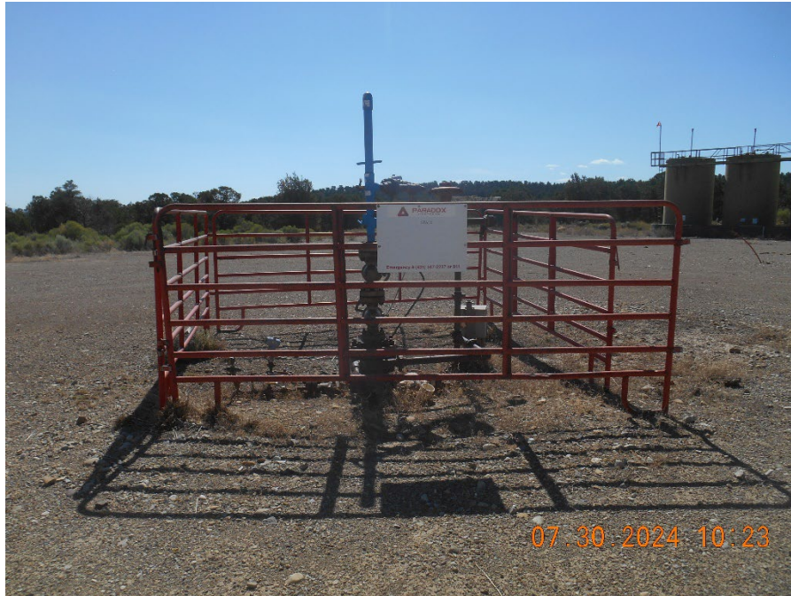
Wellhead with fence and sign

Inspection Date: 7/30/2024 Inspection Doc#: 693807550