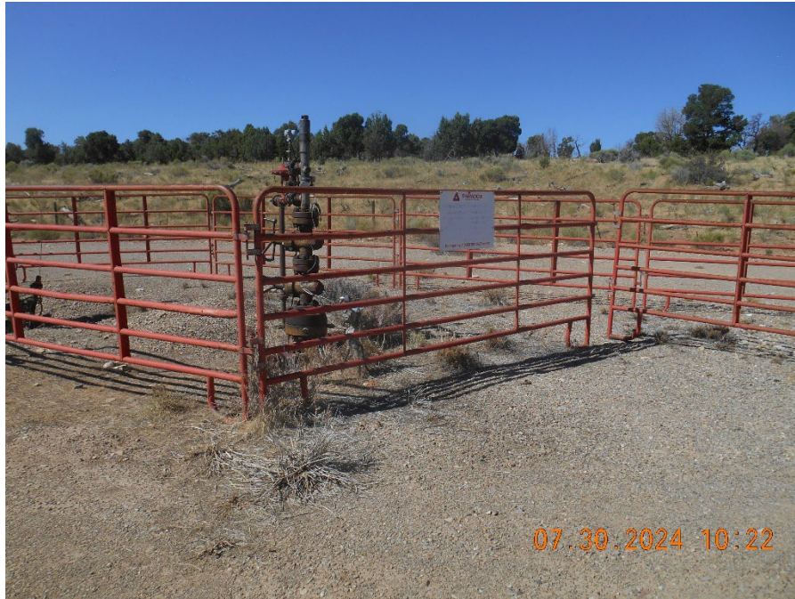
Wellhead with fence and sign

Inspection Date: 7/30/2024 Inspection Doc#: 693807550