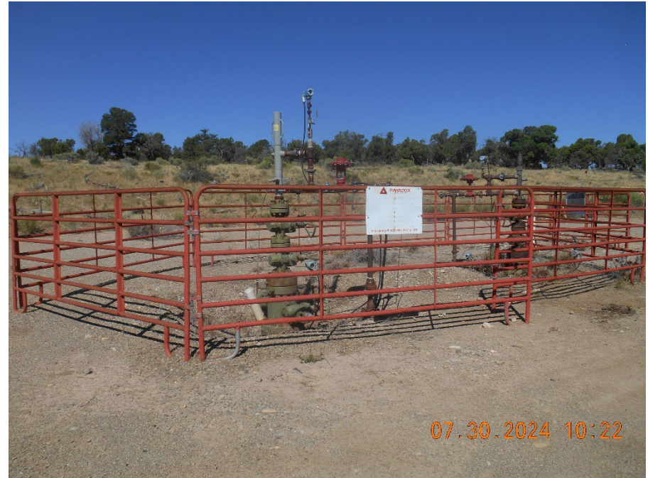
Wellhead with fence and sign