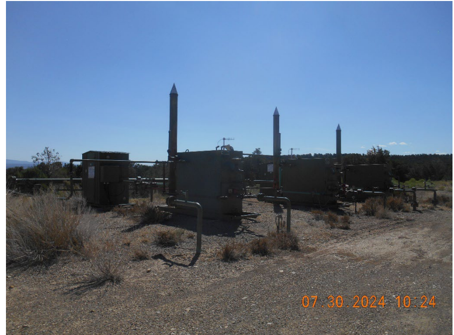
Separators and meter housings

HC STATE #36-14-45-14 API#: 05-113-06178