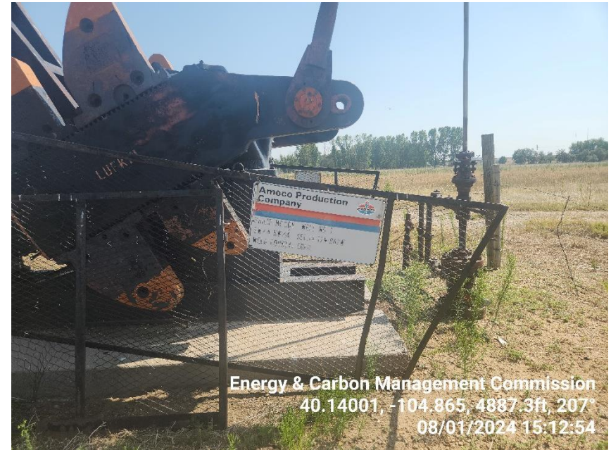
Photo 4 WH sign reflects old operator information.