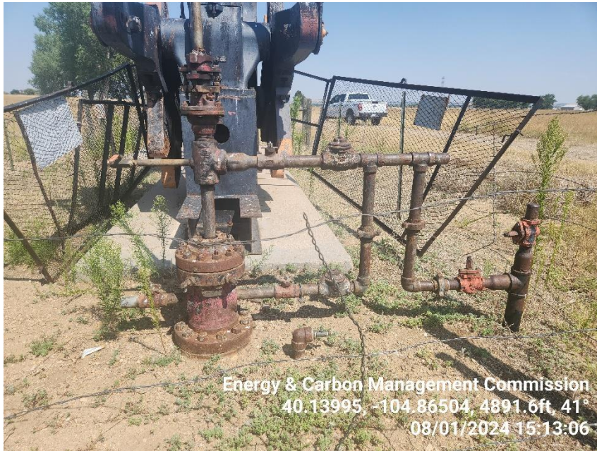
Photo 5 WH.