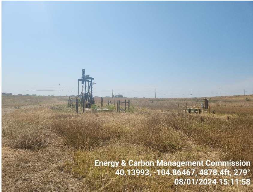
Photo 1 Wellsite.