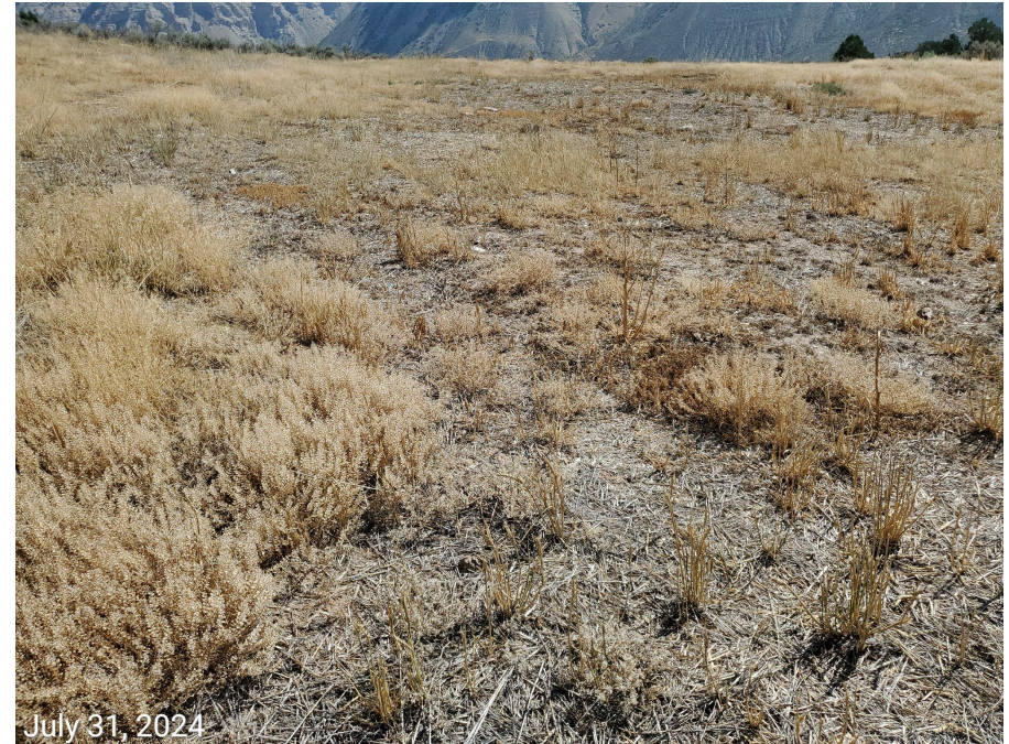
Photo 4: Continued from photo 3. Photo example areas on the west end of the Location that do not appear to be progressing towards 1004 Standards