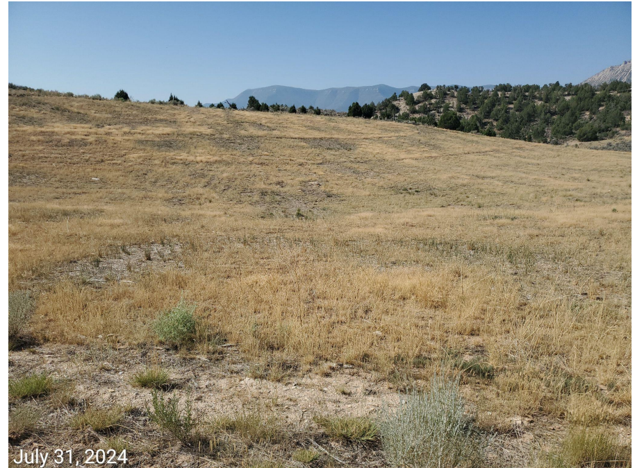
Photo 1: Photos 1-2 taken from the north end of the Location. Photos provide an overview of the Reclamation areas from east, southeast, southwest to west.