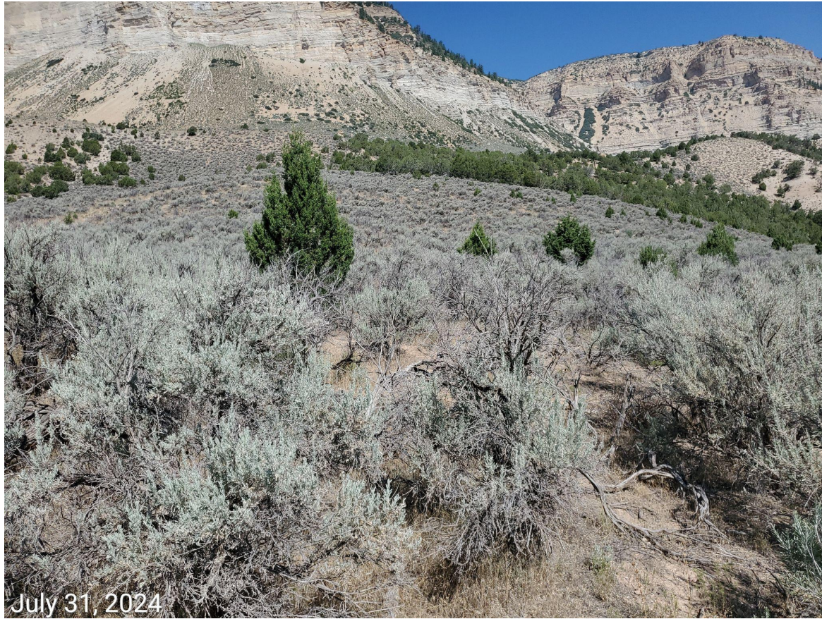
Photo 9: Photo example showing the vegetation within the adjacent reference area.