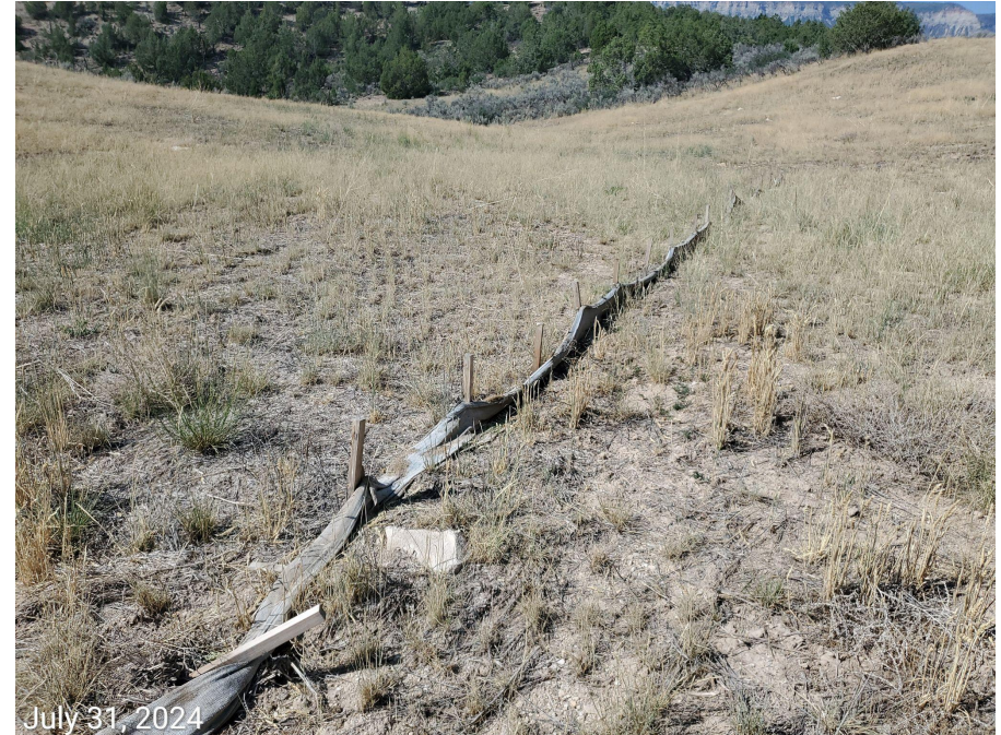
Photo 7: Photo examples showing silt fence observed throughout the Location in disrepair.