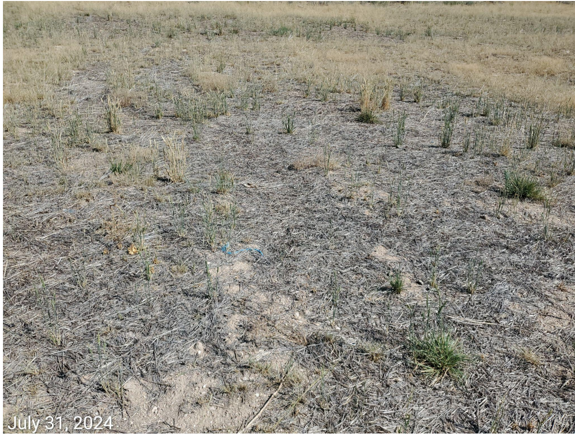
Photo 4: Continued from photo 3. Photo example areas of the Location that do not appear to be progressing towards 1004 Standards