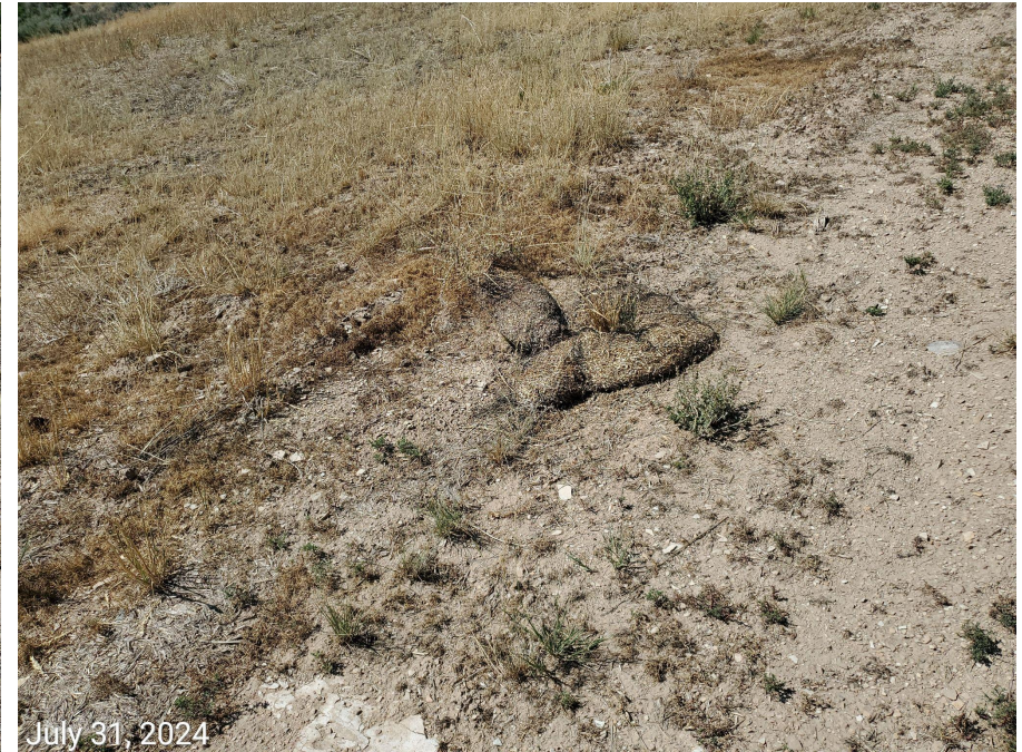
Photo 6: Photo examples showing sections of erosion logs observed throughout the Location in disrepair.