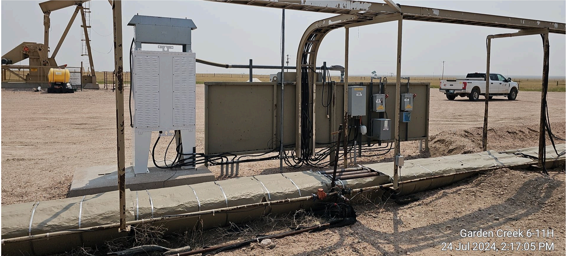
Garden Creek 6-11H 24 Jul 2024, 2:17:05 PM

199°S (T) • 40.931259, -104.279983 ±18ft ▲ 5112ft