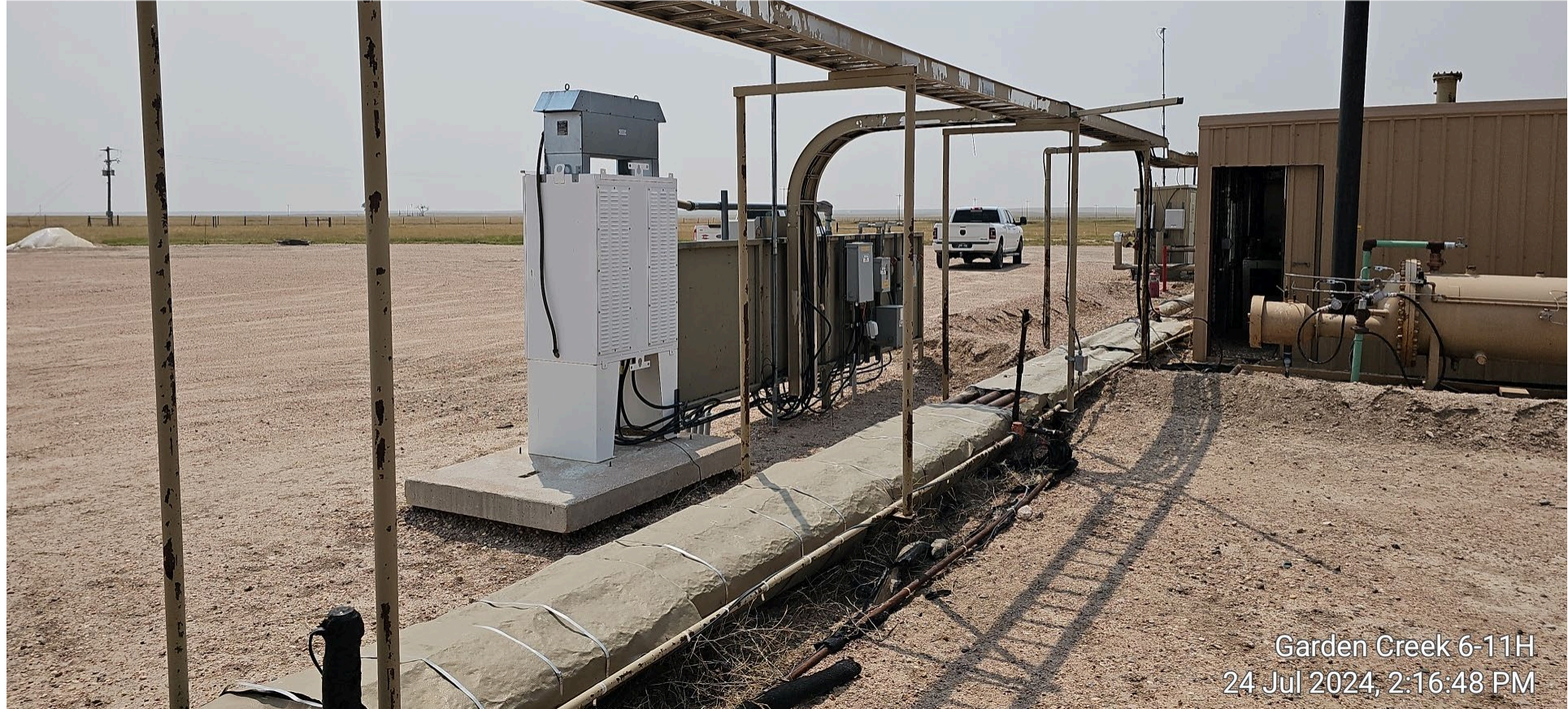
Garden Creek 6-11H 24 Jul 2024, 2:16:48 PM

238°SW (T) • 40.931259, -104.279983 ±25ft ▲ 5112ft