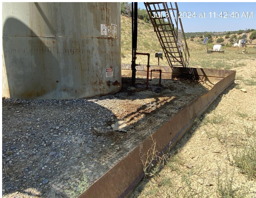
Oily waste and stained soil