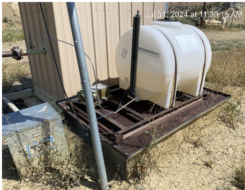
Faded and illegible label