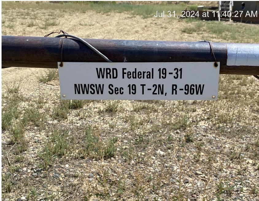
When replaced additional information is required