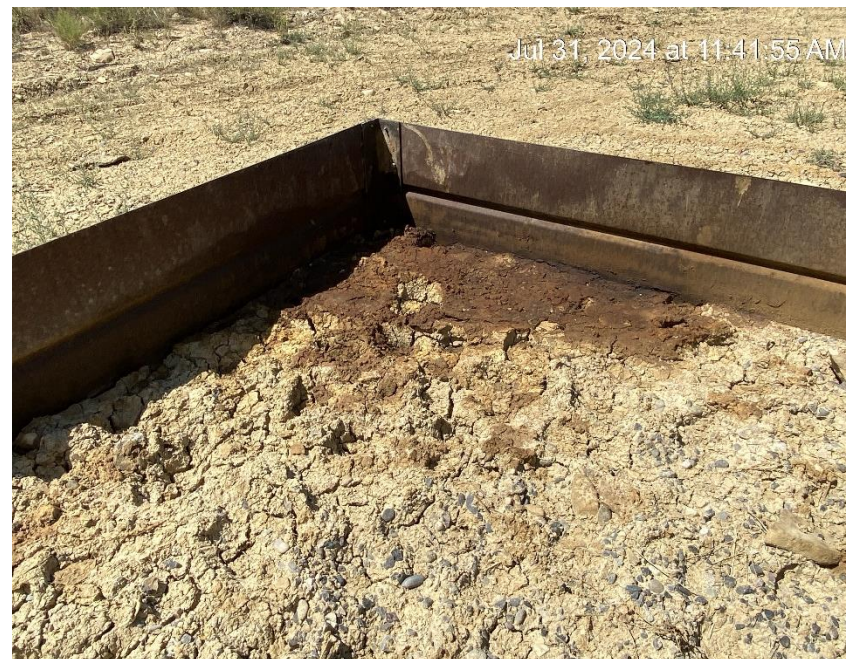
Oily waste and stained soil