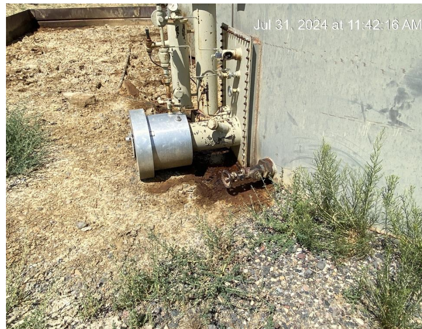
Oily waste and stained soil