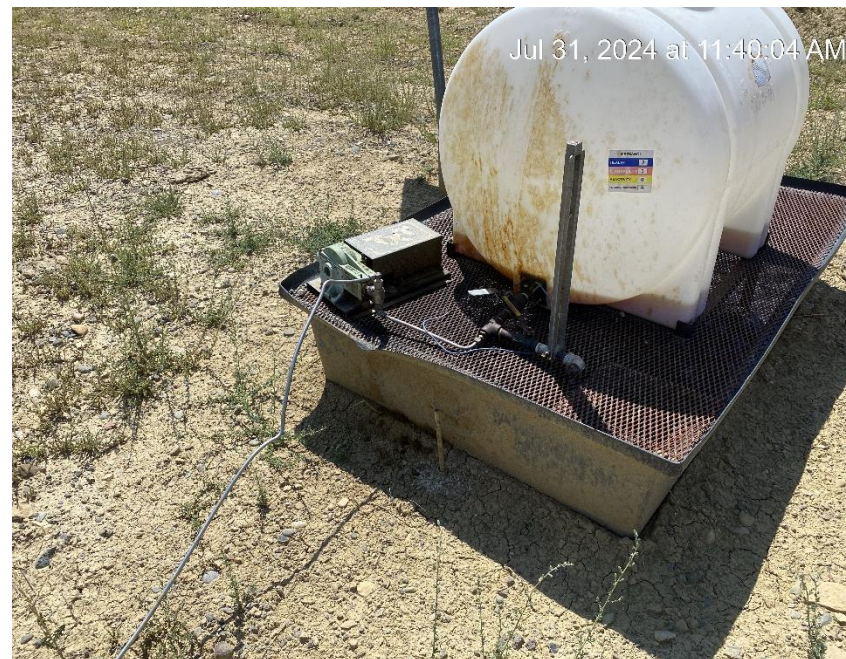
Oily waste and stained soil