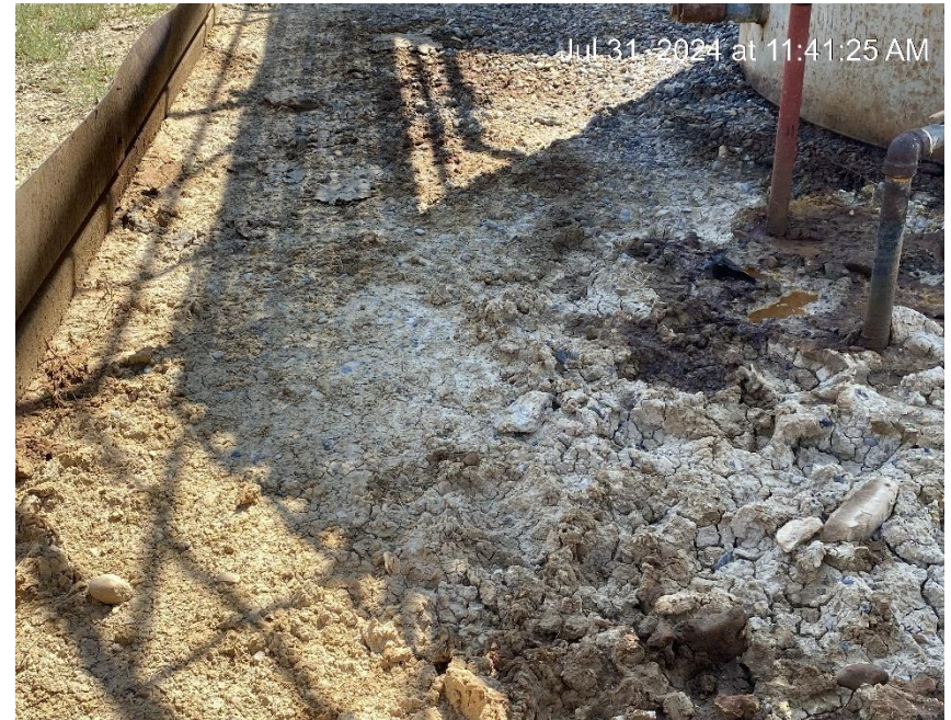
Oily waste and stained soil