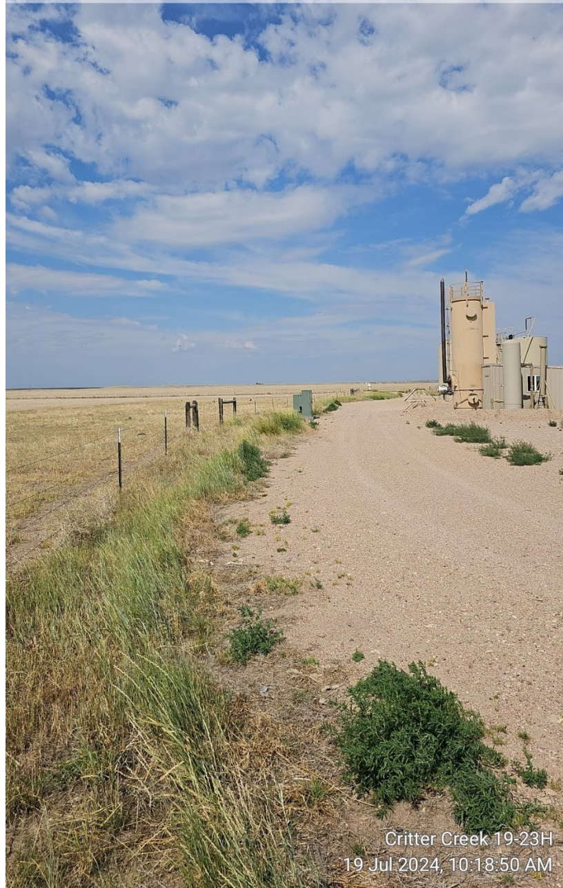
Critter Creek 19-23H 19 Jul 2024, 10:18:50 AM

SW W NW 0 240 270 300 270°W (T) 40.9137, -104.40731 ±18ft ▲ 5153ft