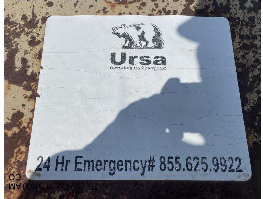
Photo # 3185 Tank label contains inaccurate info/does not comply with CECMC rules