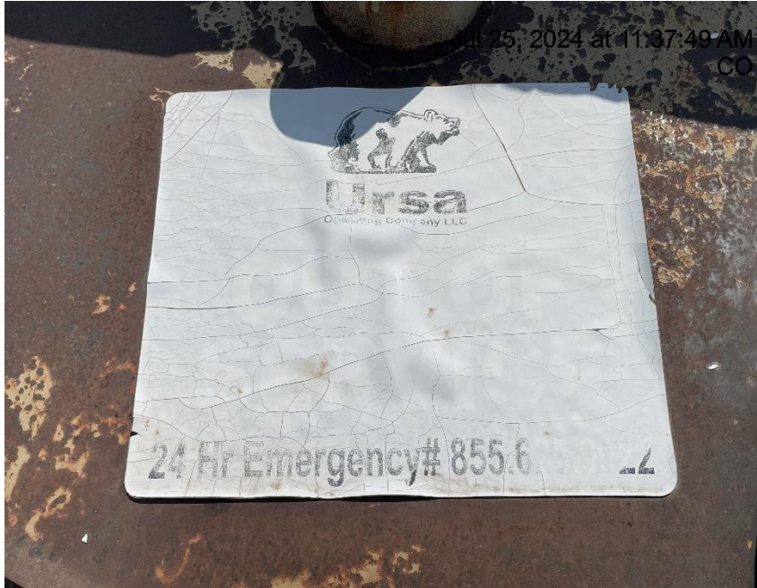
Photo # 3184 Tank label contains inaccurate info/does not comply with CECMC rules