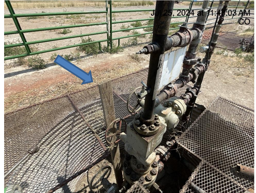
Photo # 3181 Wildlife egress on wellhead cellar not properly installed/needs adjustment