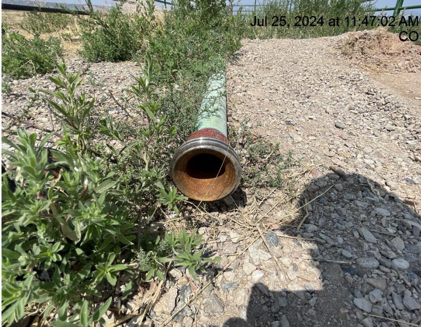
Photo # 3178 Open ended piping/available for entry by wildlife/wildlife hazard