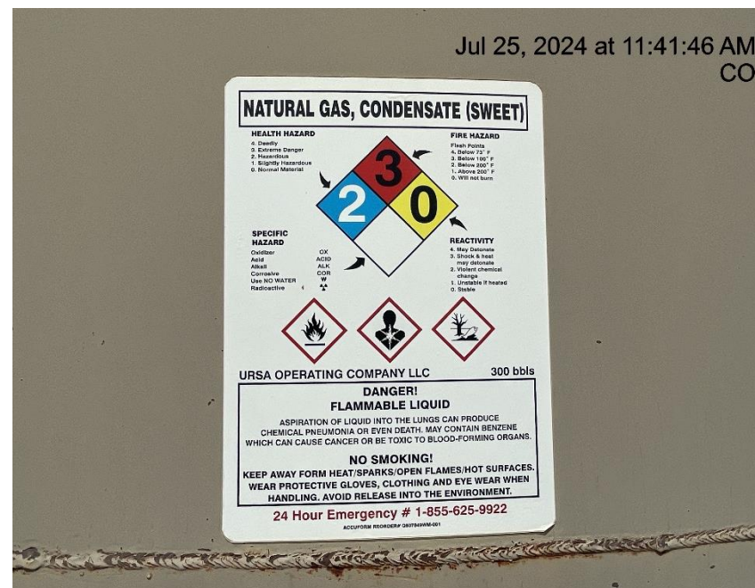
Photo # 3182 Tank label contains inaccurate info/does not comply with CECMC rules

Photo # 3183 Tank label contains inaccurate info/does not comply with CECMC rules