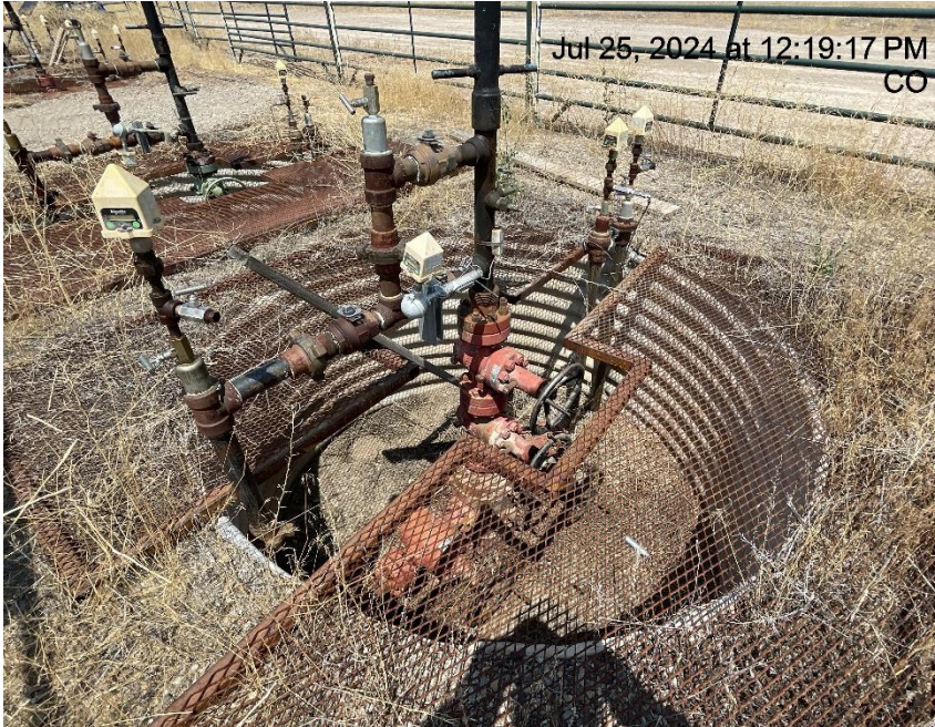
Photo # 3253 Cellar not properly covered/wildlife & personnel hazard