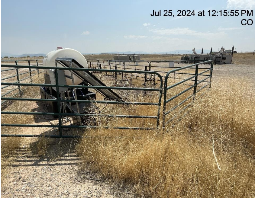
Photo # 3249 Dead weeds/debris near wellheads & chemical tank that is causing a fire hazard