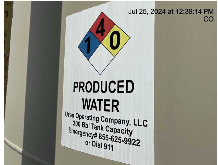
Photo # 3258 Tank label contains inaccurate info/does not comply with CECMC rules