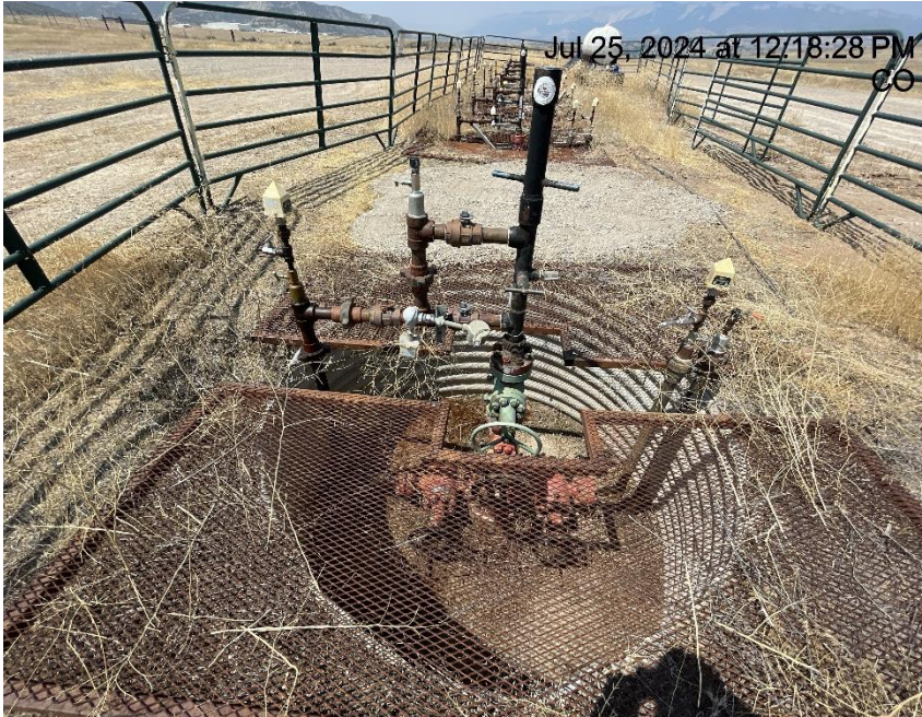
Photo # 3251 Wellhead cellar lacks wildlife egress/does not comply with CECMC wildlife rules