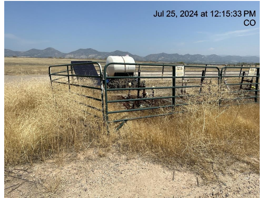
Photo # 3248 Dead weeds/debris near wellheads & chemical tank that is causing a fire hazard