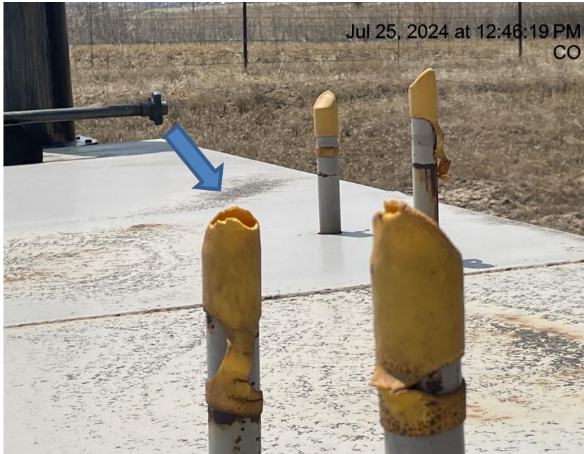
Photo # 3257 PRV vent line cap damaged/PRV vent line does not comply with CECMC pressure safety device rules