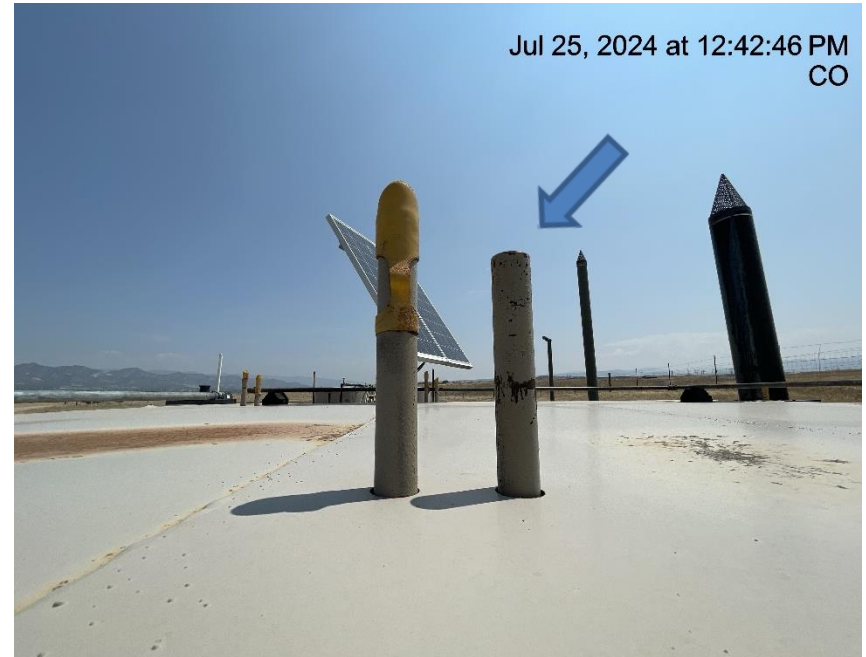
Photo # 3256 PRV vent line does not comply with CECMC pressure safety device rules