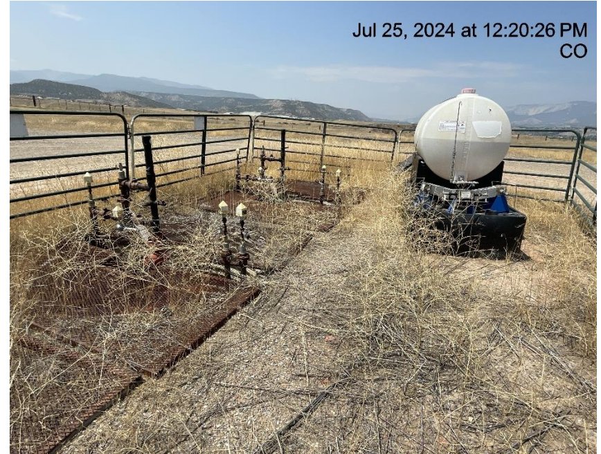
Photo # 3250 Dead weeds/debris near wellheads & chemical tank that is causing a fire hazard