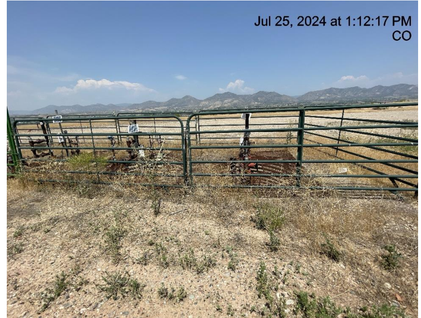
Photo # 3343 Dead weeds/debris near wellheads that is causing a fire hazard