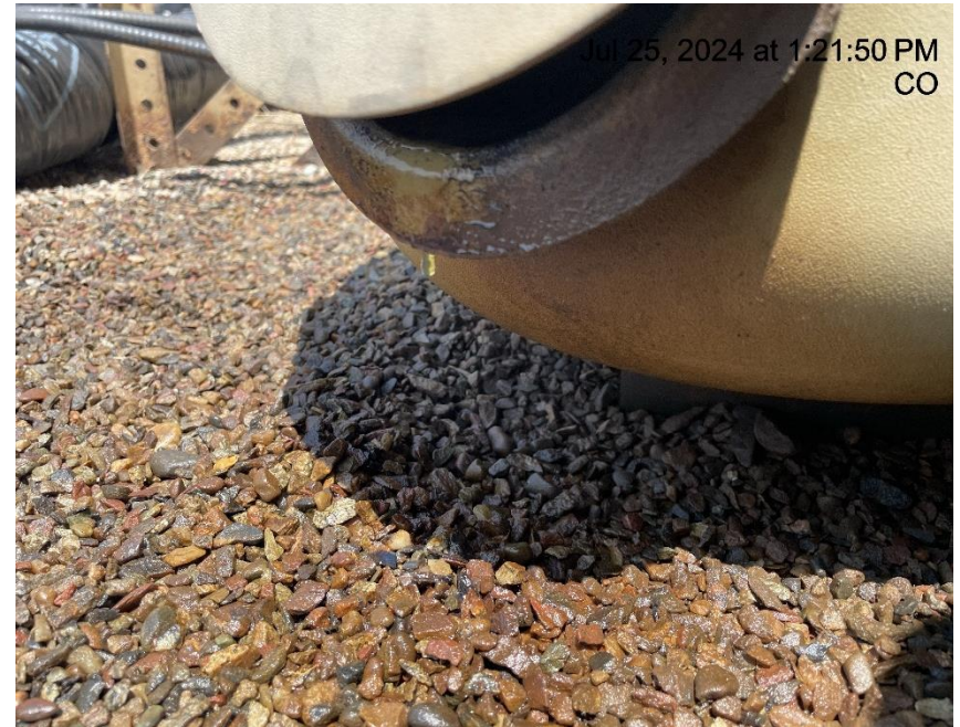
Photo # 3335 Mechanical Condition - Possible leak on load line for production tank