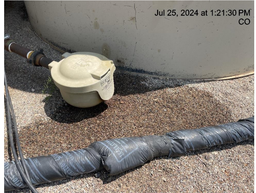
Photo # 3331 Mechanical Condition - Possible leak on load line & staining in secondary containment