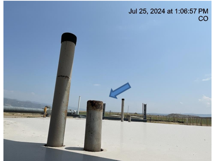
Photo # 3355 PRV vent line does not comply with CECMC pressure safety device rules