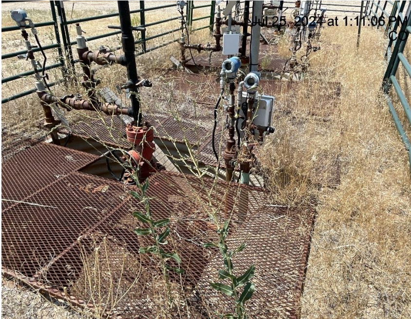
Photo # 3342 Dead weeds/debris near wellheads that is causing a fire hazard