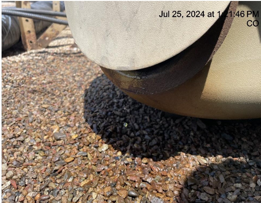
Photo # 3334 Mechanical Condition - Possible leak on load line for production tank