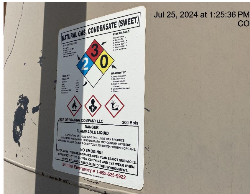
Photo # 3349 Tank label contains inaccurate info/does not comply with CECMC rules