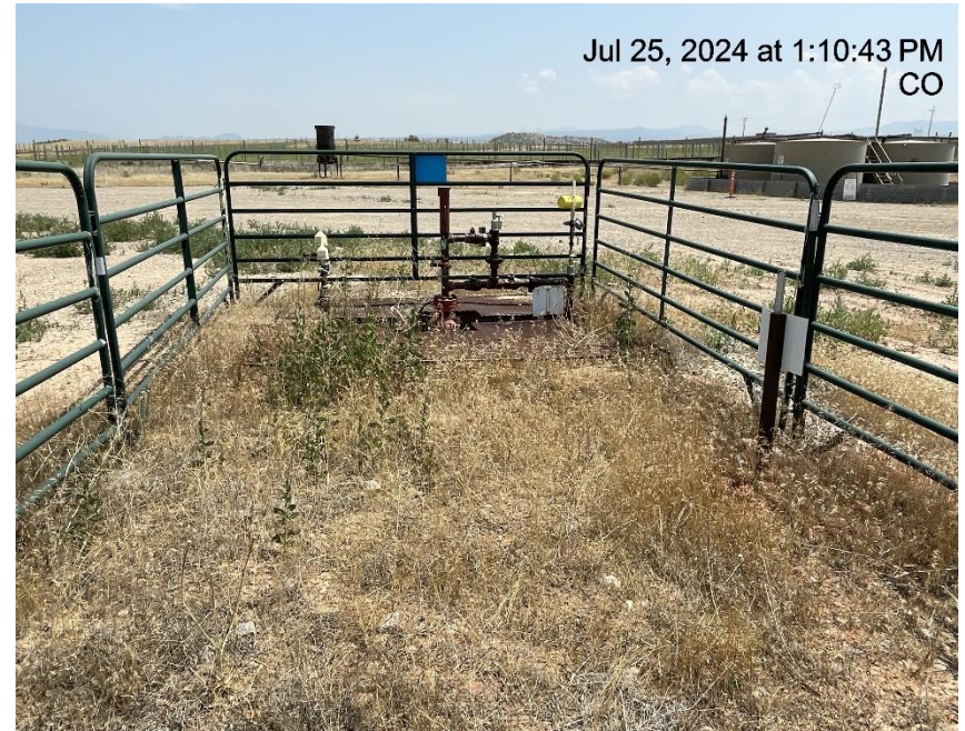
Photo # 3341 Dead weeds/debris near wellheads that is causing a fire hazard