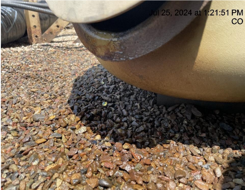
Photo # 3336 Mechanical Condition - Possible leak on load line for production tank