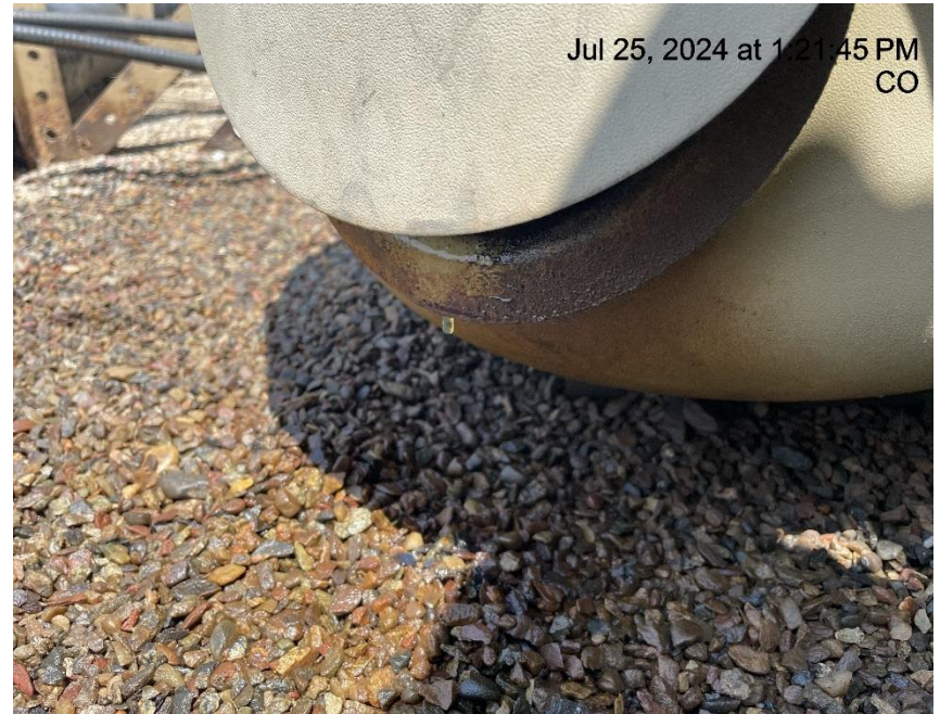
Photo # 3333 Mechanical Condition - Possible leak on load line for production tank