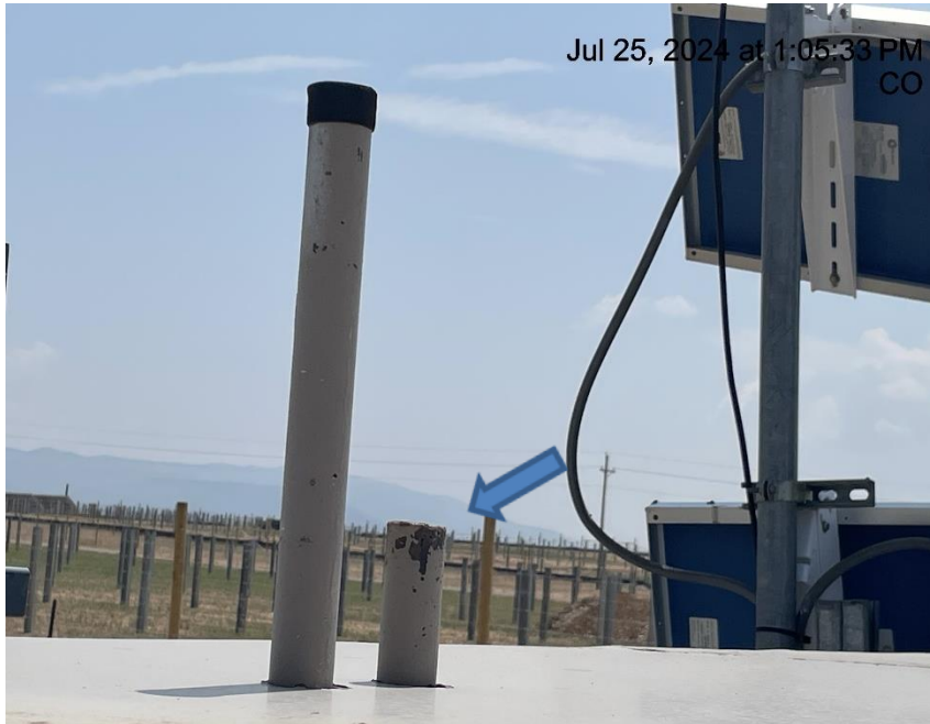
Photo # 3354 PRV vent line does not comply with CECMC pressure safety device rules