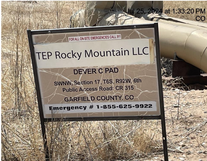
Photo # 3356 Sign at entrance to location has an emergency # that is disconnected/sign does not comply with CECMC signage rules