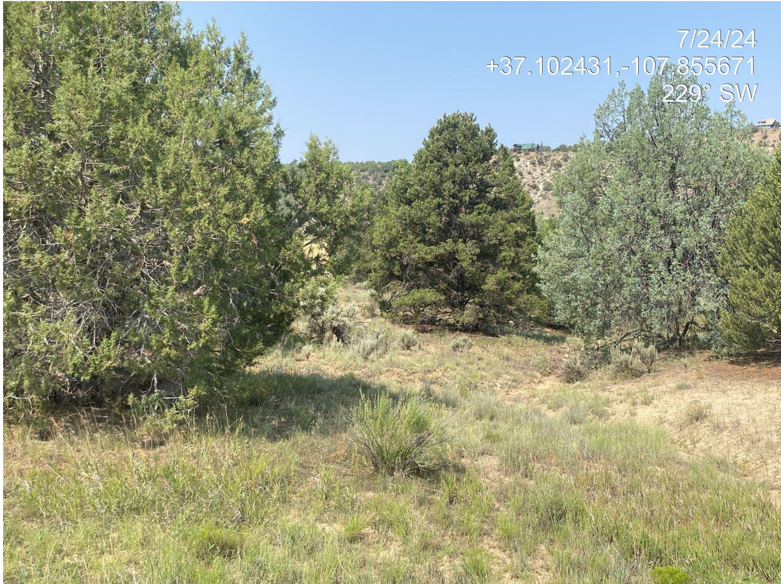
Photo 5. Reference area comprised of Smooth brome, Rabbitbrush and Juniper.

Inspection Photos Location Name: Ute 2 Location ID: 325440