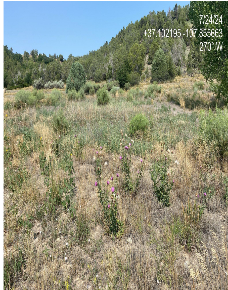
Photo 3. Cardinal photos taken from the center of the disturbance, left photo facing south, right photo facing west.