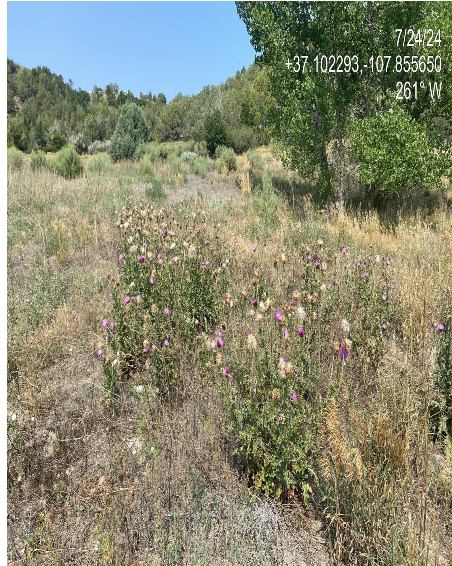
Photo 4. Large patches of Russian knapweed and Musk thistle observed flowering on location.