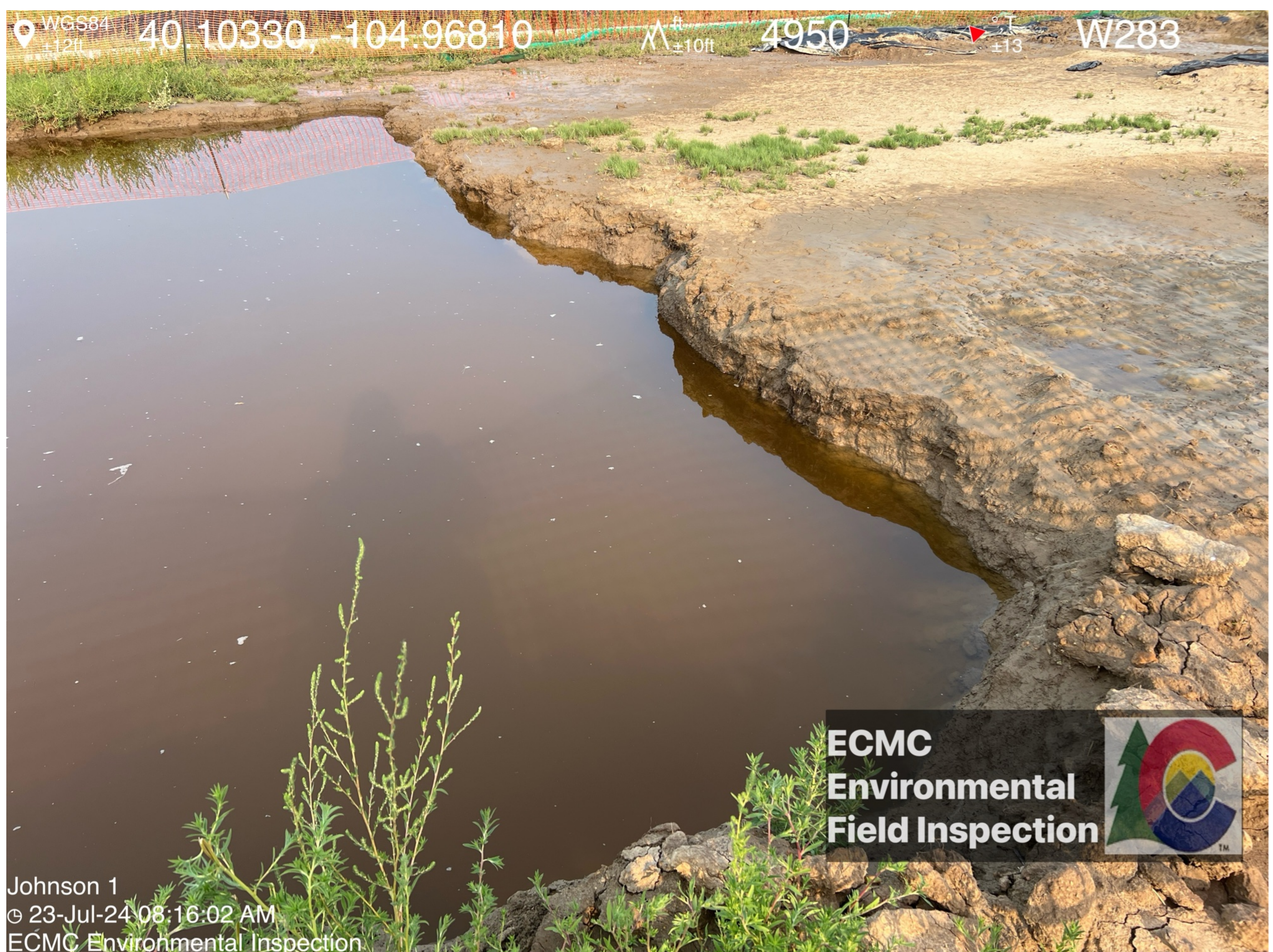
Open excavation filled with water.