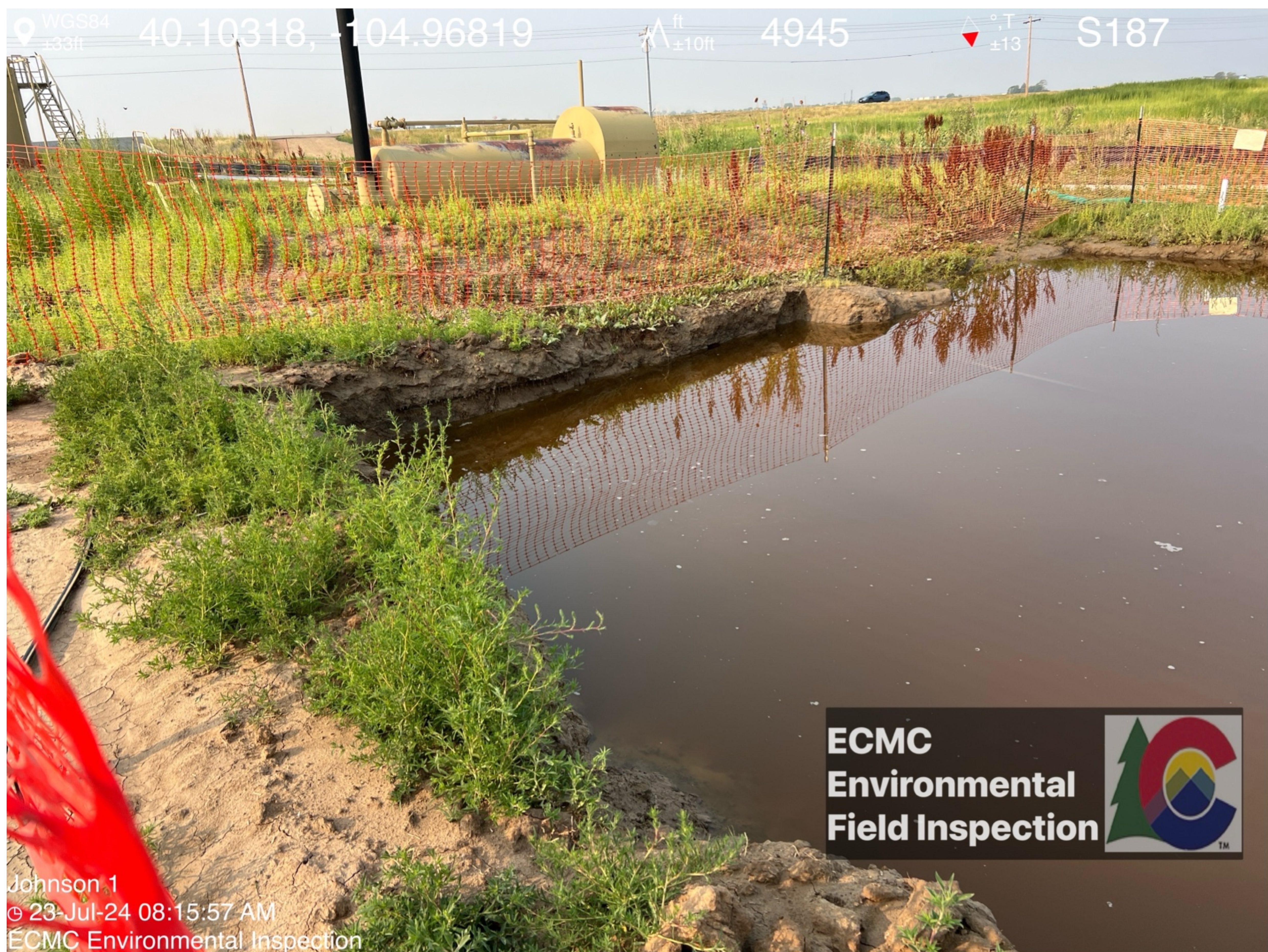
Site overview; excavation over-topped with stormwater and groundwater, weeds, inadequate BMPs.