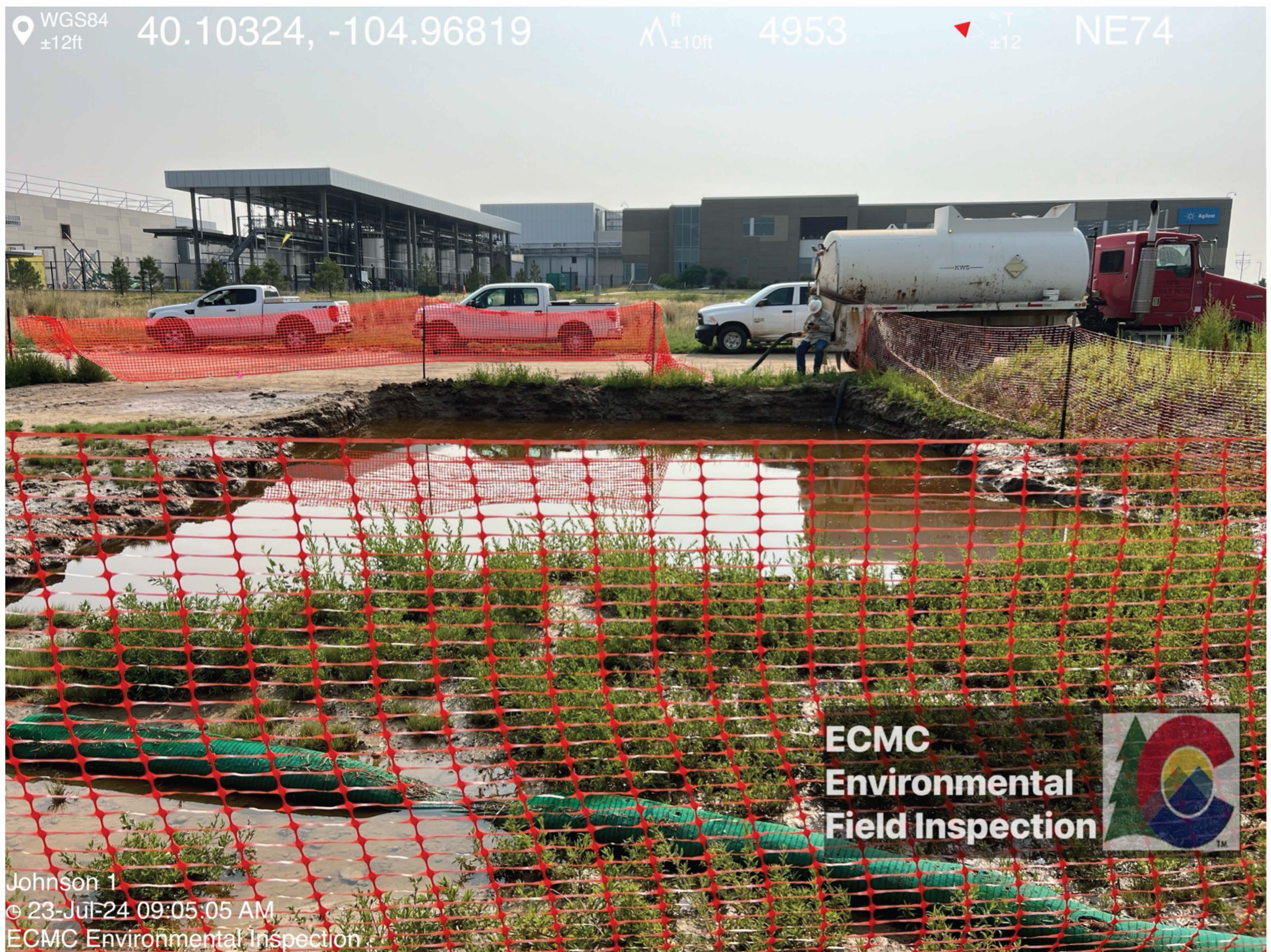
Crews returned to continue hydrovacuuming water from open excavation (Second truckload). Inadequate stormwater BMPs.