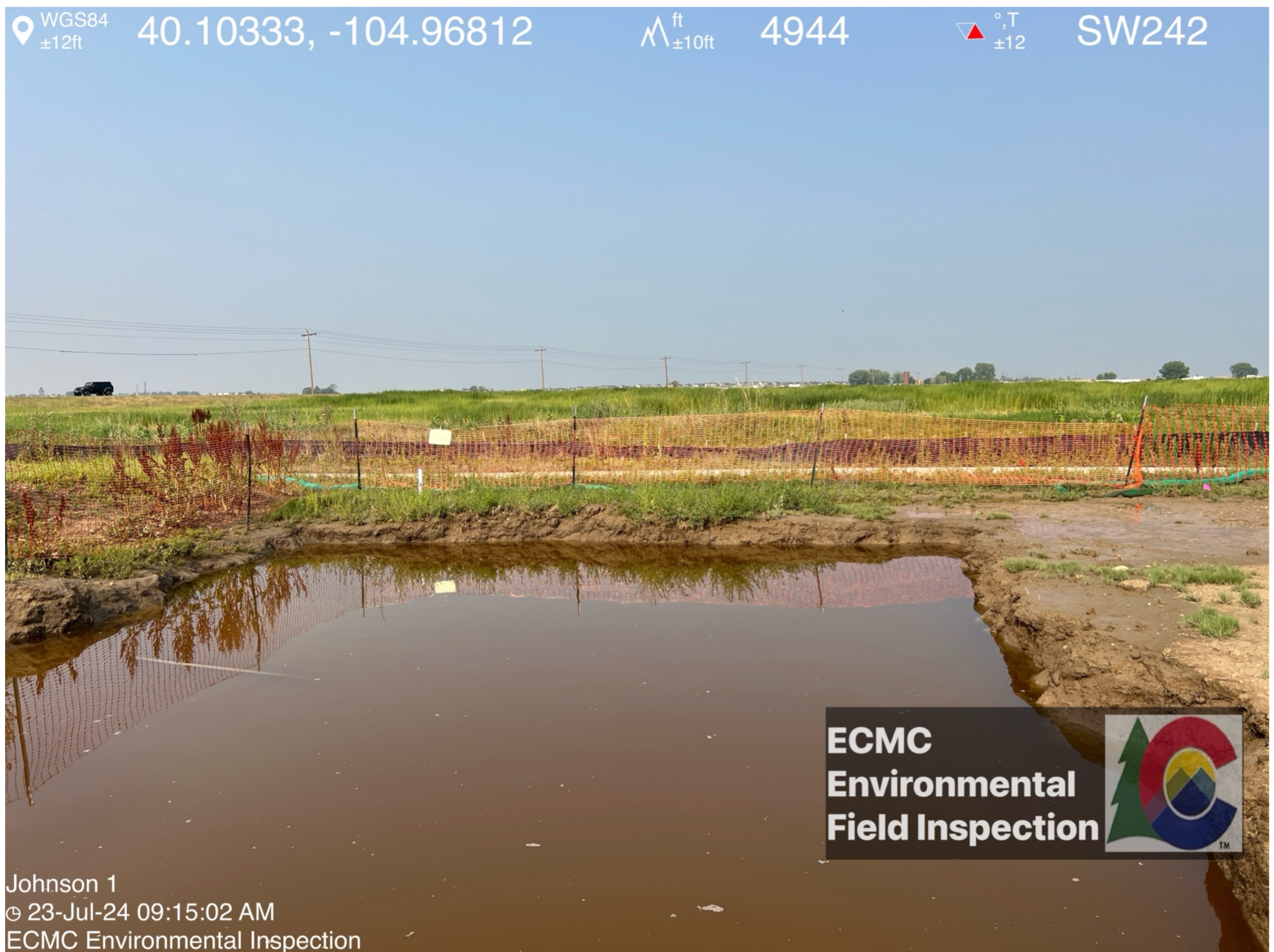
Excavation filled with surface and groundwater; note flowline bend visible in excavation, field personnel indicated additional repairs will be conducted once excavation drawn down.