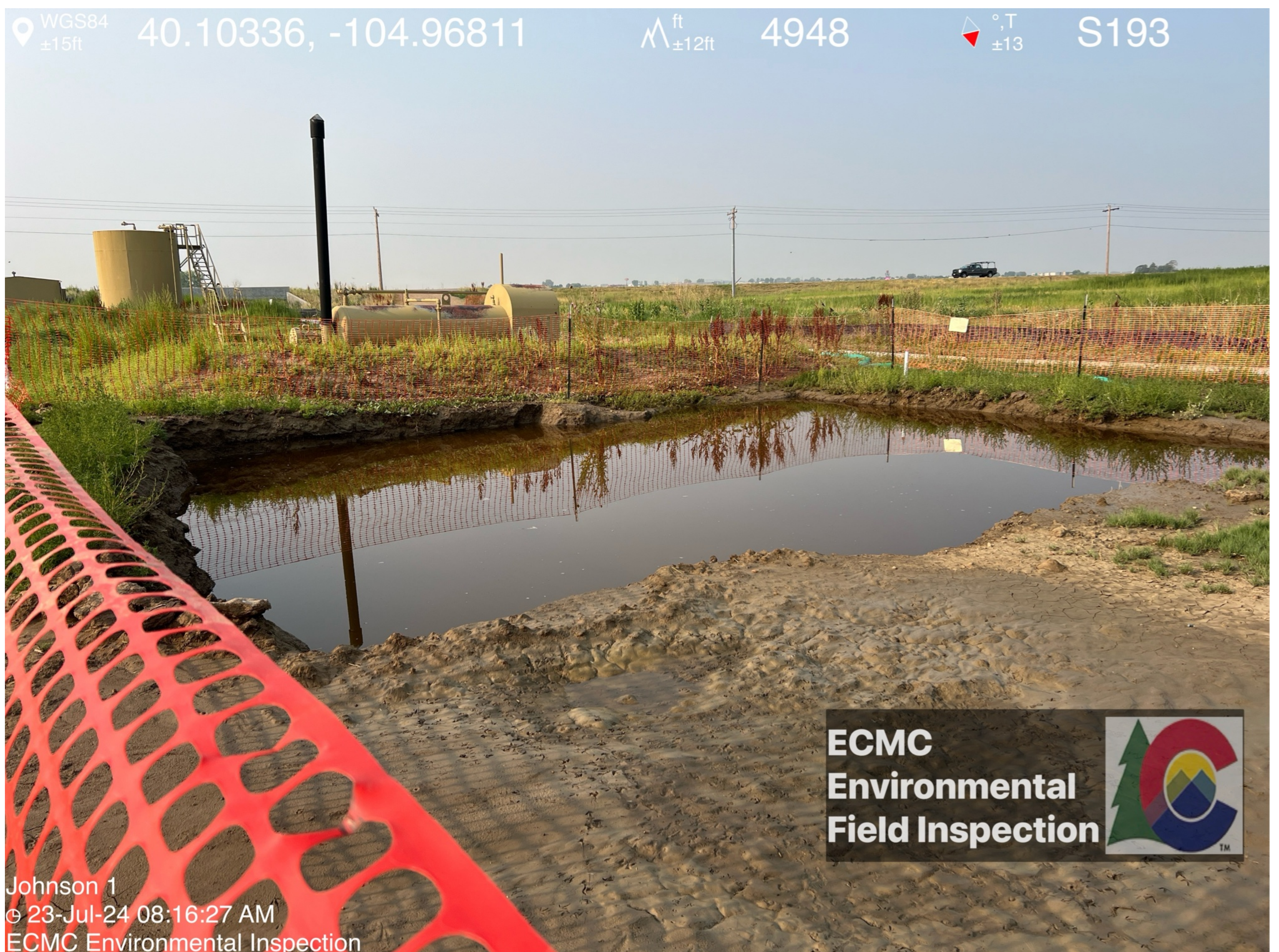
Open excavation filled with water (groundwater and surface water). Inadequate BMPs to control run-in/run-off around the excavation.