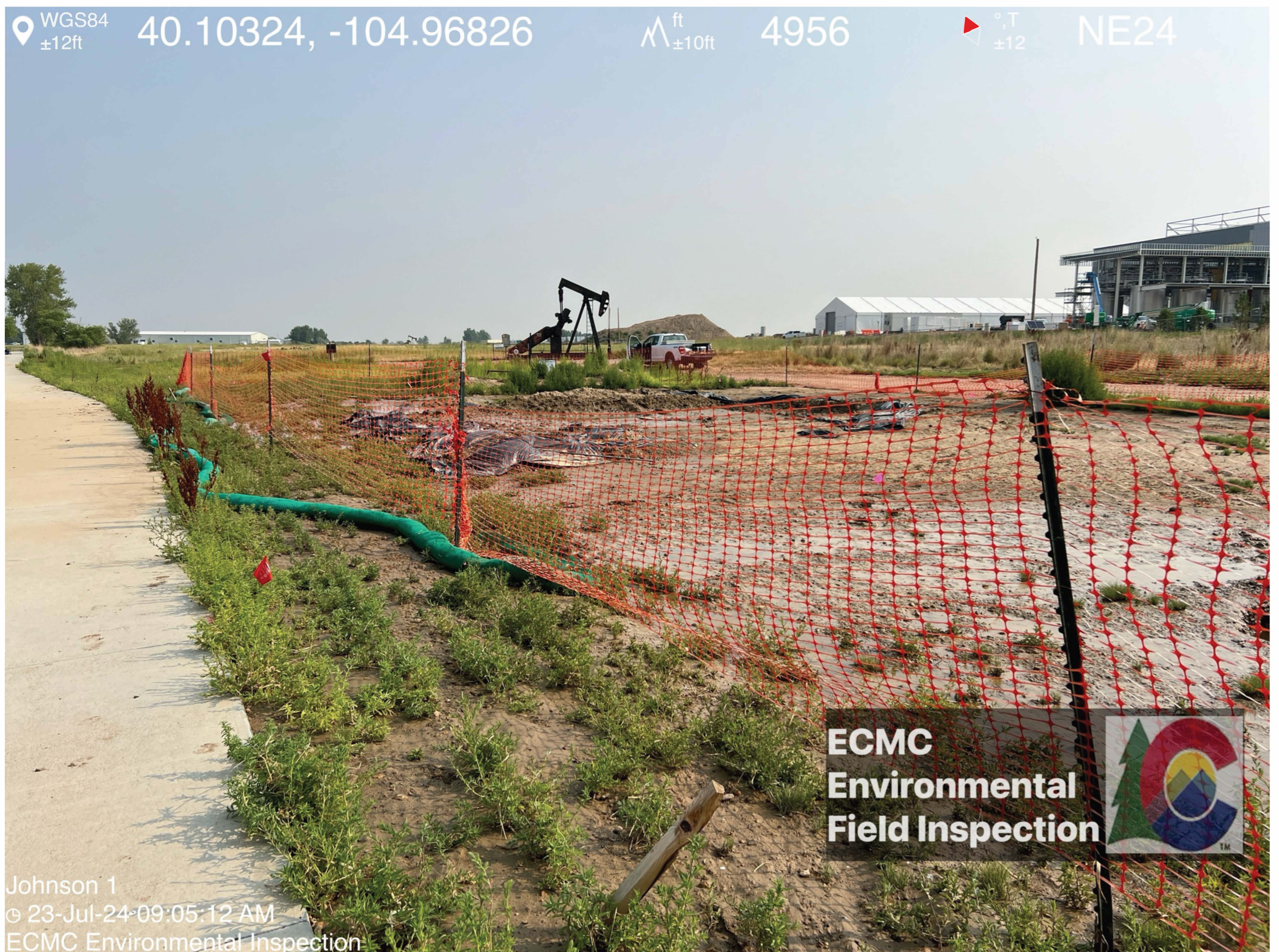
Open excavation filled with water (groundwater and surface water). Inadequate BMPs to control run-in/run-off around the excavation.