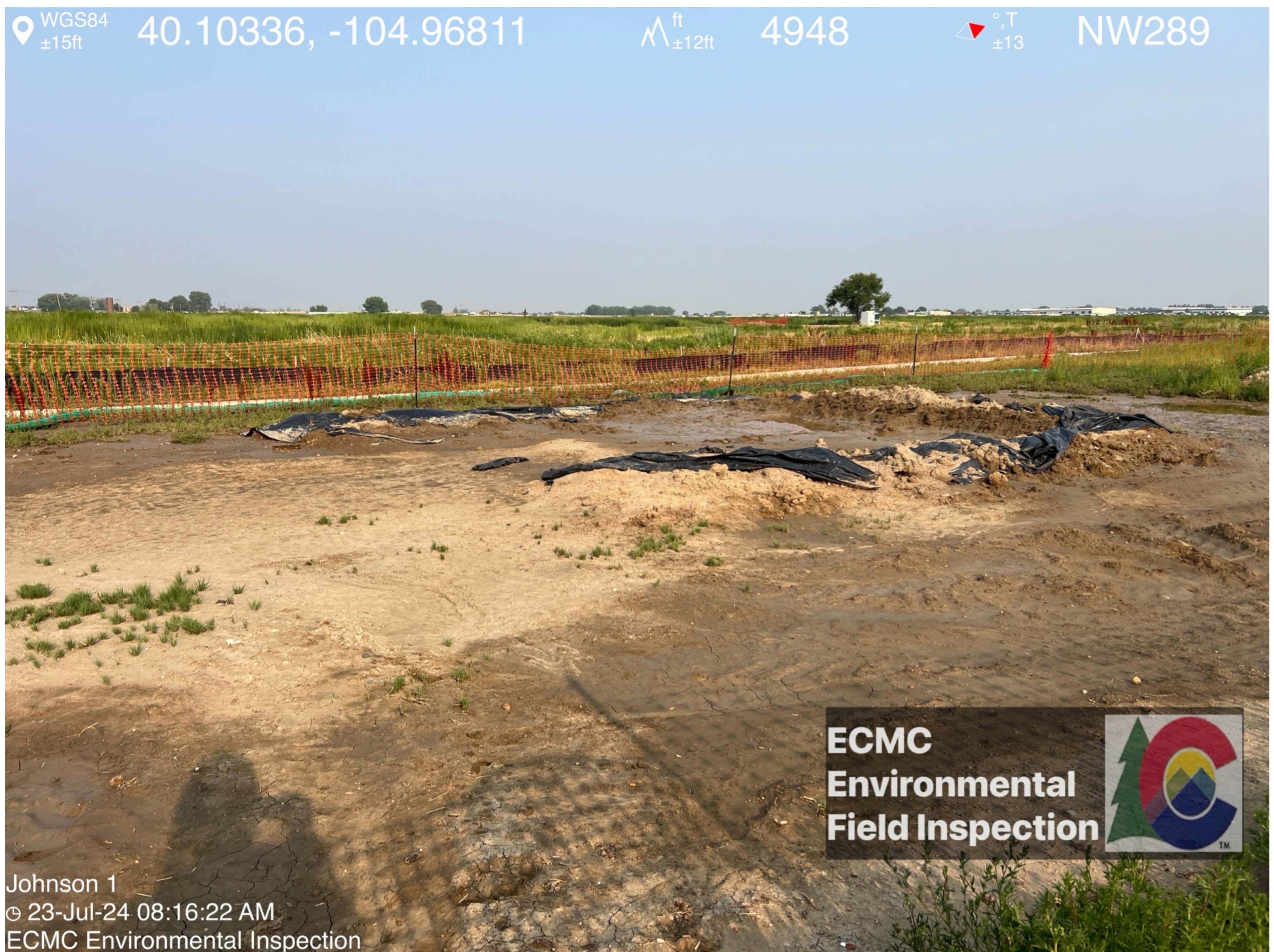
Contaminated Soil (E&P Waste) Stockpile with inadequate BMPs.