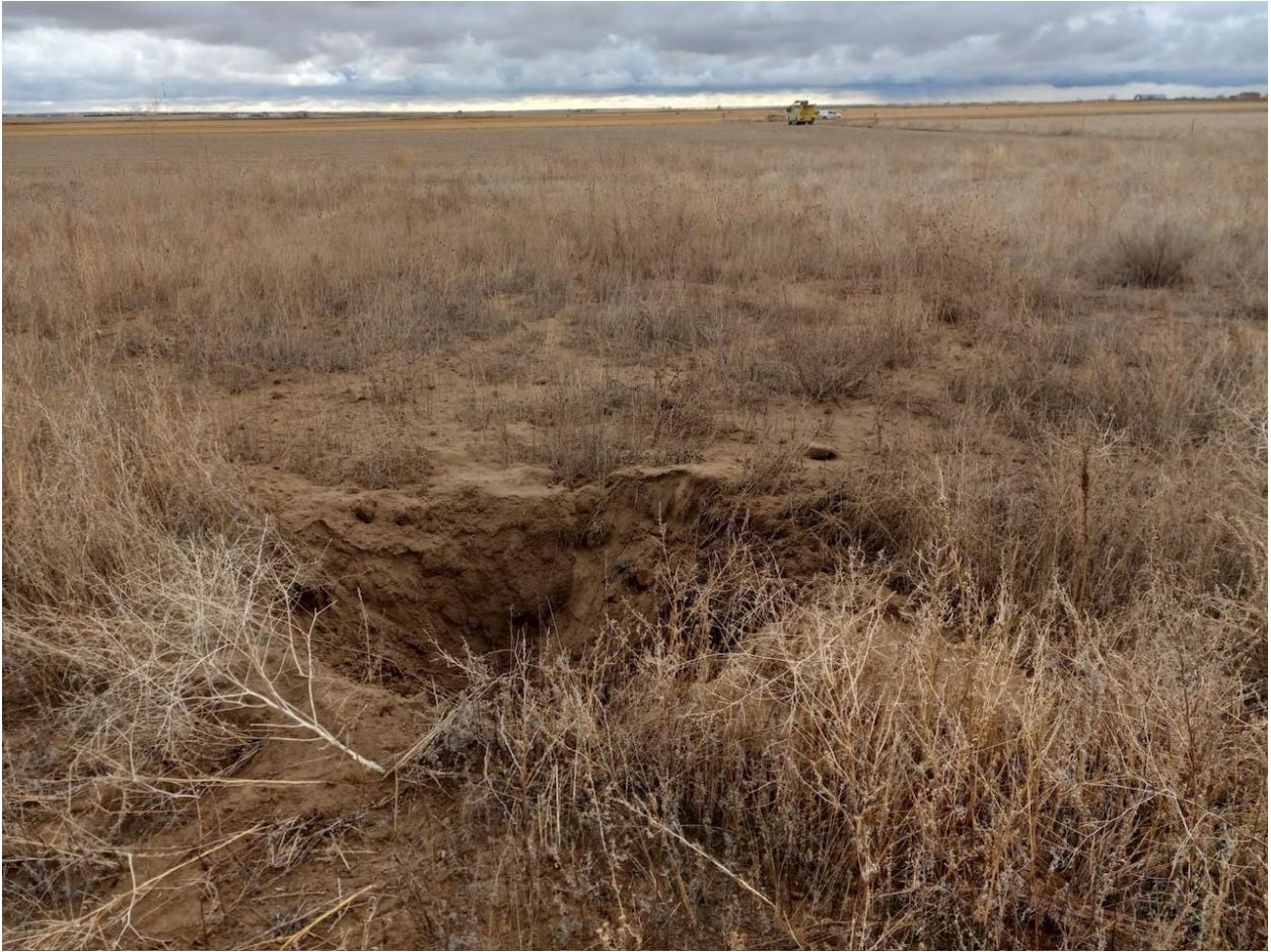
Photo taken after condensate spray was released due to overpressurization, facing east.