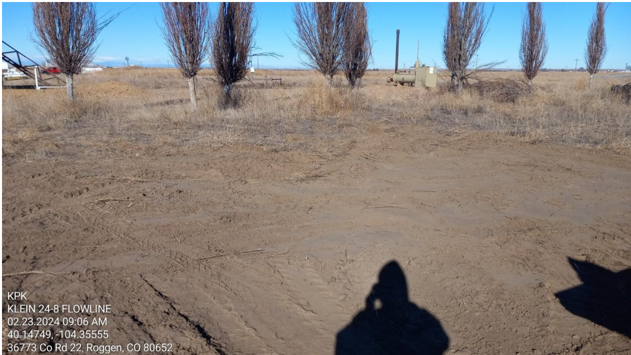
Photo depicts the scrape area after additional scraping was performed. Facing west.