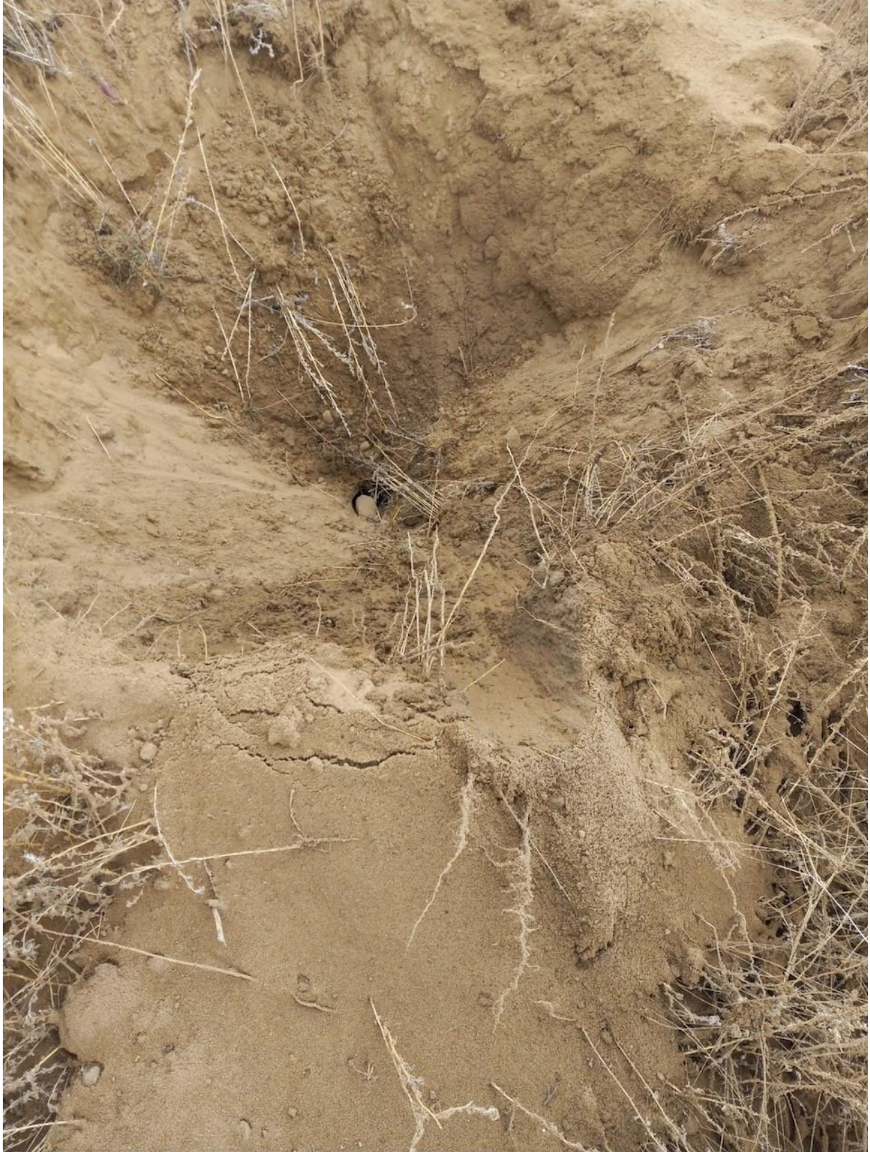
Photo taken facing the earth after condensate spray was released due to overpressurization.