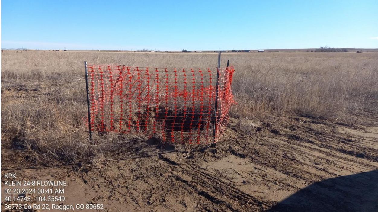
Photo depicts fencing around the location where the condensate mist originated, facing east.