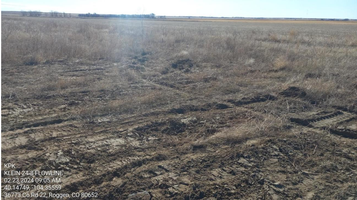
Photo taken facing southeast showing the scrape area after condensate mist was released and soil removed.