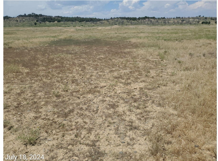
Photo 1: Photos taken from the east end of the Location, facing southwest and northwest. Location is not progressing towards 1004 uniform, perennial vegetative requirements; vegetation is predominantly undesirable plant species.