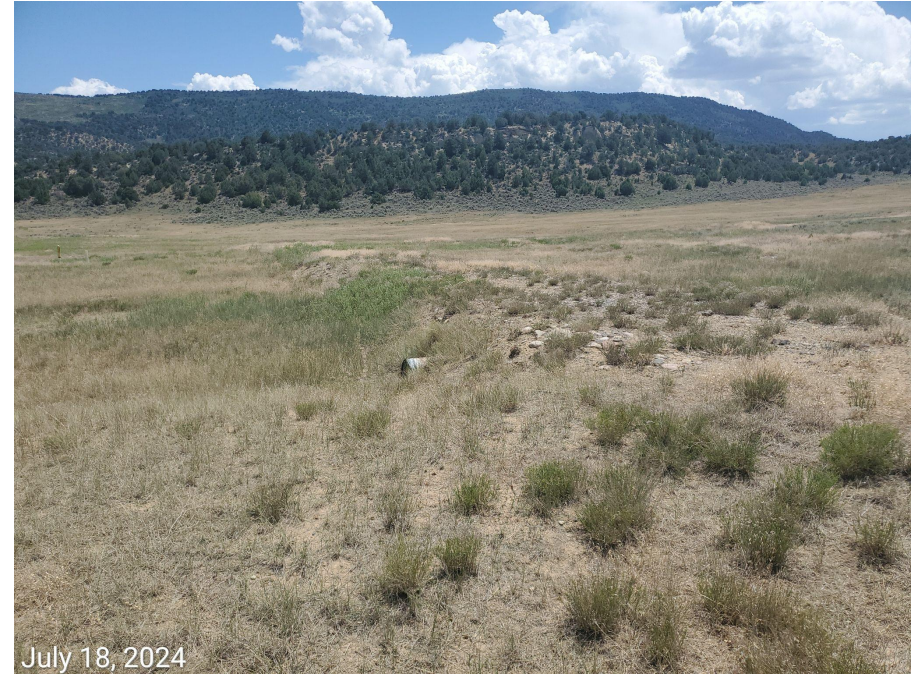
Photo 3: Photo shows reclamation work including, but not limited to, removal of culvert/gravel, compaction alleviation, recontouring/regrading and revegetation activities have not been performed at the access road.