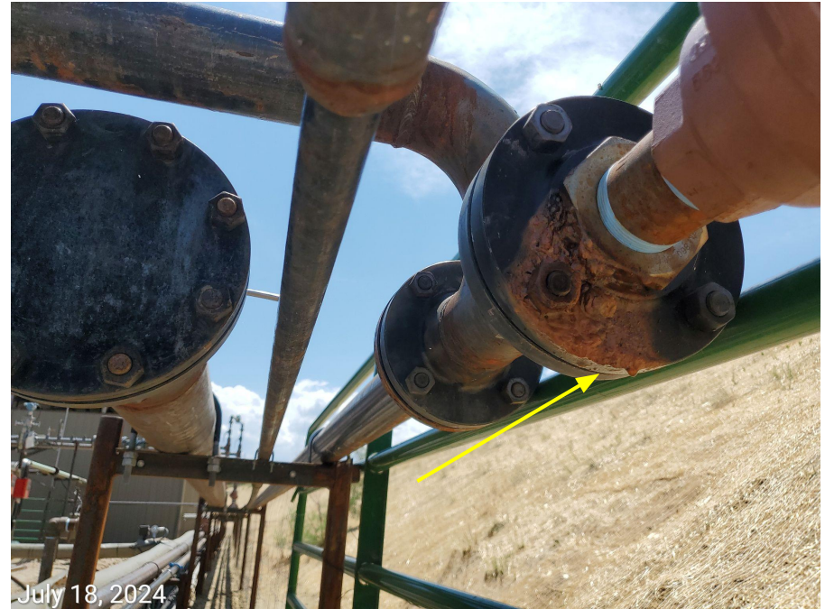
Photo 1: Stained soils have not been cleaned/remediated. Leak at pipe observed.