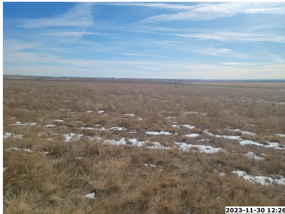
LOCATION PICTURE OF LARKSPUR FED WELL PAD - CAMERA VIEW SOUTH