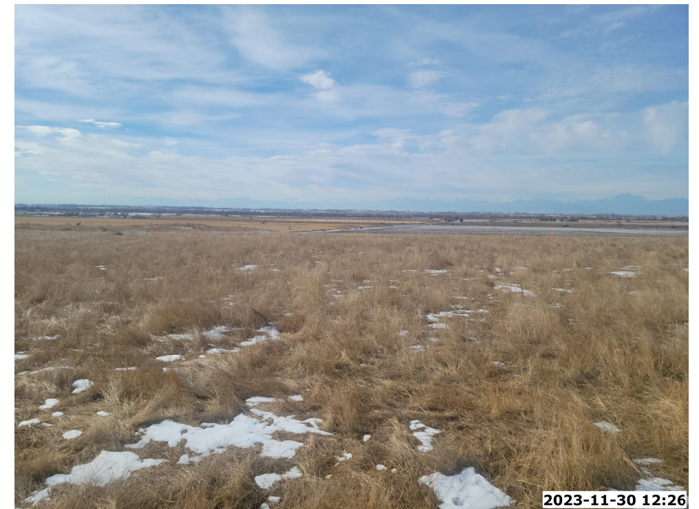
LOCATION PICTURE OF LARKSPUR FED WELL PAD - CAMERA VIEW WEST

K:\AMDRK\2023\2023_IDS_LARKSPUR_FED_T2N_R66W_SEC_5\DWG\LARKSPUR_FED_T2N_R66W_SEC_5.dwg, 3/8/2024 3:07:04 PM, s.sundberg