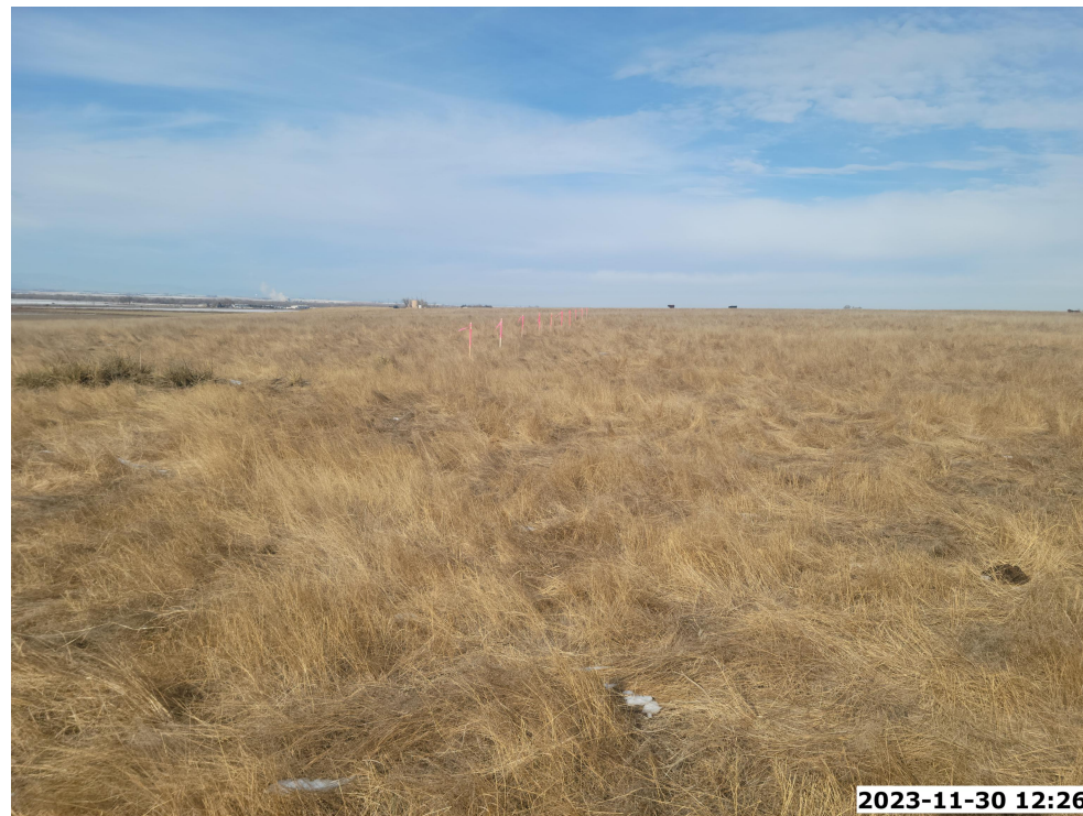
LOCATION PICTURE OF LARKSPUR FED WELL PAD - CAMERA VIEW NORTH

S1/2 NW1/4 SECTION 5, TOWNSHIP 2 NORTH, RANGE 66 WEST, 6TH P.M., WELD COUNTY, COLORADO