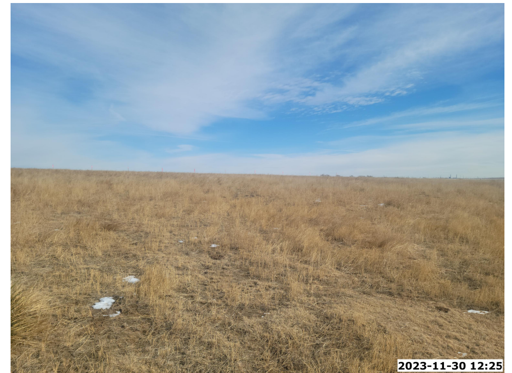
LOCATION PICTURE OF LARKSPUR FED WELL PAD - CAMERA VIEW EAST