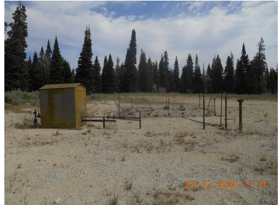
Meter housing and blowdown pit.