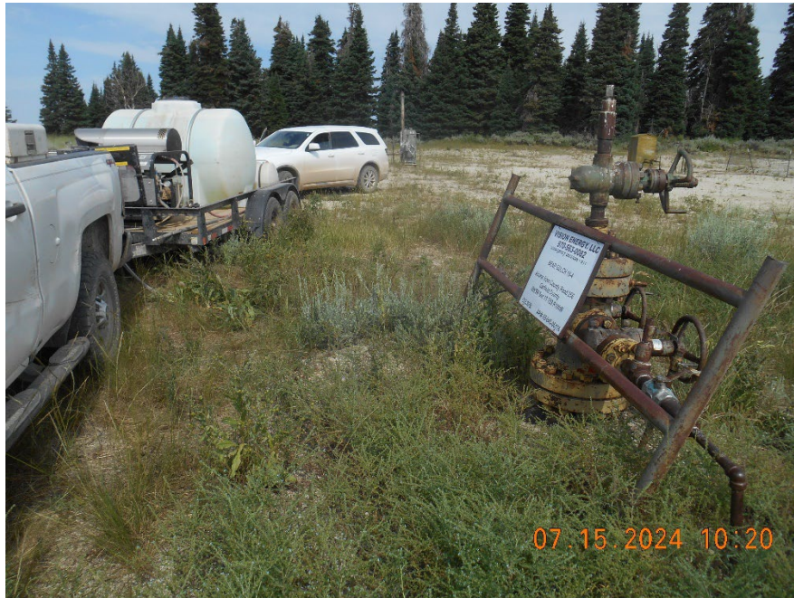
Wellhead during MIT

Inspection Date: 7/15/2024 Inspection Doc#: 693807483