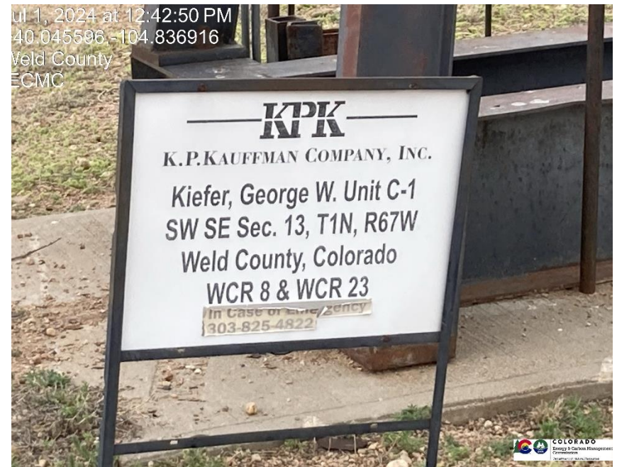
Pic 2 Wellhead sign