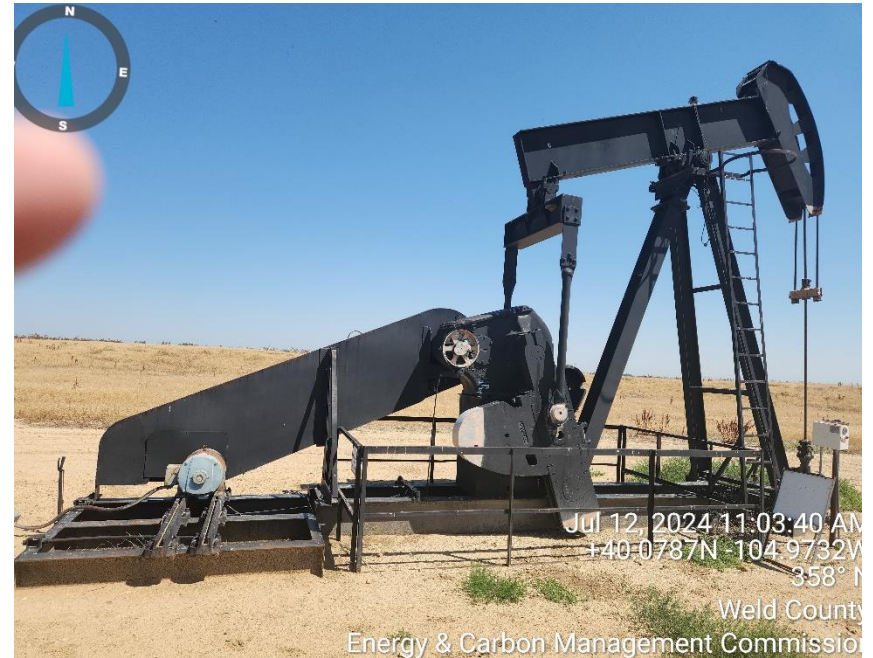
Photo 2 well head and equipment