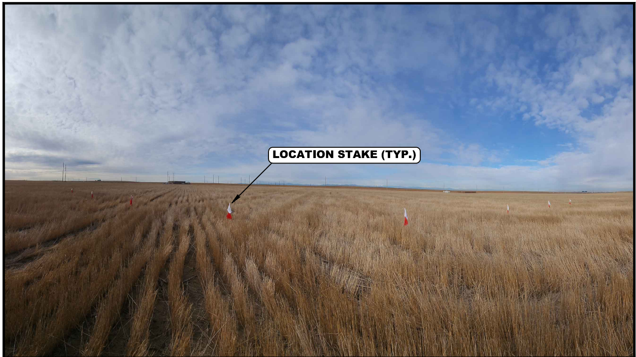
PHOTO: VIEW OF PROPOSED LOCATION