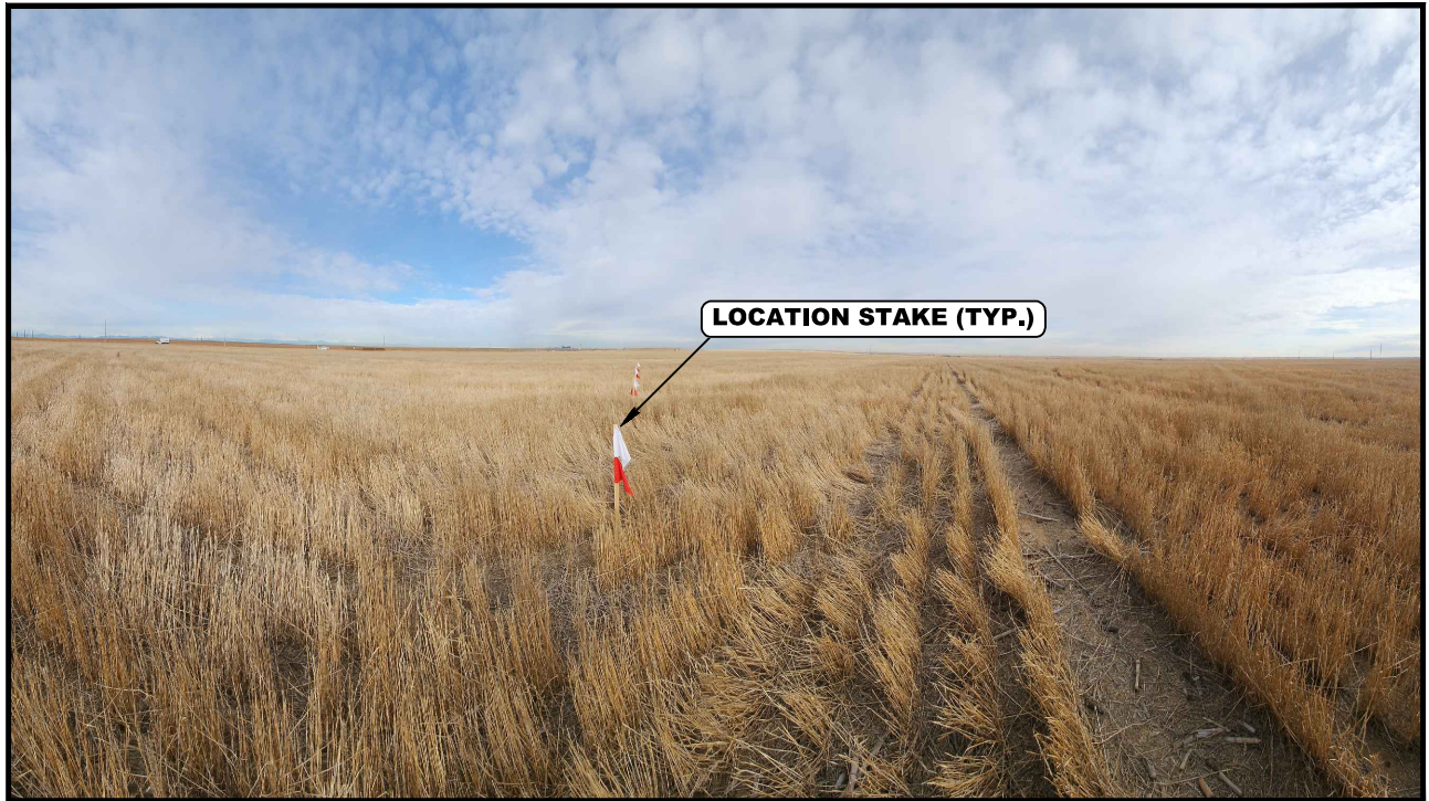
PHOTO: VIEW OF PROPOSED LOCATION