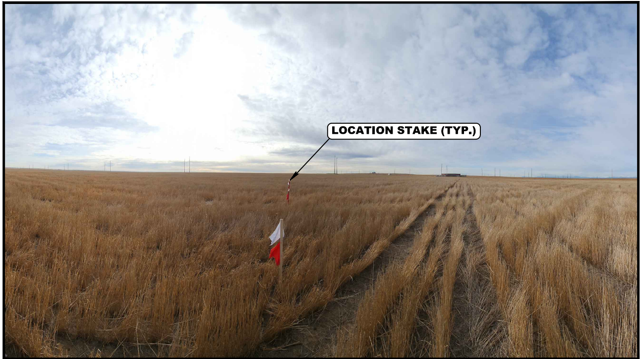
PHOTO: VIEW OF PROPOSED LOCATION