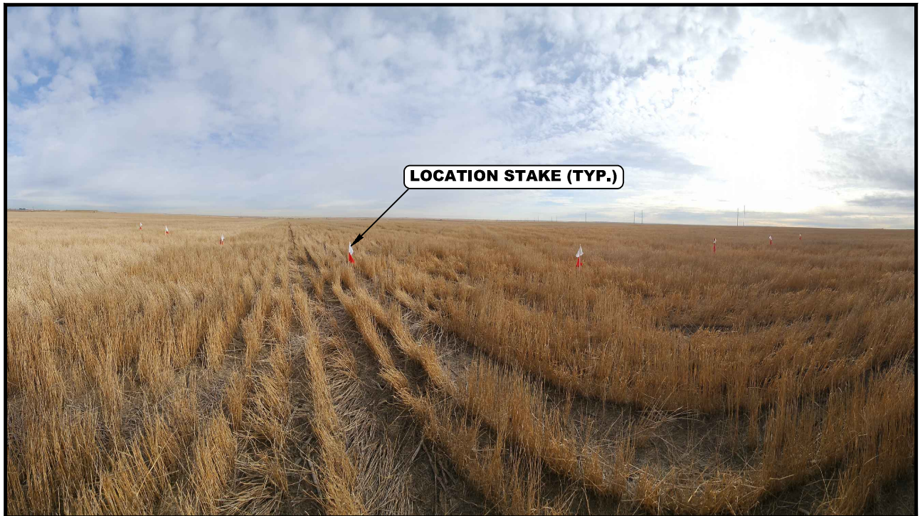
PHOTO: VIEW OF PROPOSED LOCATION