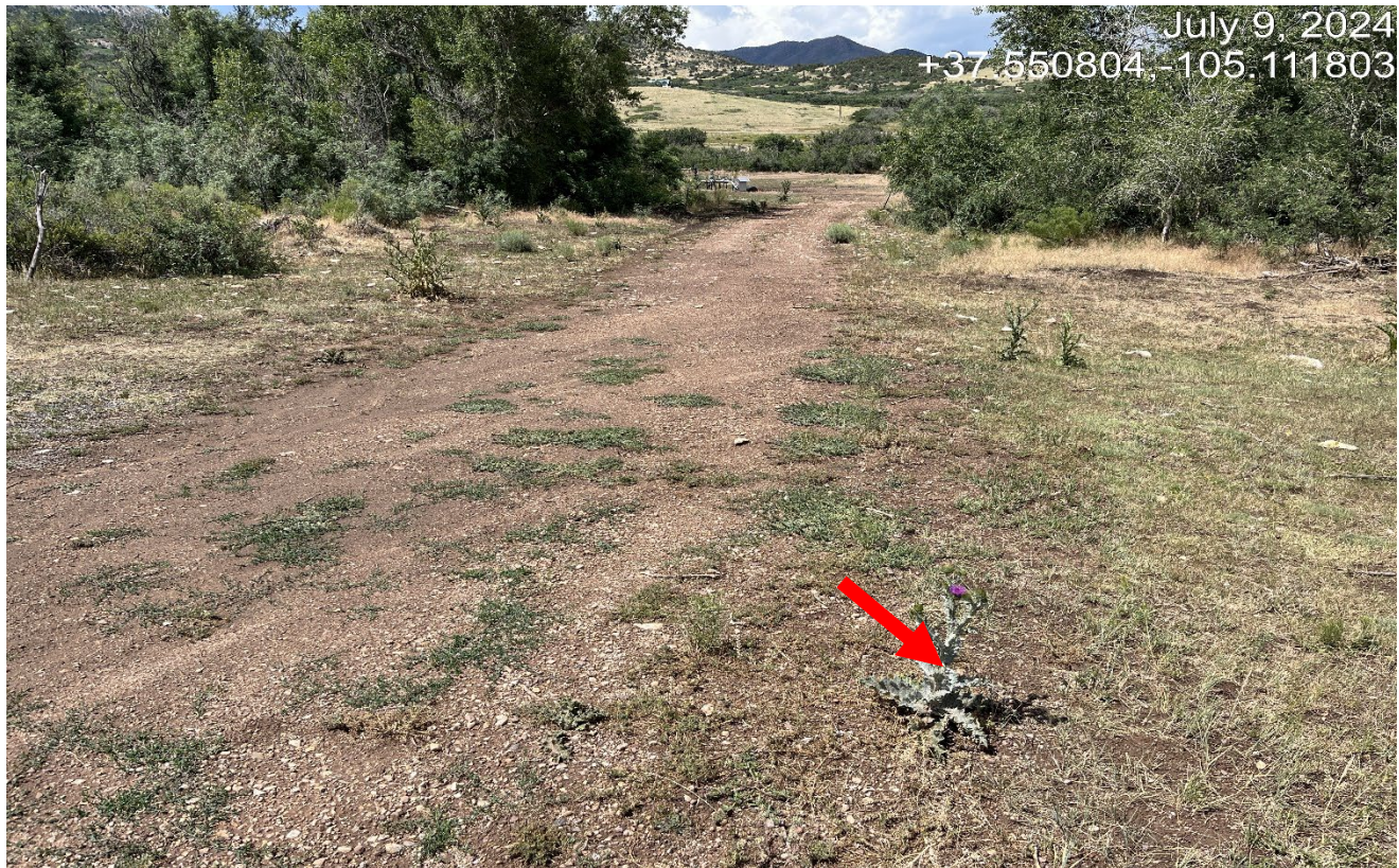
Photo 1. Facing north along the access road. There is noxious weeds along the road that need to be controlled. Red arrow points to Scotch thistle.