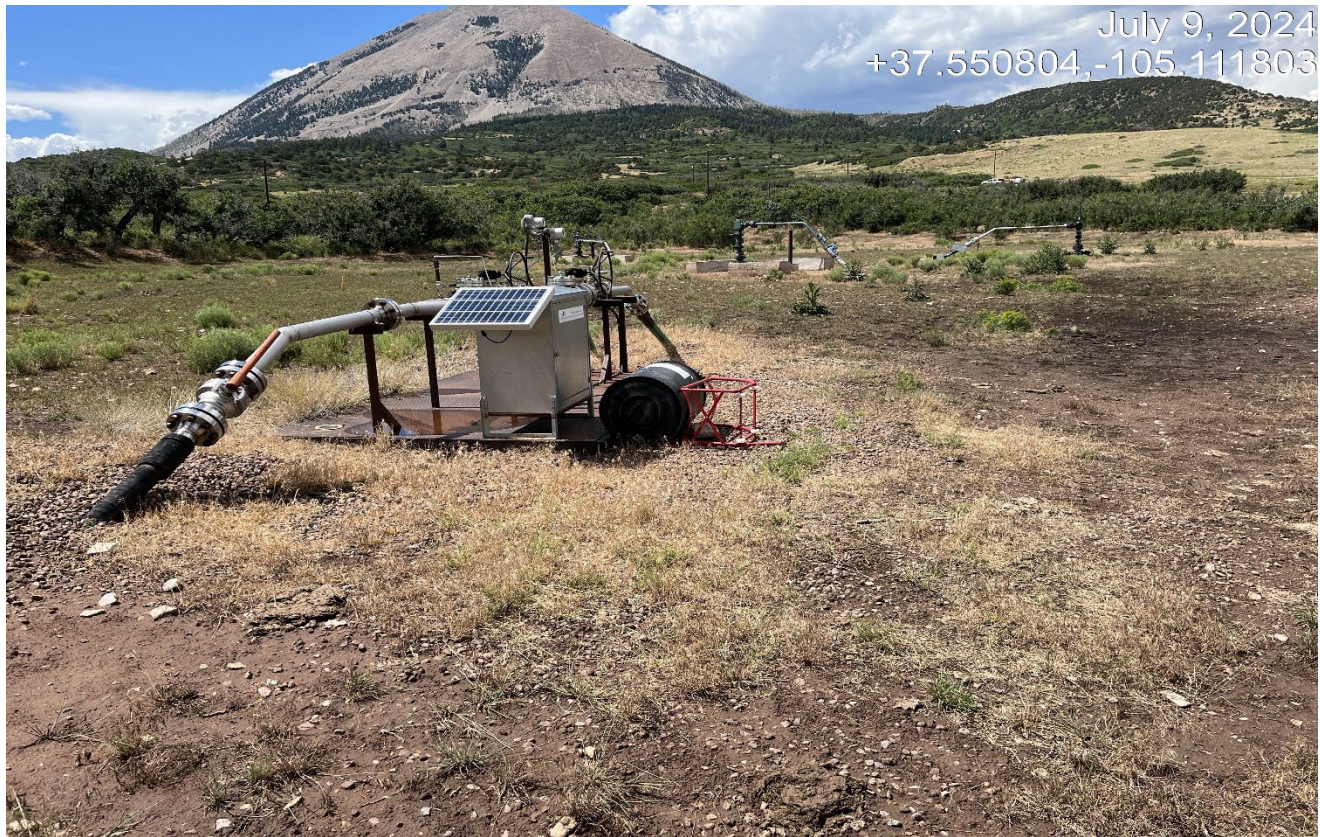
Photo 2. Facing northwest toward the wellsite. The chemical barrel is tipped over and there is no secondary containment. No spills were observed.