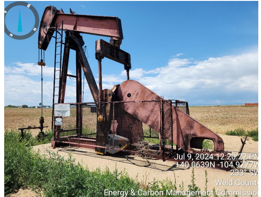
Photo 2 well head and equipment