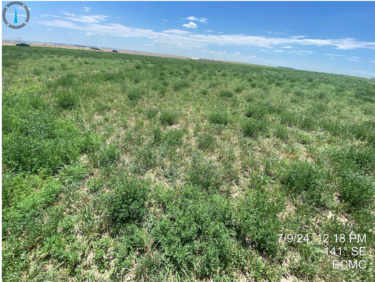
Photo 5. Non-uniform vegetation cover and undesirable vegetation (kochia) observed near one of the flowline potholes.