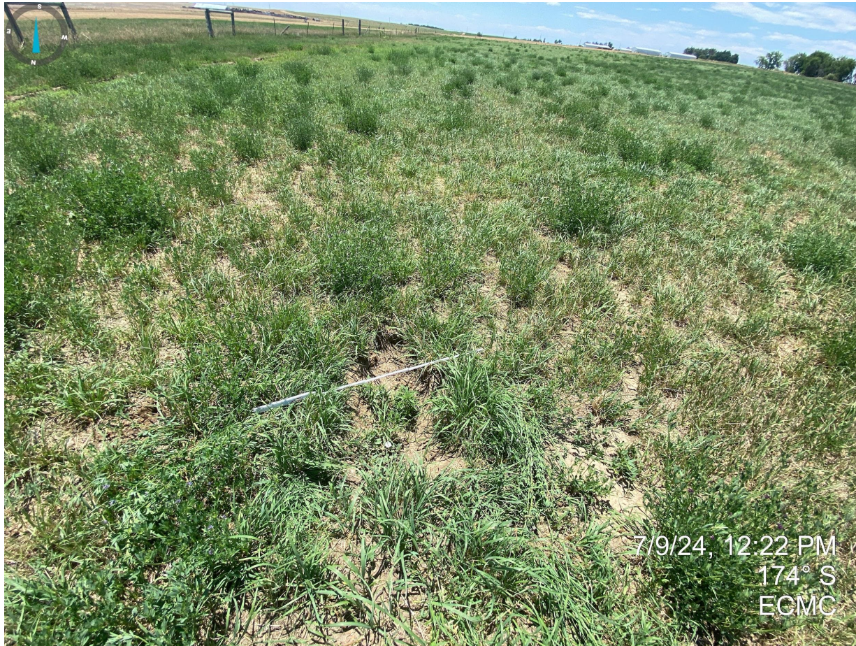
Photo 8. Subsidence observed at one of the flowline potholes.