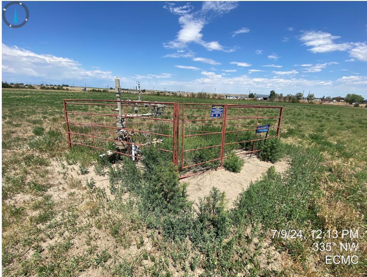
Photo 1. Undesirable vegetation (kochia) observed near the Warner 4-18 (API 123-23565).