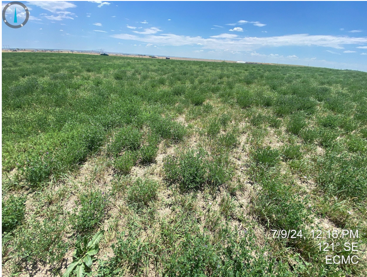
Photo 3. Photo taken east of wellhead. Non-uniform vegetation cover observed near one of the flowline potholes.