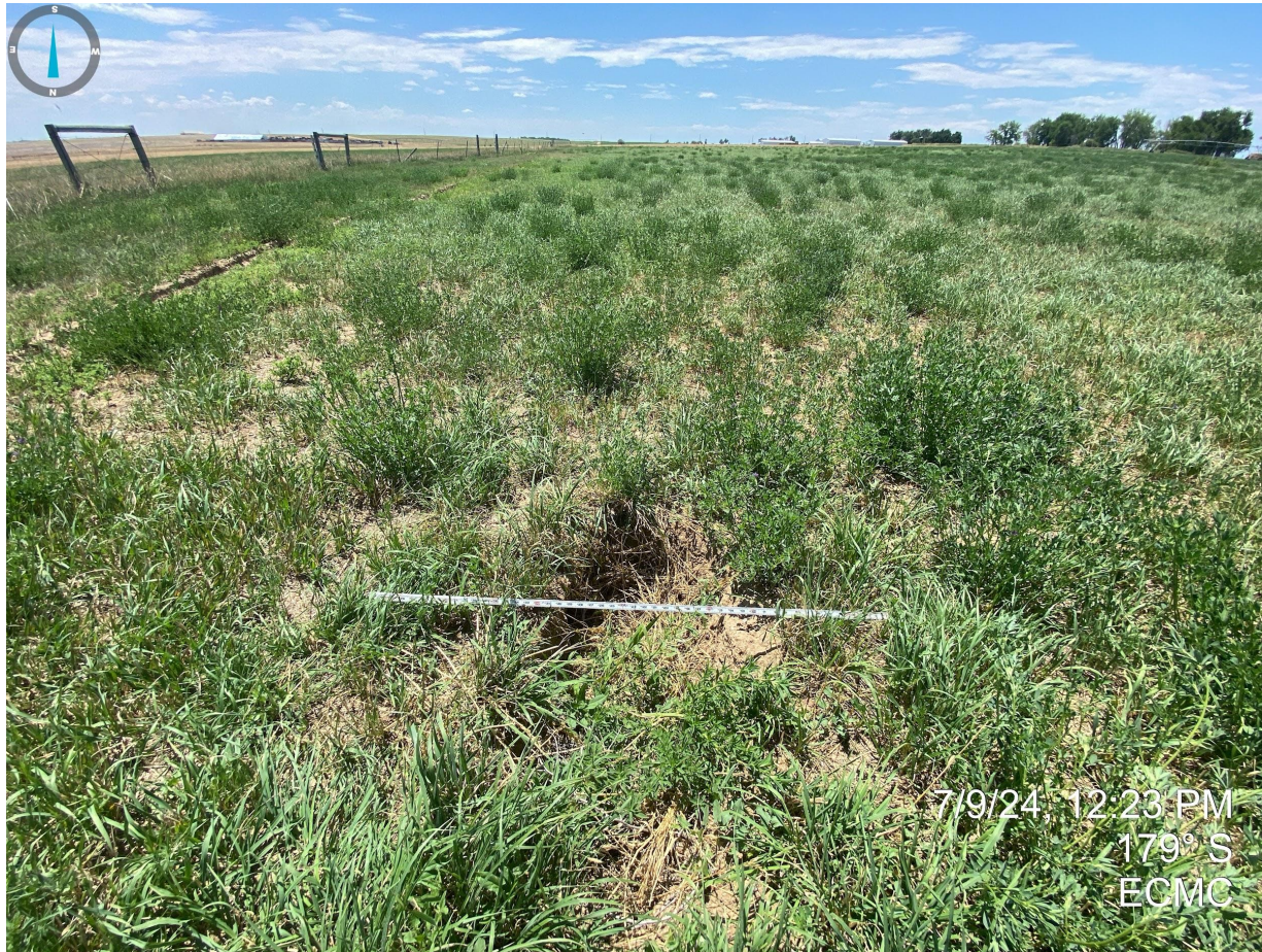
Photo 9. Subsidence observed at one of the flowline potholes.