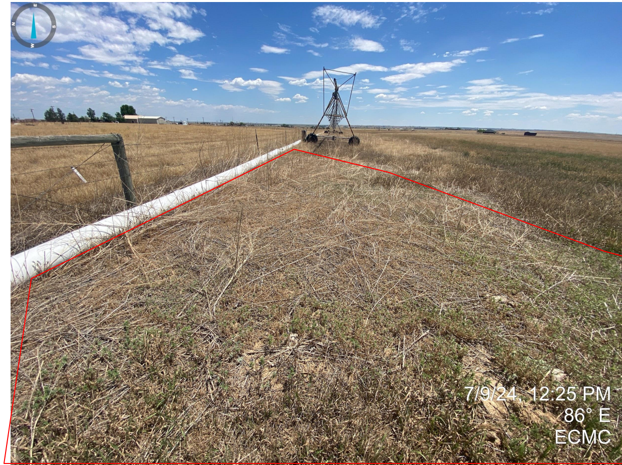
Photo 10. Undesirable vegetation (kochia) observed near one of the flowline potholes.