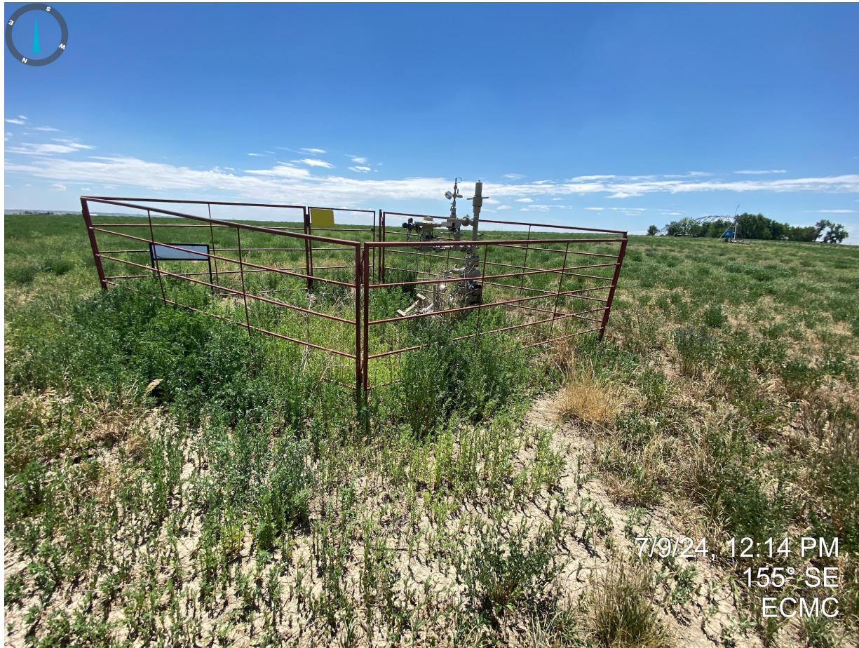
Photo 2. Facing southeast near the wellhead; see comments in Photo 1.