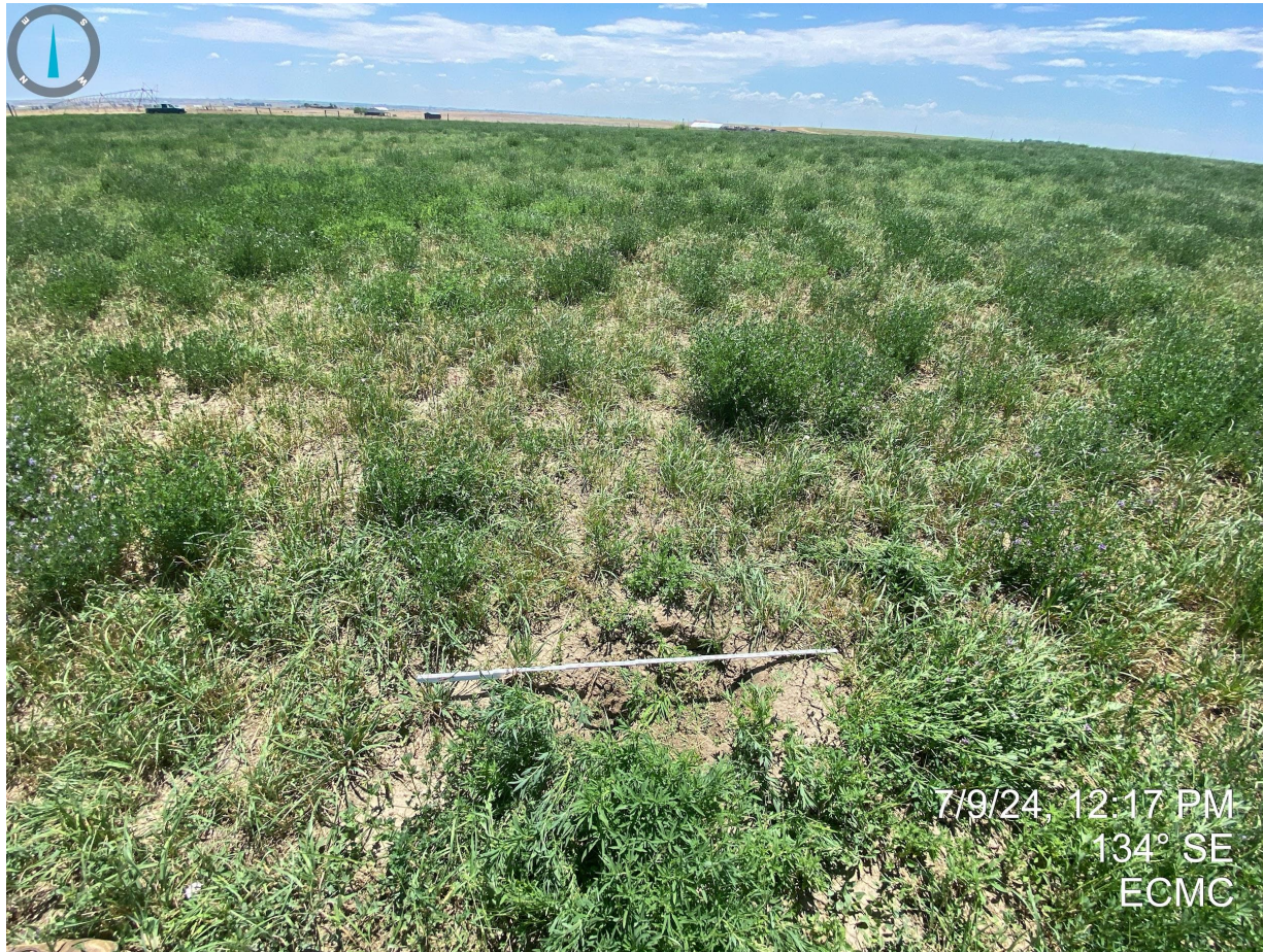
Photo 4. Subsidence and undesirable vegetation (kochia) observed near one of the flowline potholes.