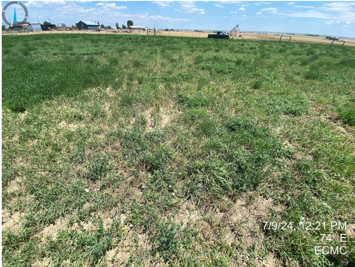
Photo 6. Subsidence, non-uniform vegetation cover and undesirable vegetation (kochia) observed at one of the flowline potholes.