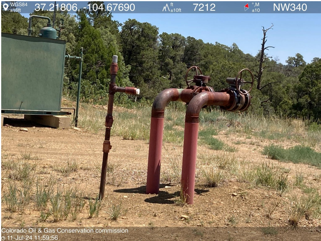
PHOTO 5: UNUSED UNMARKED RISER. REMOVE OR MARK ALL RISERS PER RULE 606.