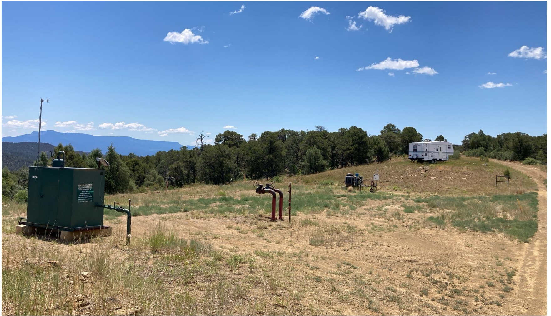
PHOTO 2: LOCATION/ WEEDS NEED MAINTAINED THROUGHOUT THE LOCATION PER RULE 606.