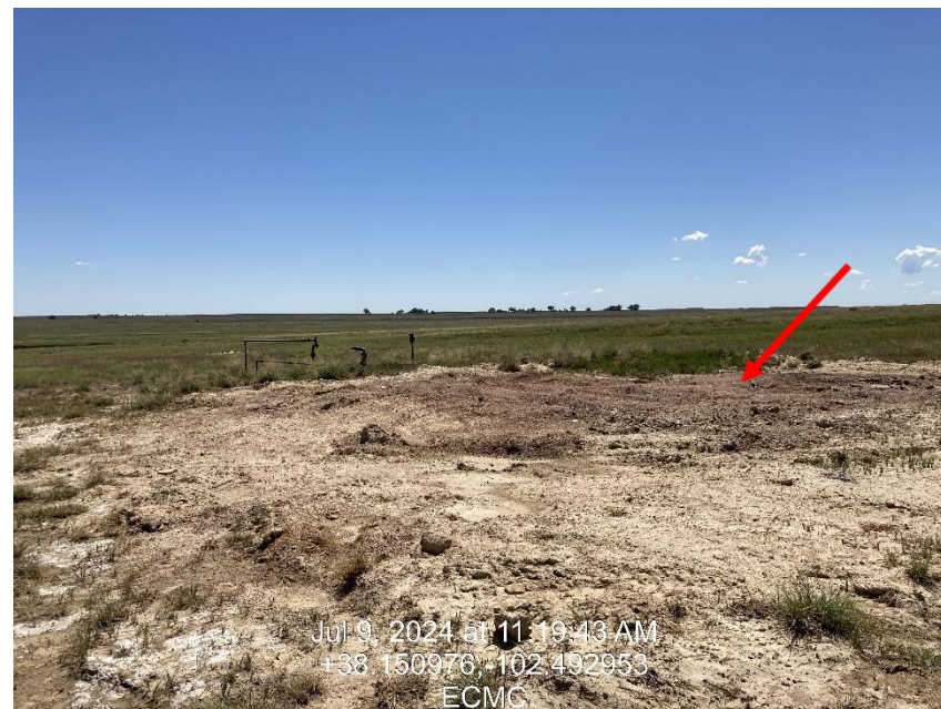
Photo 6 – Area of historical tank battery; Open Remediation # 32251