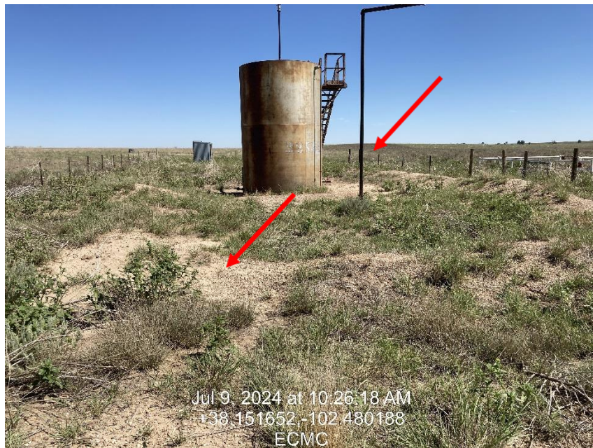
Photo 5 – Unused piping in secondary containment for Tank Battery/ Secondary containment not adequate