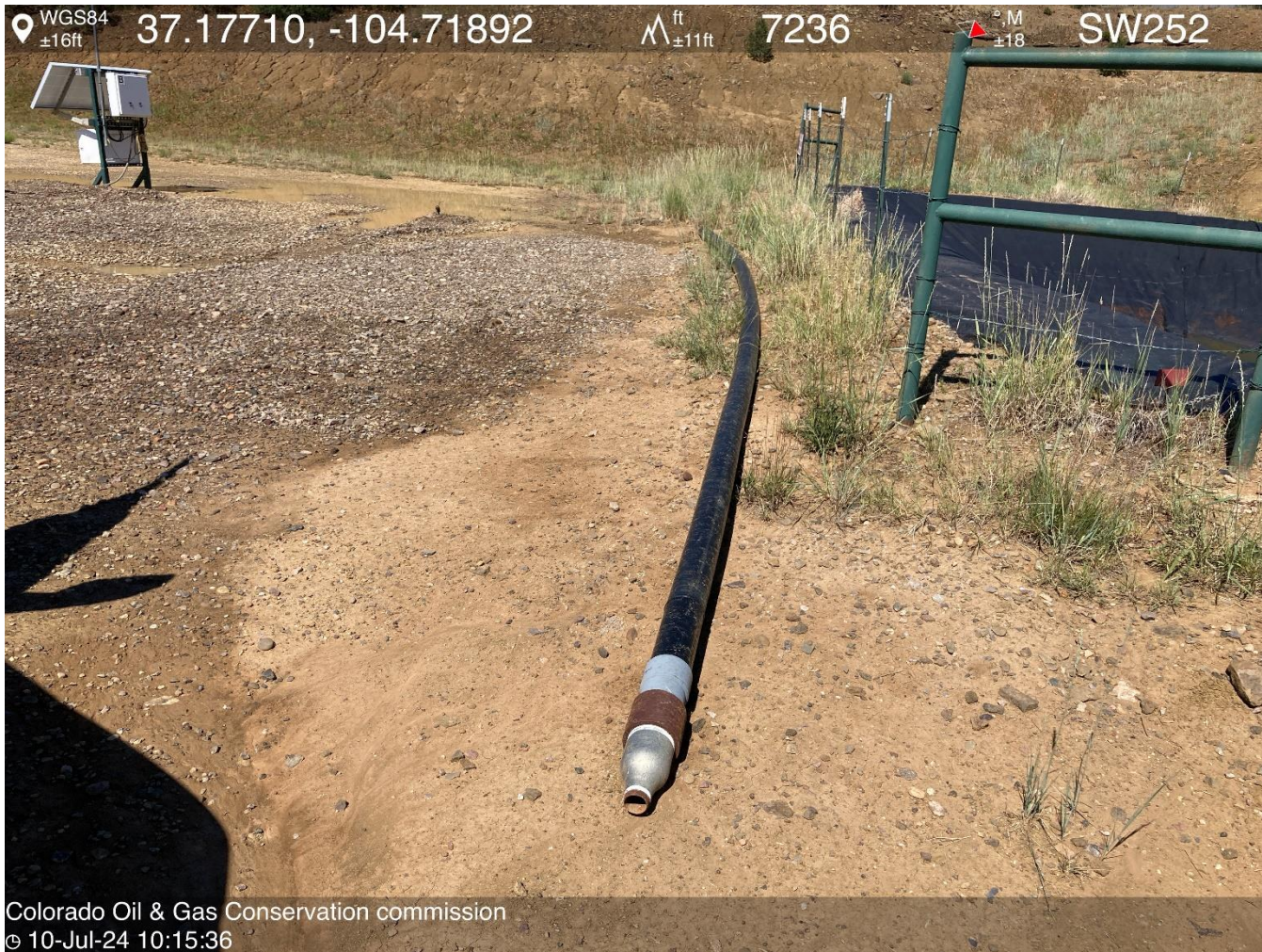
PHOTO 5: UNUSED 3" POLY PIPE STORED ON LOCATION. REMOVE UNUSED EQUIPMENT PER RULE 606.