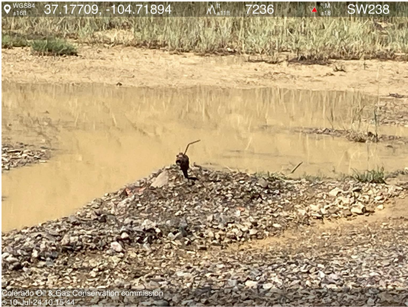
PHOTO 6: UNUSED EQUIPMENT, RISER NOT USED OR MARKED. REMOVE OR MARK ALL RISERS NOT IN USE PER RULE 606.