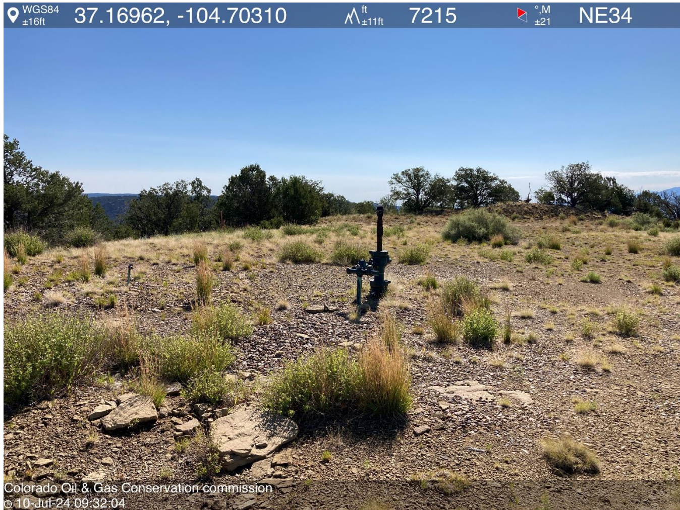
PHOTO 3: GROSSO 13-17 TR WELLHEAD AND EQUIPMENT/ UNUSED UNMARKED RISER NEEDS TO BE MARKED BULLPLUGGED OR REMOVED PER RULE 606.