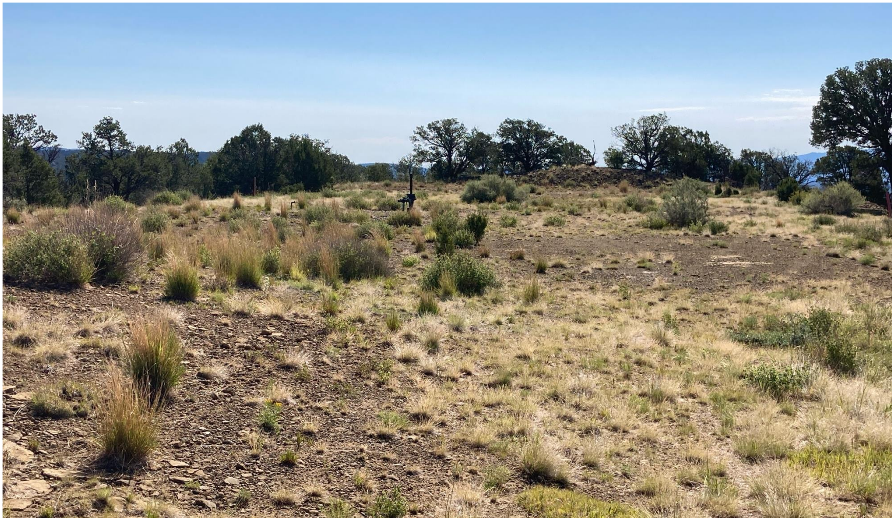
PHOTO 2: GROSSO 13-17 TR LOCATION/ WEEDS NEED TO MAINTAINED ON TA WELL PAD.