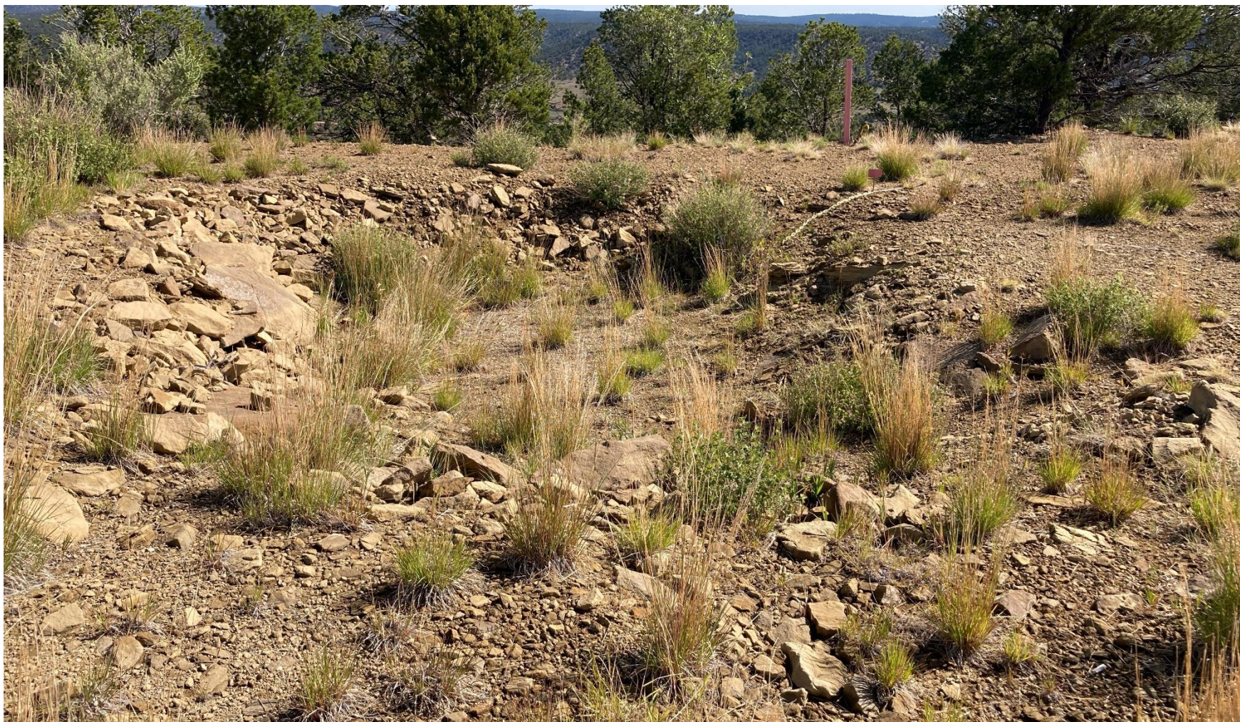
PHOTO 4: GROSSO 13-17 TR PRODUCED WATER PIT. WEEDS NEED MAINTAINED.