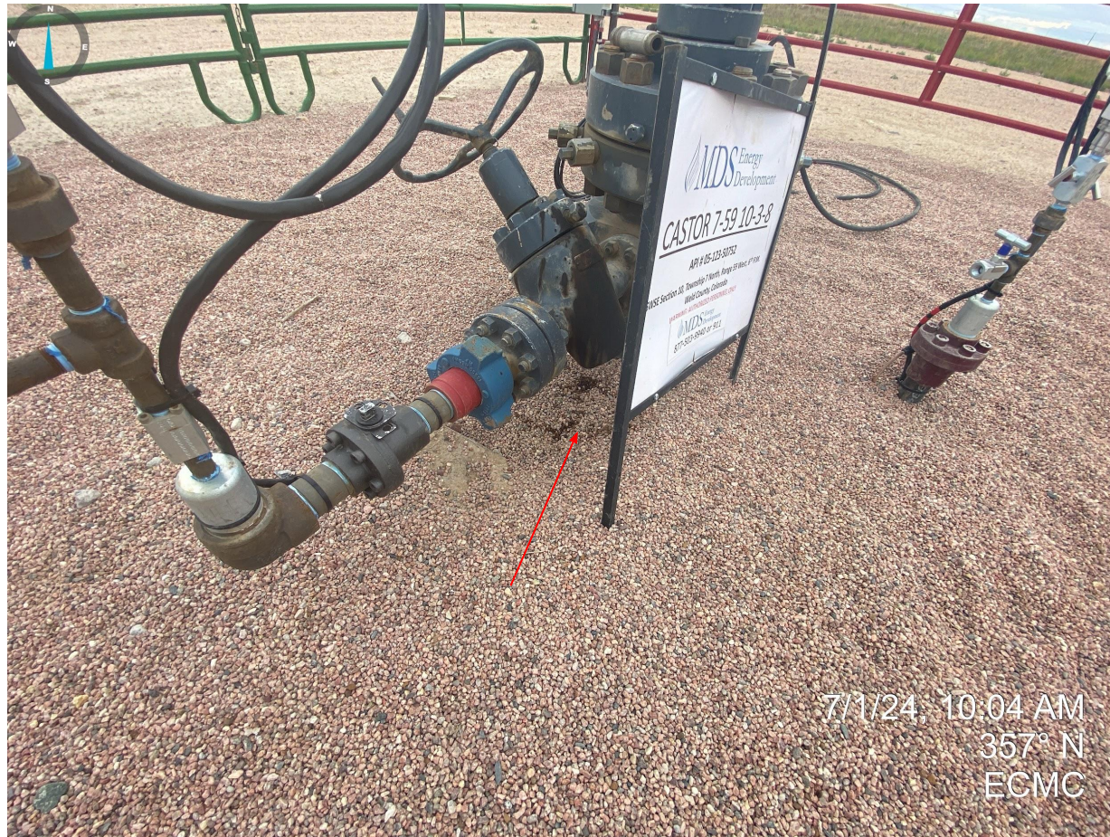
Photo 13. Stained soil observed near wellhead.