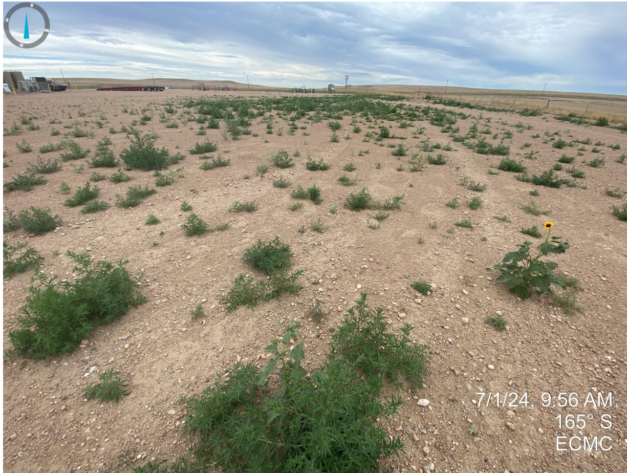
Photo 7. Undesirable vegetation (e.g. kochia and russian thistle) observed on the drilling pad area. Photo taken from the northern portion of the drilling pad.