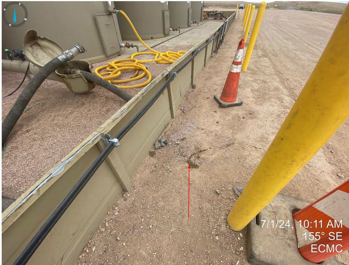
Photo 20. Stained soil observed on west side of tank battery.