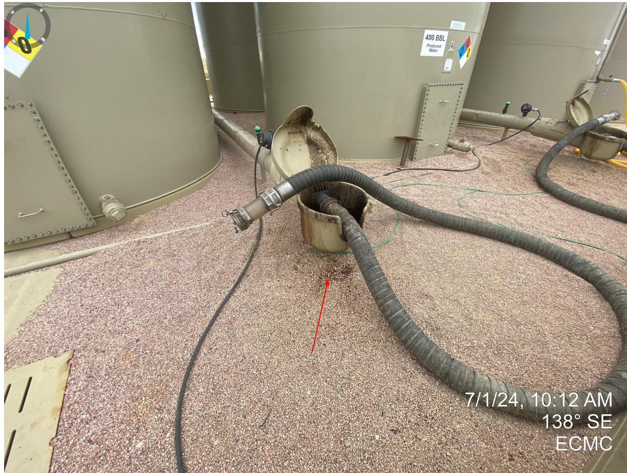
Photo 21. Stained soil within tank battery secondary containment.