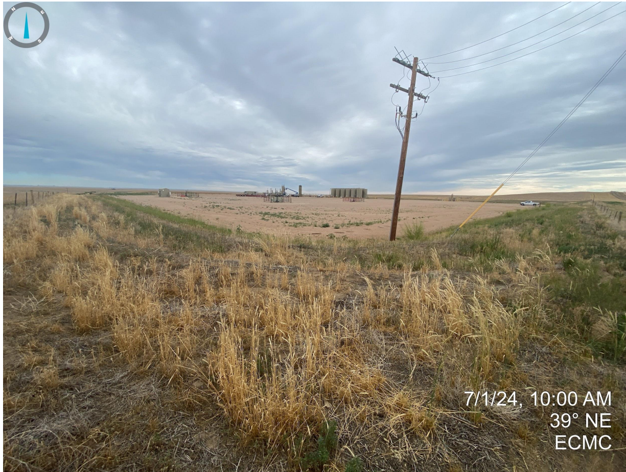
Photo 11. Southwest corner of the location; see comments in Photo 2.