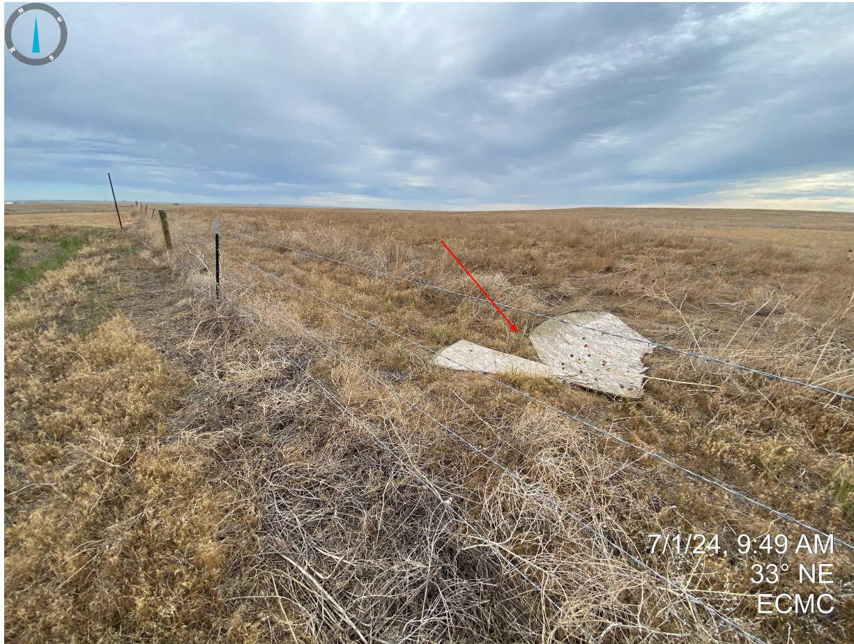
Photo 4. Trash observed in the northeast portion of the location. The Operator shall self-inspect the entire location to identify and dispose of any trash/debris.