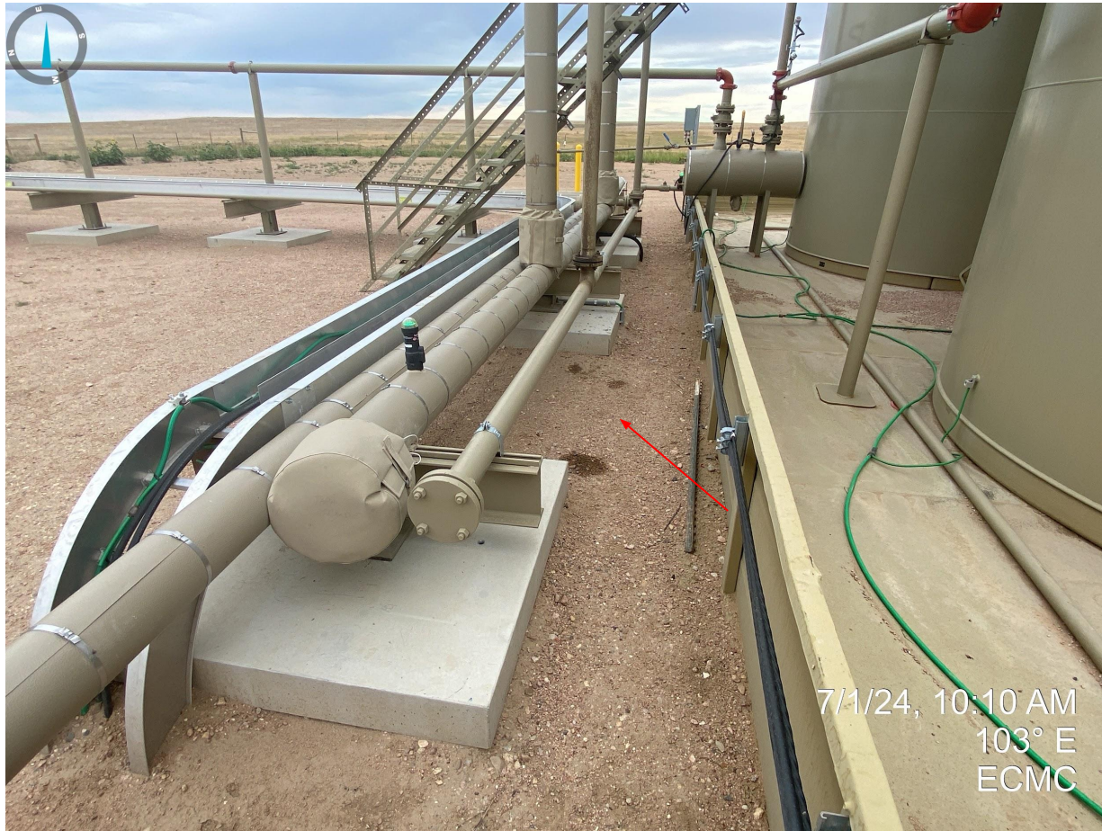
Photo 18. Stained soils observed on north end of tank battery.