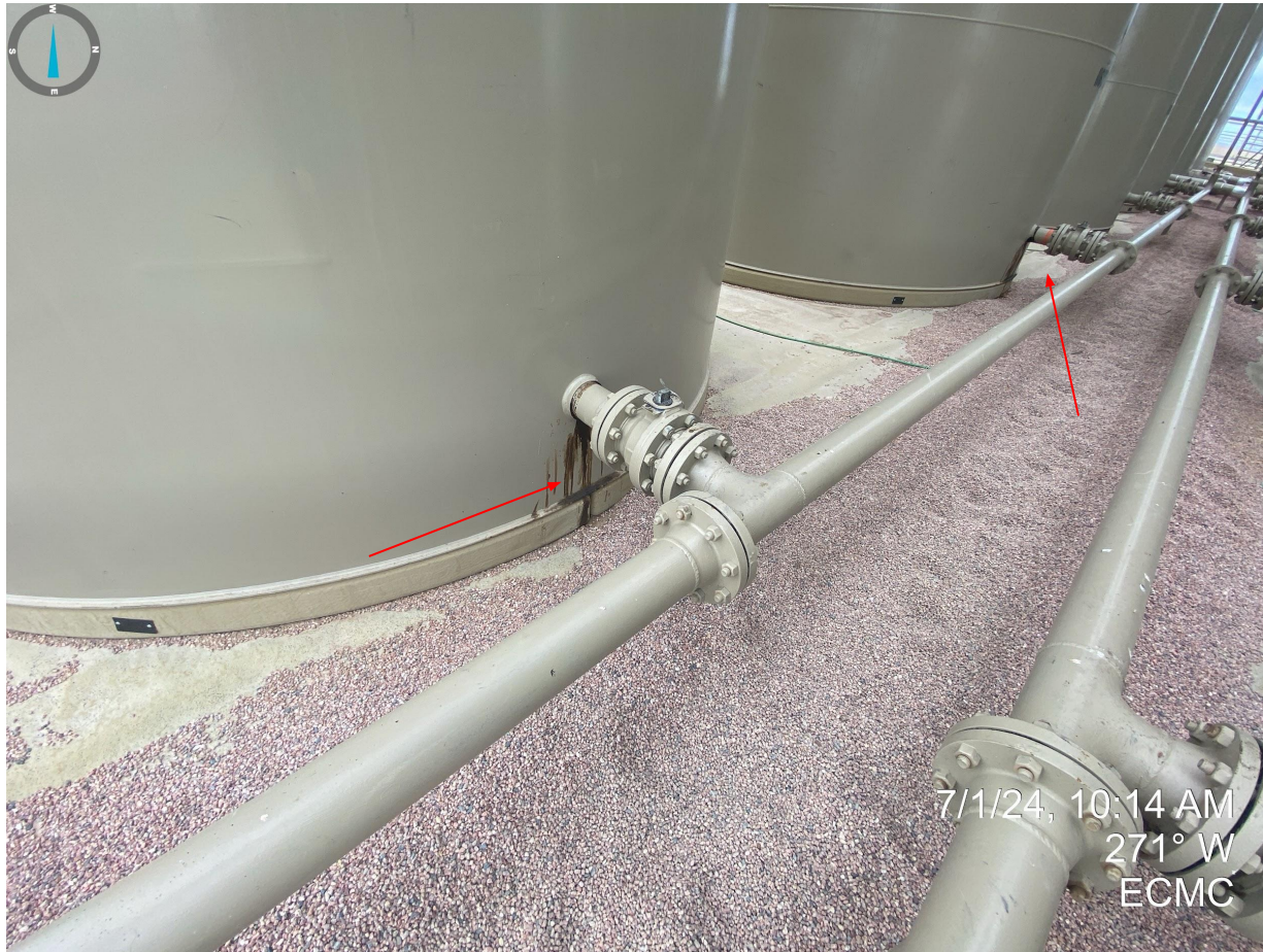
Photo 25. Leaking equipment requires maintenance.