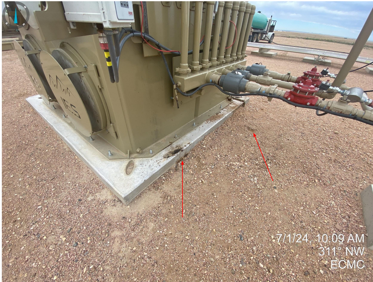
Photo 17. Staining at equipment.