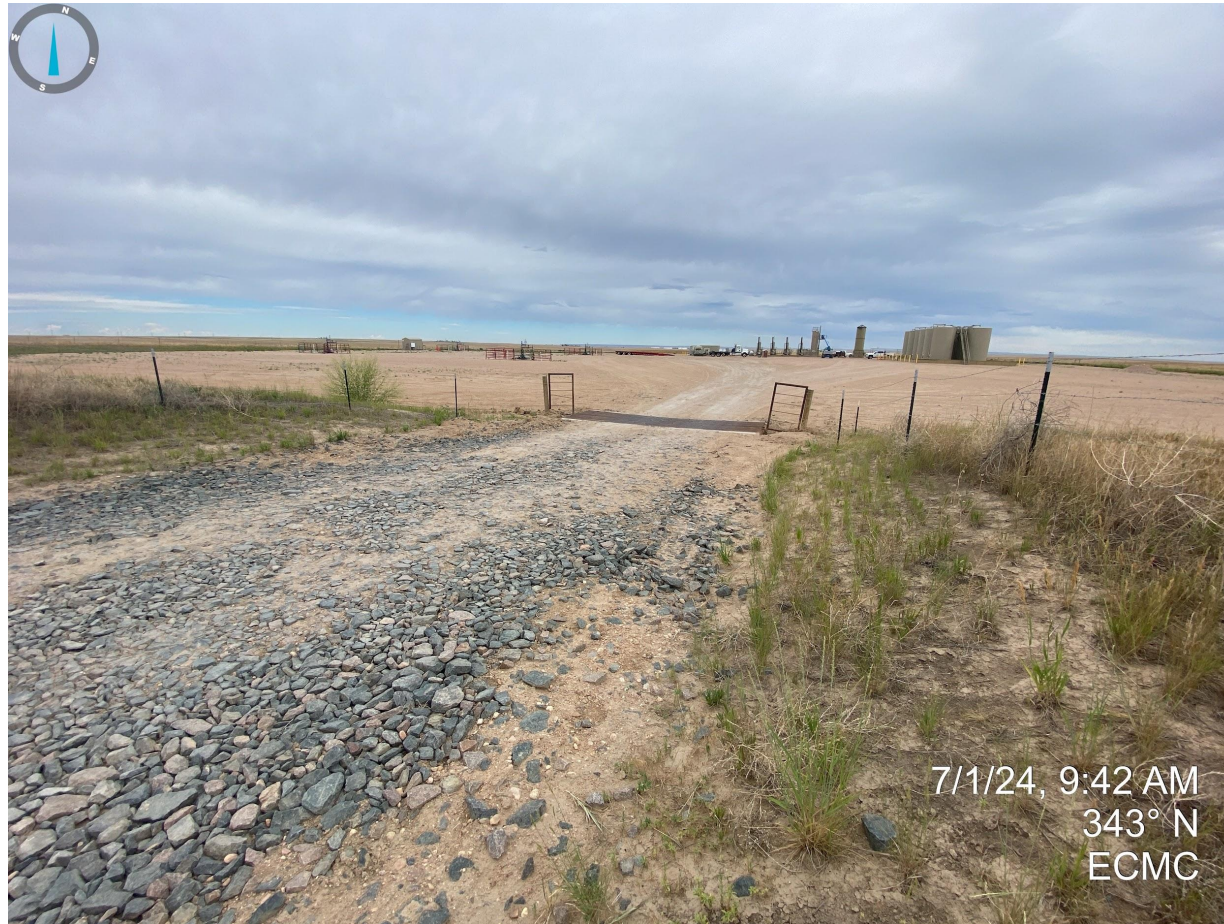
Photo 1. Track out pad is beginning to fill with sediment and requires maintenance.