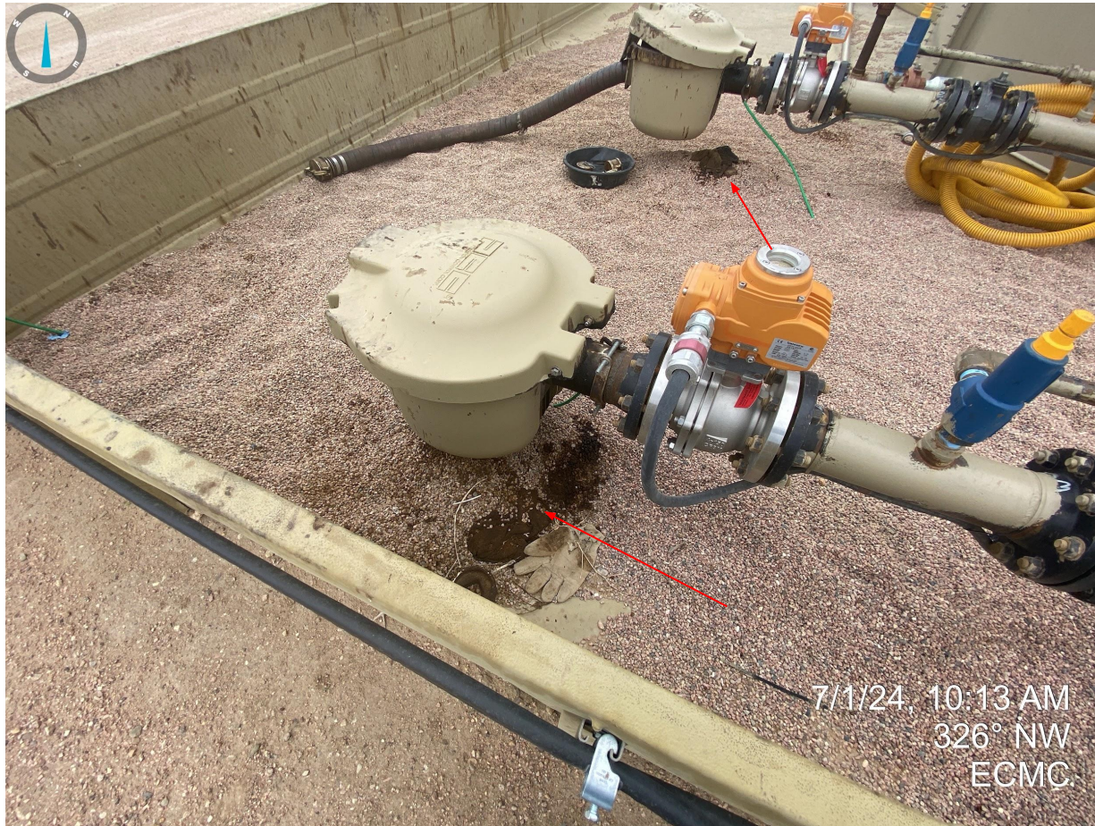
Photo 24. Stained soil within tank battery secondary containment.