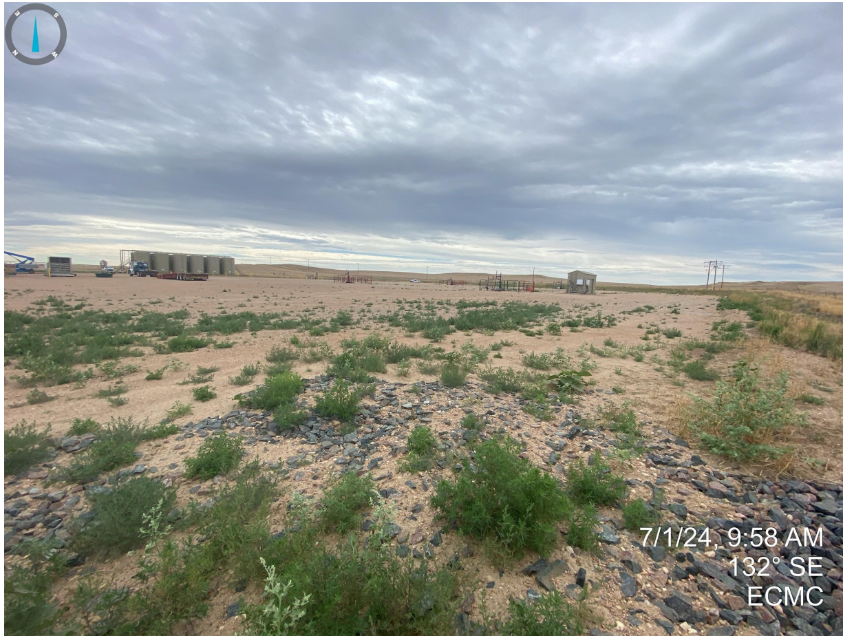
Photo 9. Taken from the western/center portion of the drilling pad, facing southeast. See comments in Photo 7.