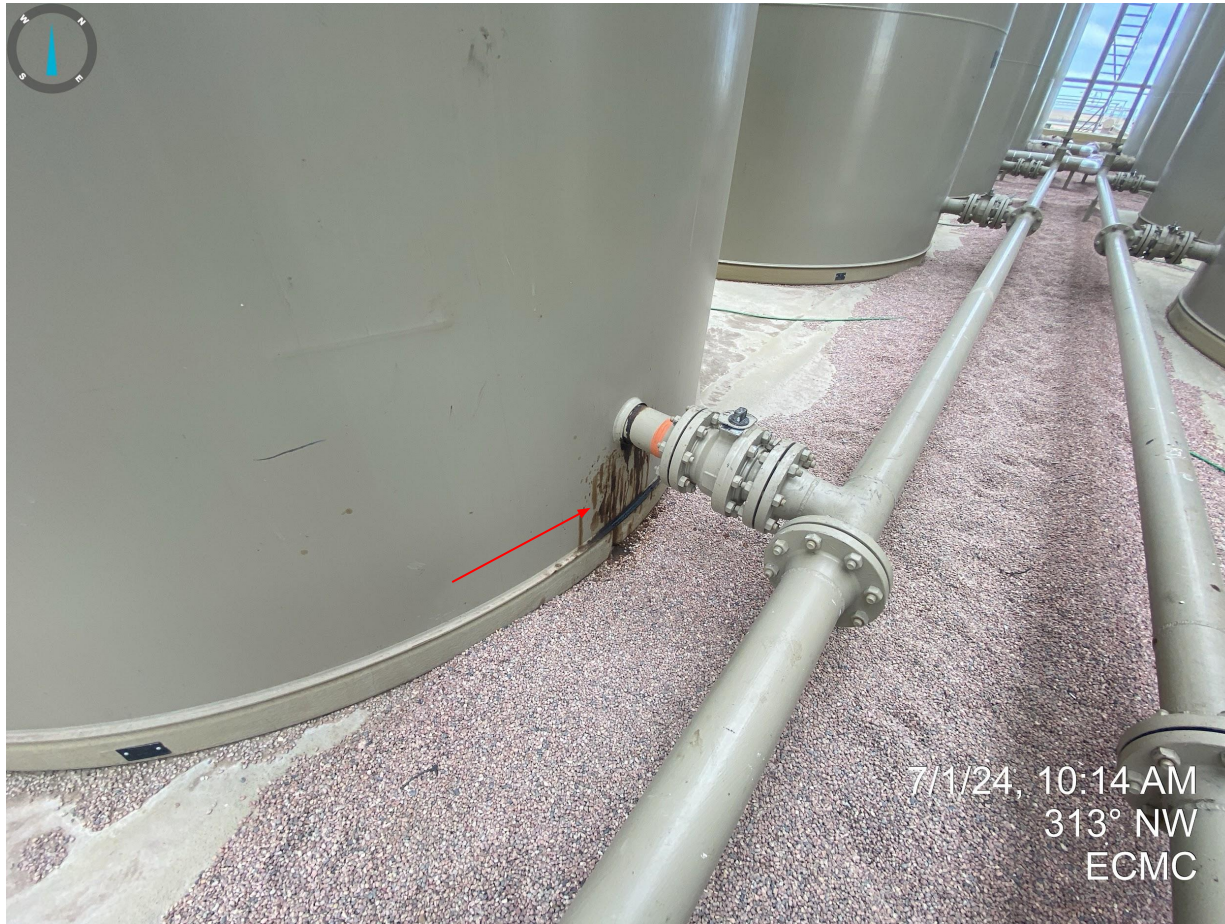
Photo 26. Continued from Photo 25, one tank to the north of previous photo.