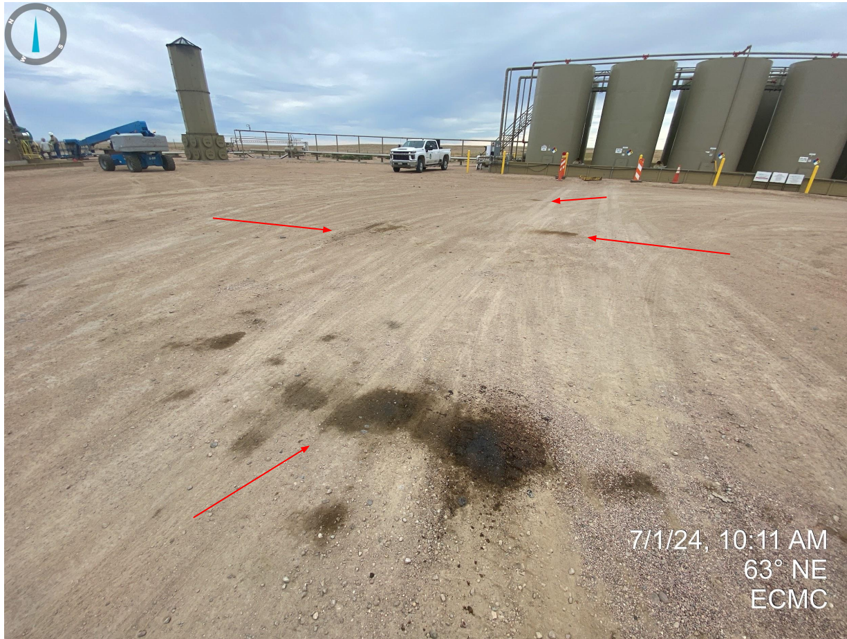
Photo 19. Stained soils observed west of tank battery.