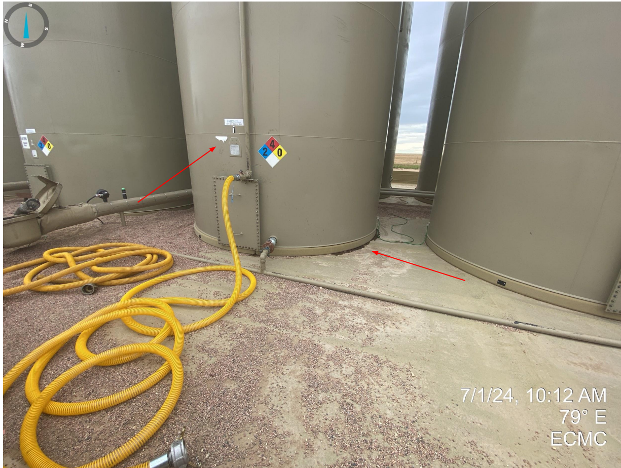
Photo 22. Tank content label missing. Also pictured, staining underneath tank.