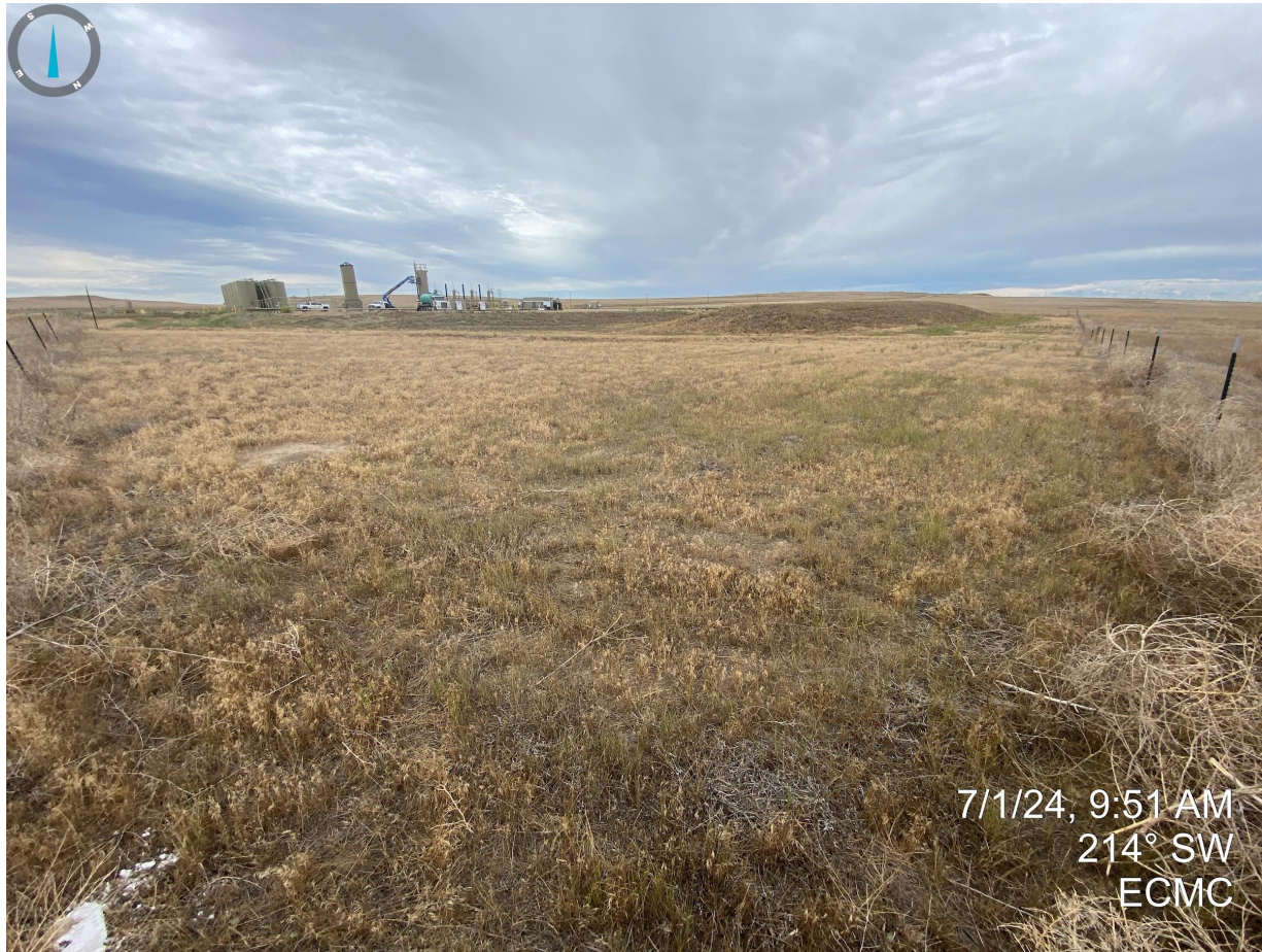
Photo 5. Northeast corner of the location; see comments in Photo 2.