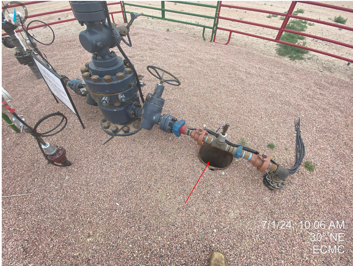
Photo 14. No cover or wildlife protection equipment observed near wellhead rat/mouse hole.