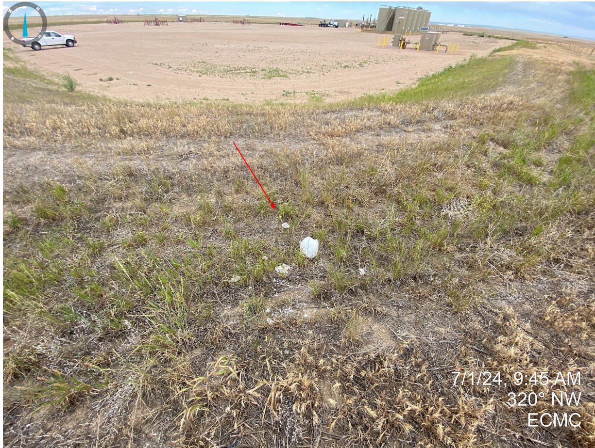
Photo 3. Trash observed in the southeast portion of the location. The Operator shall self-inspect the entire location to identify and dispose of any trash/debris.