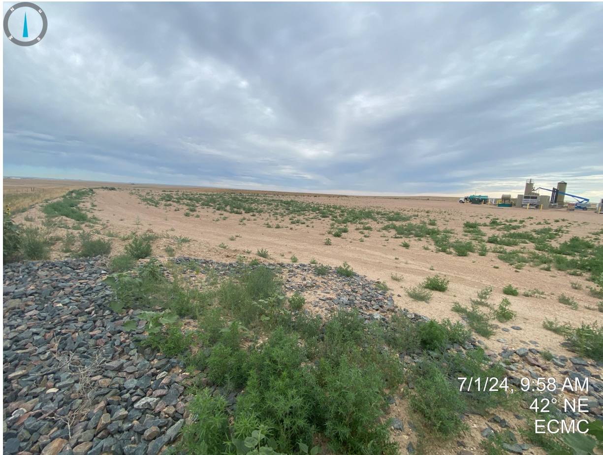
Photo 8. Taken from the western/center portion of the drilling pad, facing northeast. See comments in Photo 7.