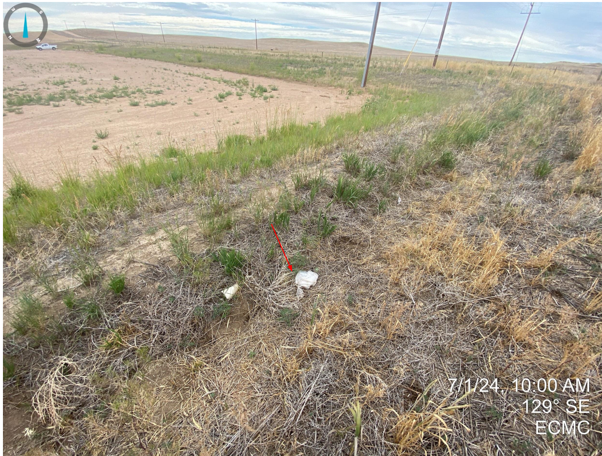
Photo 10. Example of trash/debris observed near the southwest corner of the location. The Operator shall self-inspect the entire location to identify and dispose of any trash/debris.