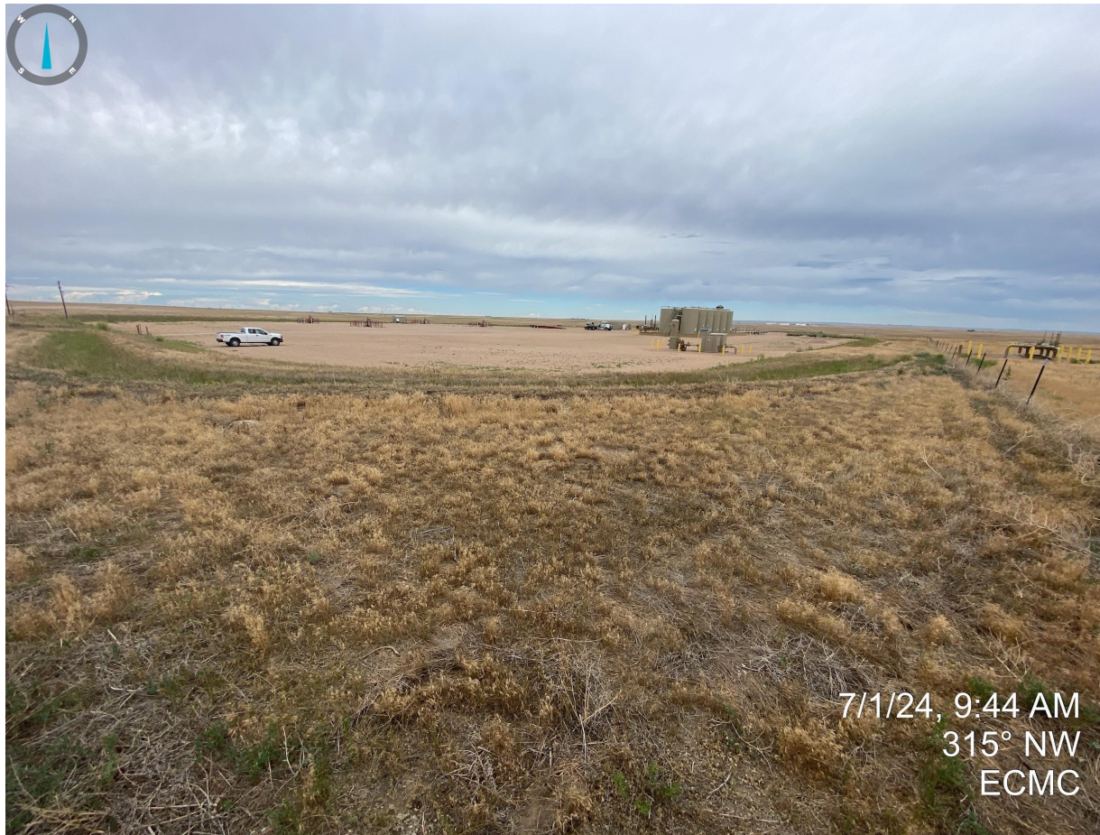
Photo 2. Southeast corner of the location. Interim reclamation activities had not commenced at the time of this inspection. Also pictured in foreground , cheatgrass (CO List C Noxious Weed) observed throughout the location.