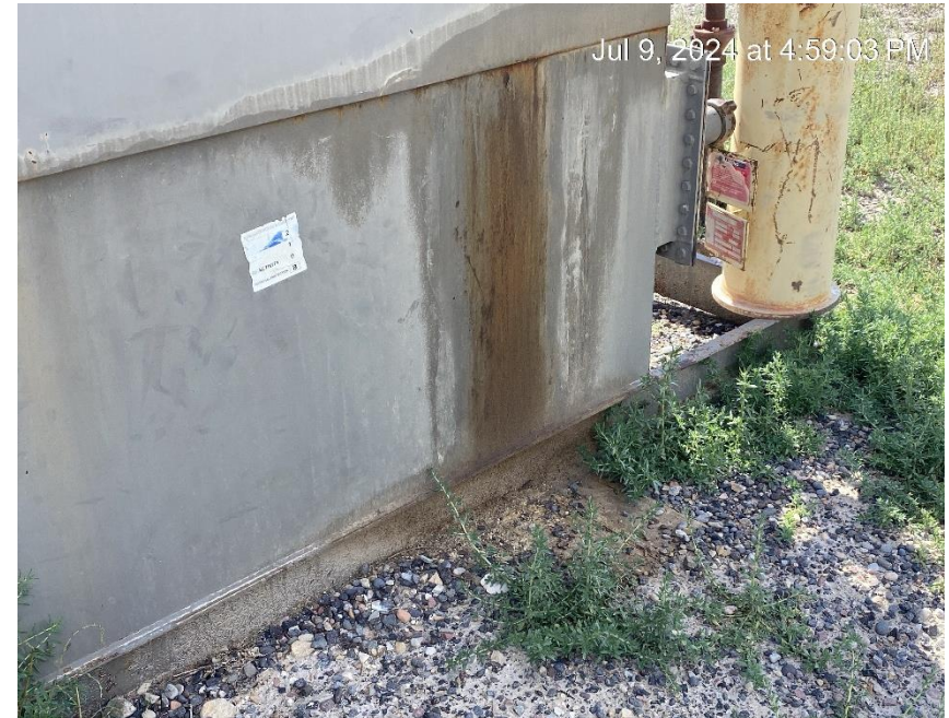
Calibration out of date