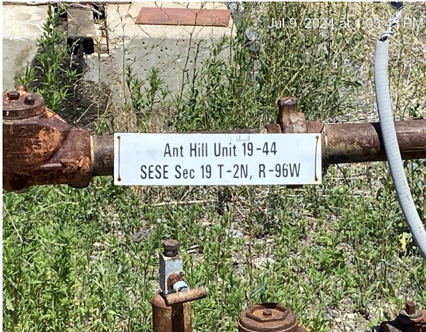
When replaced additional information is required