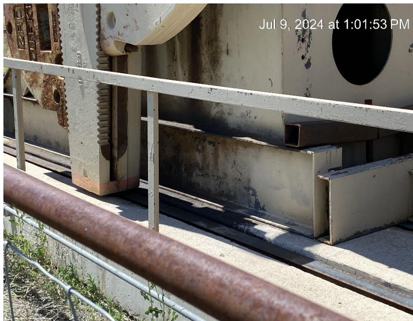
Oily waste from equipment leak