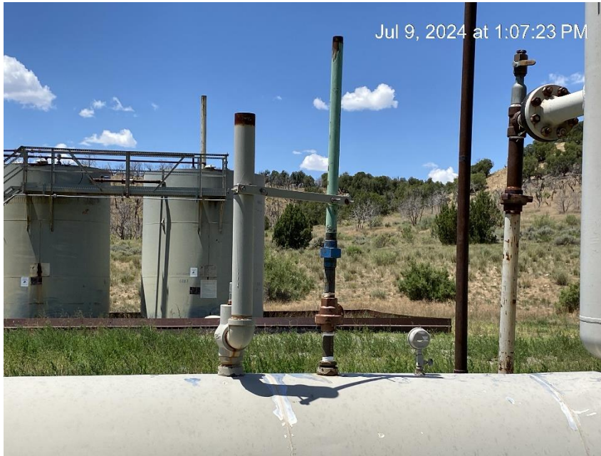
Relief risers missing protective covers