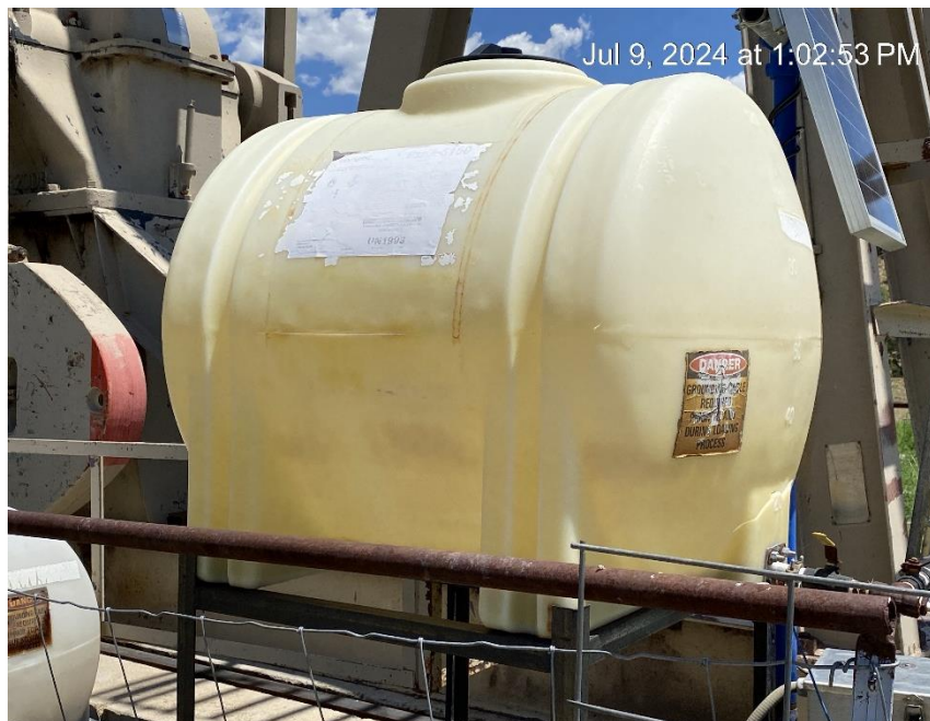
Illegible label. Broken equipment.