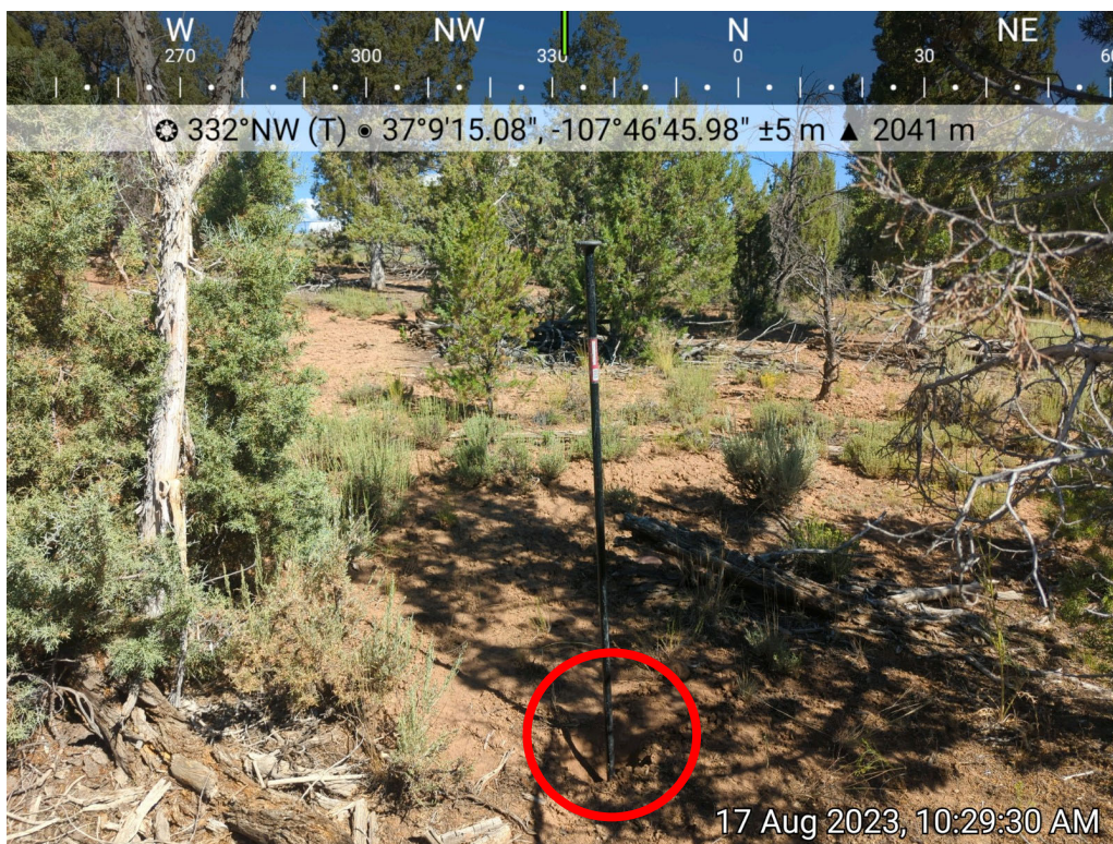
Photo 4: BG01 collected as a background sample south of point of release.