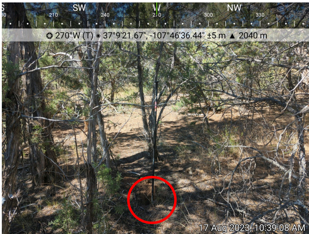
Photo 5: BG02 collected as background sample east of point of release.