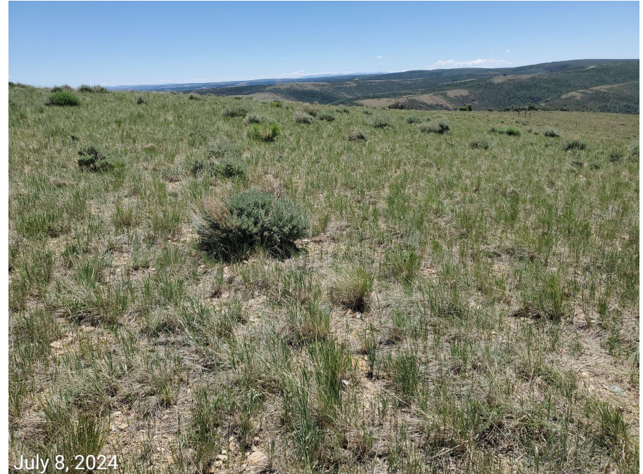
Photo 1: Photos 1-2 taken from central areas of the Location. Photos provide an overview from north, east, south to west. Location has met 1004 revegetation requirements.