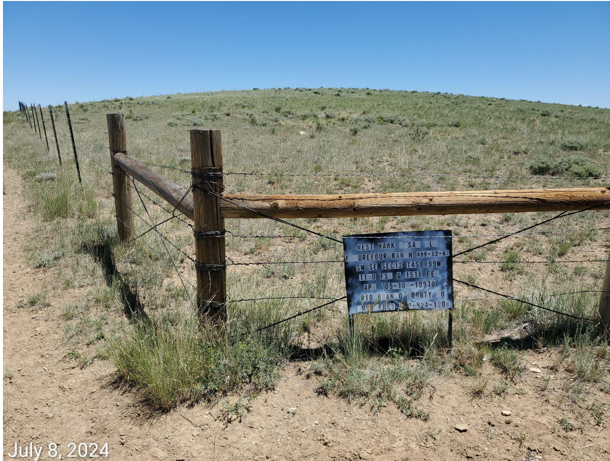
Photo 3: Signage remaining at Locations entrance. Signage requires removal.