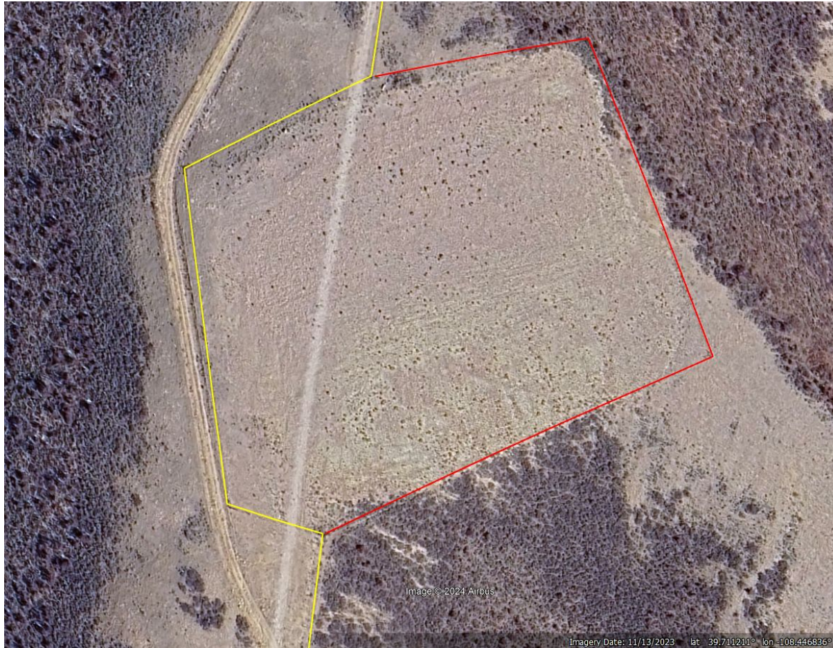
Photo 5: Continued from photo 4. Photo 2023 Google Earth aerial imagery showing the Location's perimeter fence remaining. Fence outlined in red will require removal.