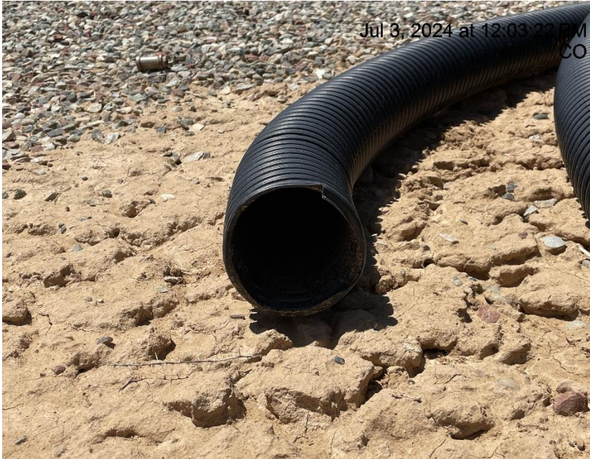
Photo # 2499 Flowline heating insulation open ended /wildlife hazard/available for entry by wildlife