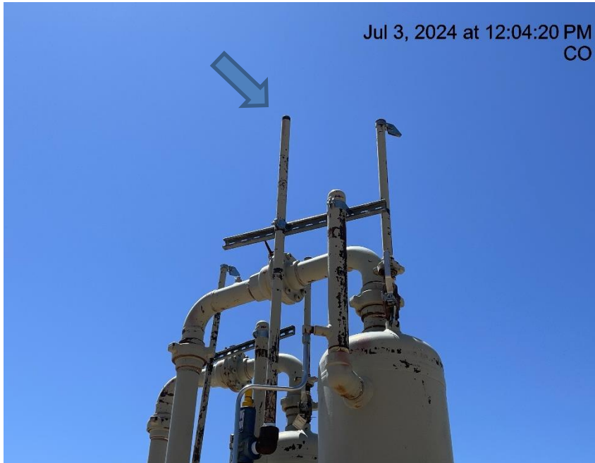
Photo # 2497 PRV vent line does not comply with CECMC pressure safety device rules