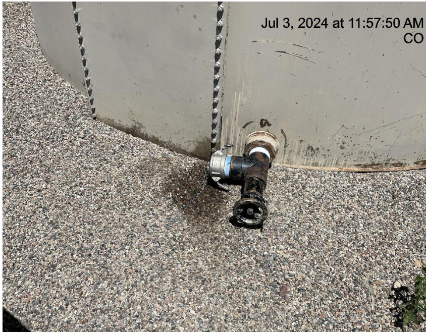
Photo # 2501 Staining in secondary containment near frost free valve