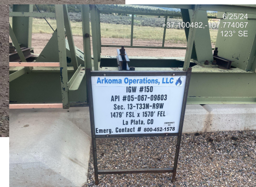
Photo 1. View of the well disturbance taken from the access point facing center.