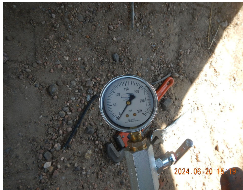
4. Casing pressure (vacuum) at time of inspection.