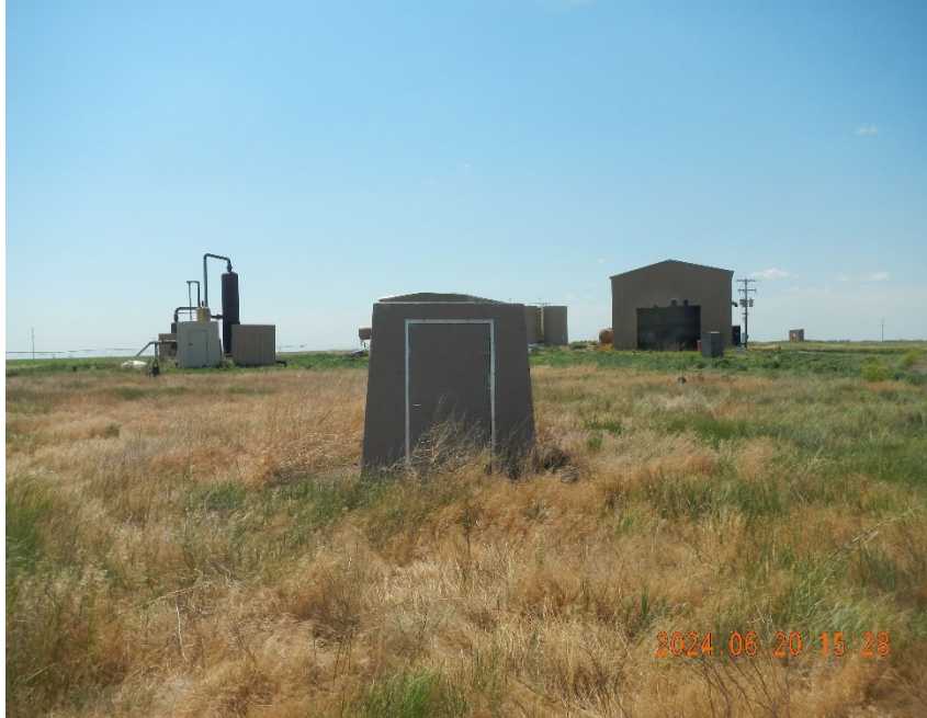
5. Well site overview. Note vegetation across location.