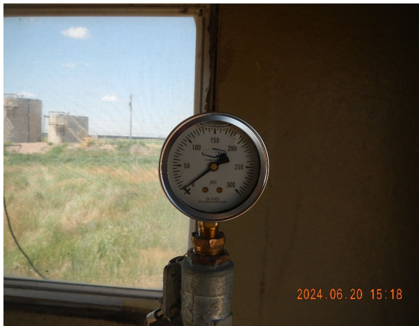
3. Tubing pressure at time of inspection.