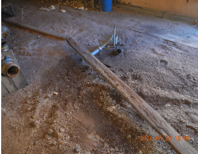
9. Stained soil inside injection pump building.