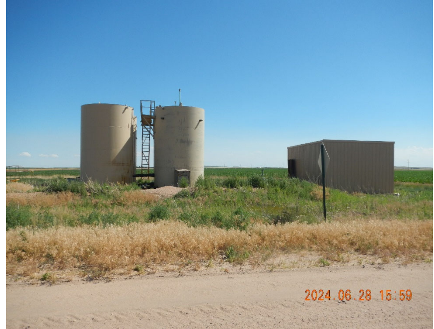
16. Location overview. Note vegetation.