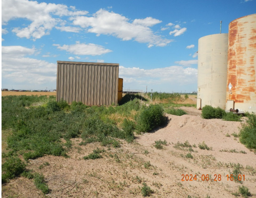
7. Steel injection pump and equipment building at tank battery. Note vegetation.