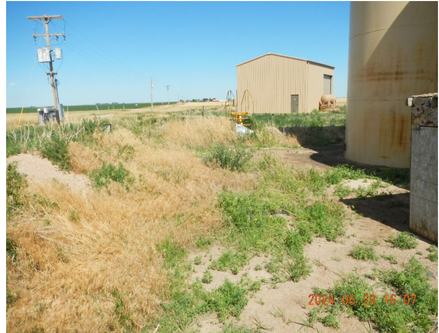
12. View of vegetation growing on and inside tank berms.