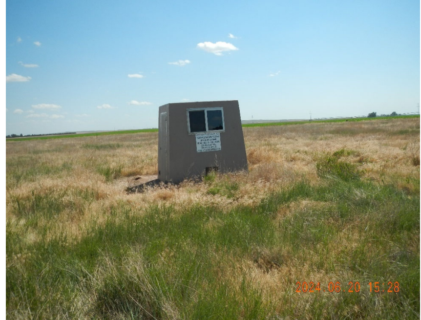
6. Well site overview. Note vegetation.