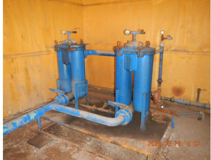
8. Filter pots inside injection building. Injection pump has been removed.