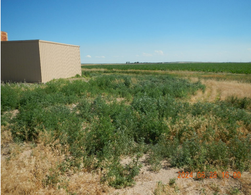
15. Location overview. Note vegetation.