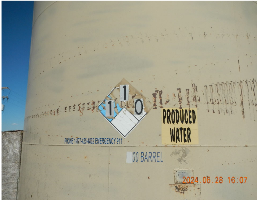
11. View of peeling, fading, and unreadable labels on tank.