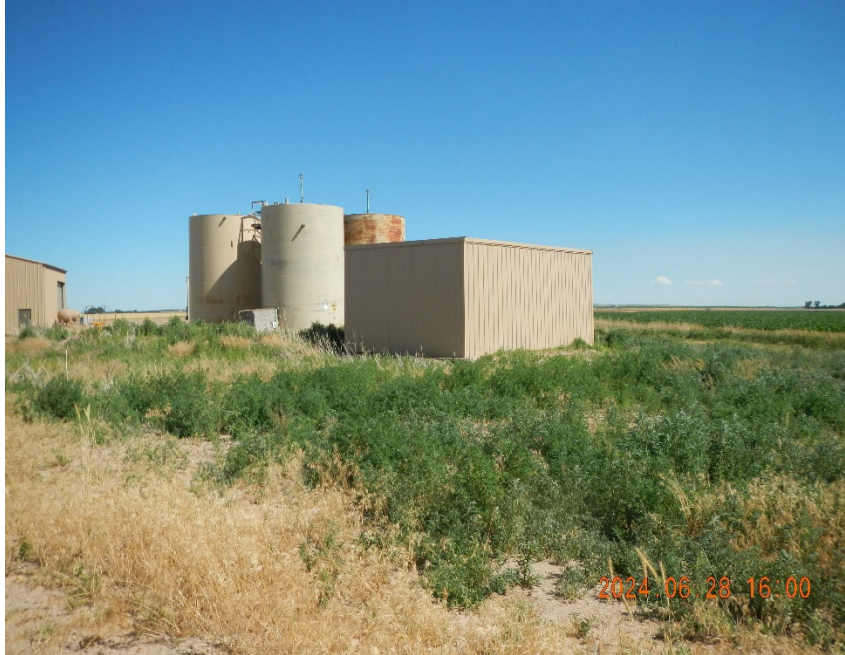
13. Location overview. Note vegetation.