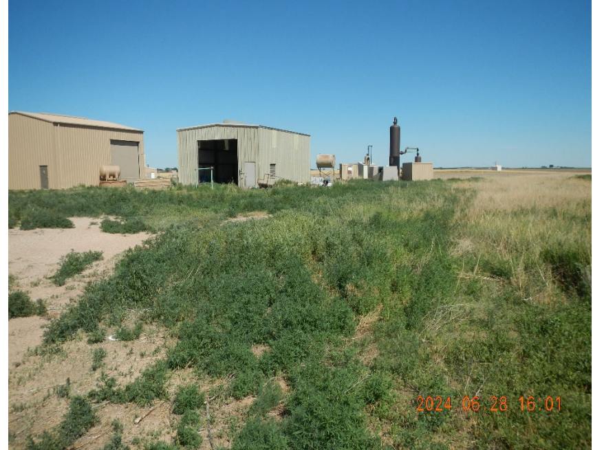
14. Location overview. Note vegetation.