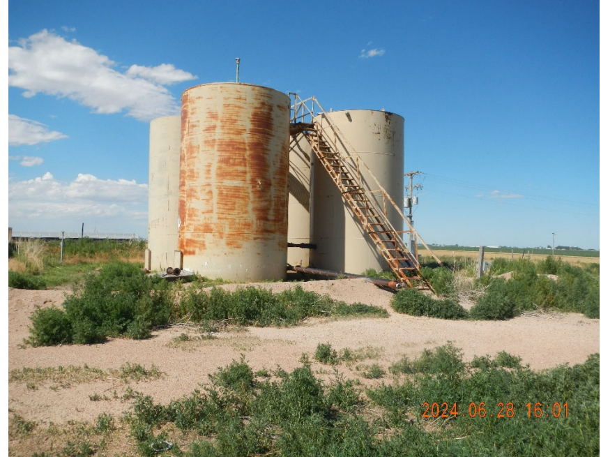
10 View of Tank Battery. Note vegetation and rusting tank.