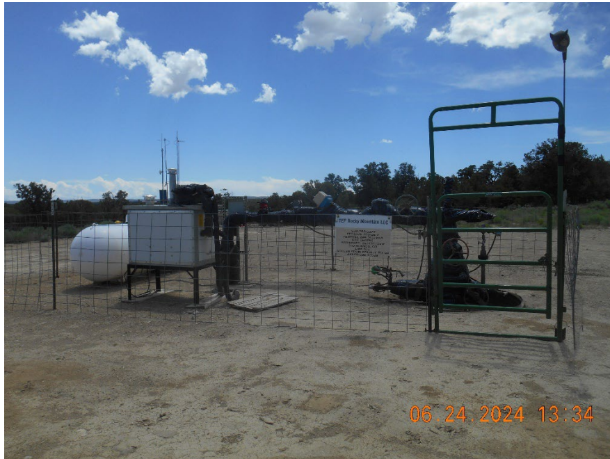
Injection wellhead and line heater

Inspection Date: 6/24/2024 Inspection Doc#: 693807444