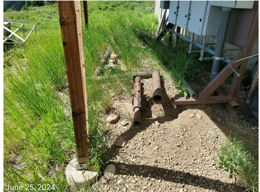
Photo 19: See comments under photo 17. Photos taken from behind the housing unit on the northwest end of the Location.