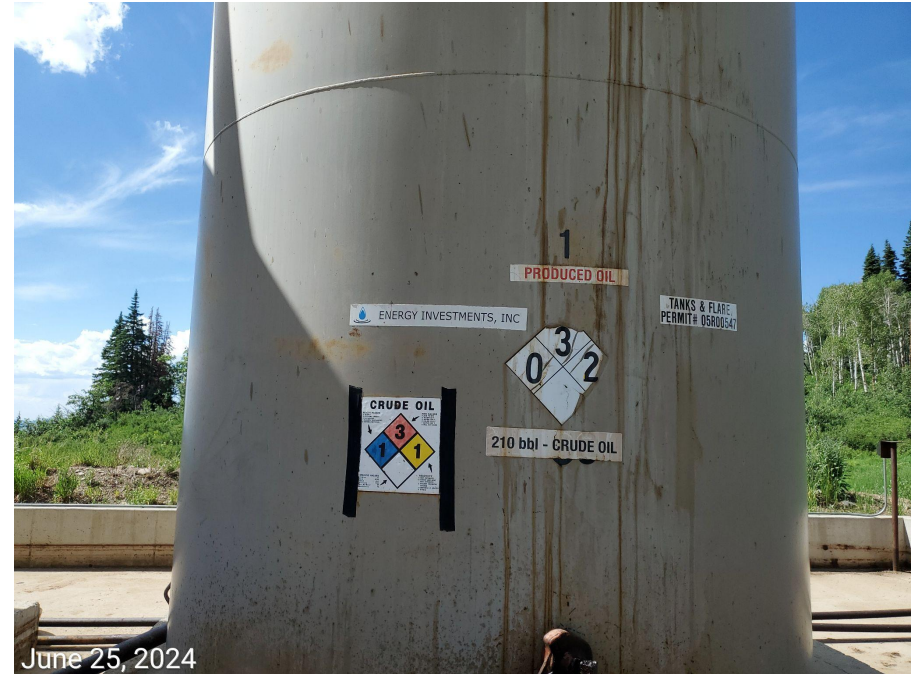
Photo 10: Tanks at battery facility missing Operator emergency contact number.