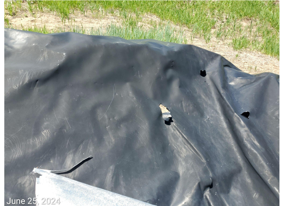
Photo 25: Photos shows that secondary containment measure remains in disrepair- containment is not impervious to contain a spill or release.