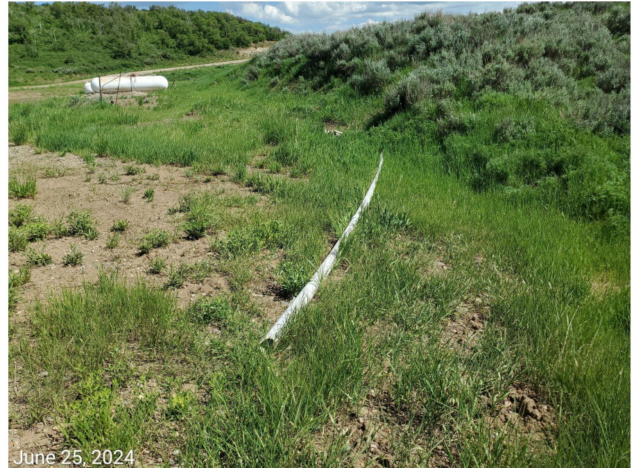
Photo 17: Photos 17-20 provide examples showing various trash, debris and/or unused equipment improperly stored on the Location. Photo left taken from the propane tank next to the wellhead. Photo right taken from the northwest end of the Location, facing southeast.