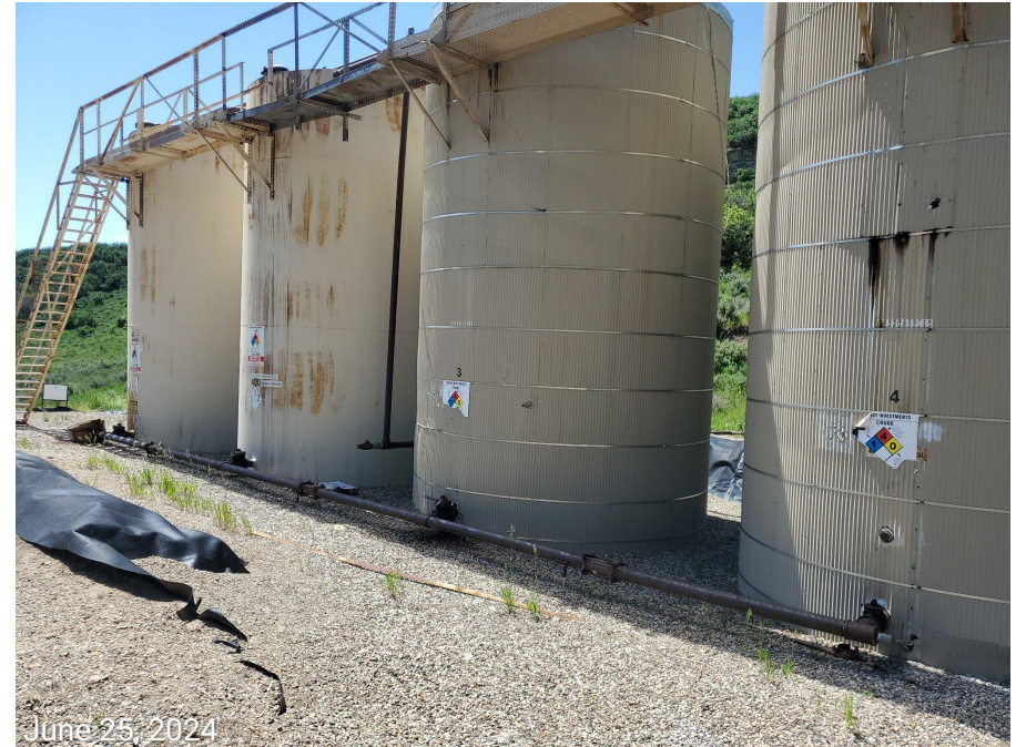
Photo 24: Photos 24-29 taken from the “Wolf Mountain Tank Battery Facility (#449642)”, Located on the north end of Beeman O&G’s Routt Bonanza-67N87W/22SENE Location (#316756). Photo left shows API information remains missing at the battery signage. Photo right shows tanks at the facility.