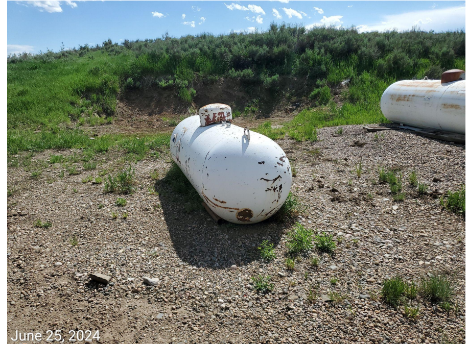
Photo 20: See comments under photo 17. Photo left taken from next to wellhead. Photo right shows unused propane tank stored on the southwest end of the Location.