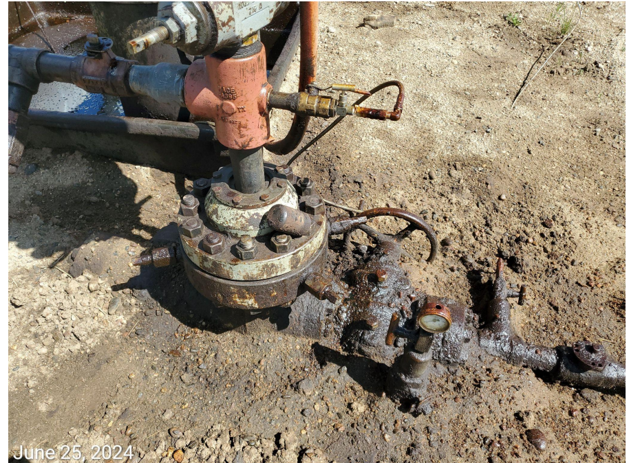
Photo 5 See comments under photo 3. Fluids appear to be actively leaking from well and stuffing box.