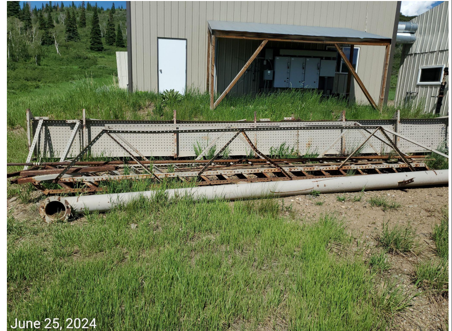
Photo 18: See comments under photo 17. Photos taken from the northwest end of the Location.