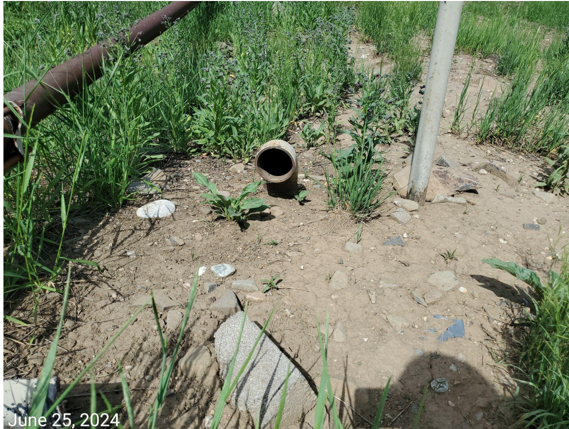
Photo 23: Photos taken from the north and of the Location, east of the battery. Photo shows open pipe. BMPs to prevent wildlife access missing.