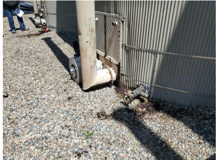
Photo 30: Photos examples show additional spills/stained soils that have not been cleaned/removed at the battery facility.