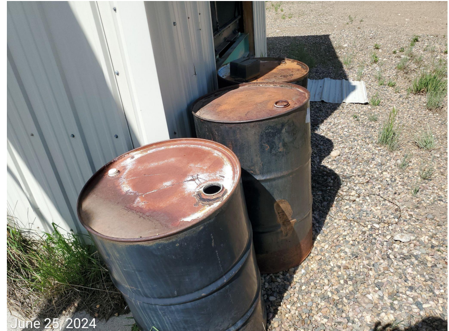
Photo 21: Photos show unlabeled barrels improperly stored on the Location. BMPs to prevent and/or to contain a spill or release are missing or insufficient.