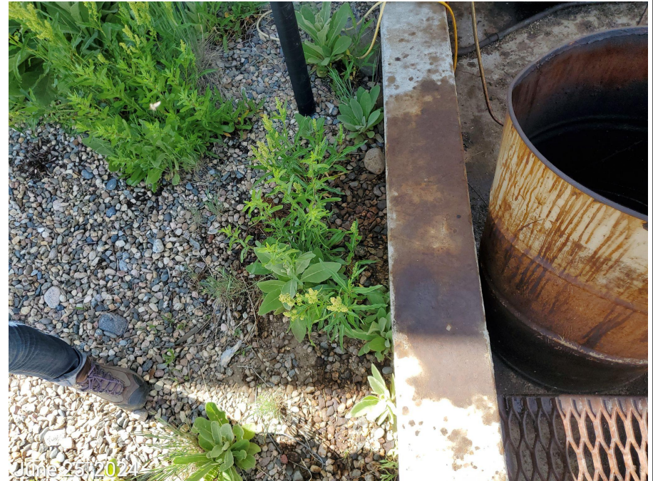
Photo 12: See comments under photo 11. Photo right also shows stained soils next to battery facility.