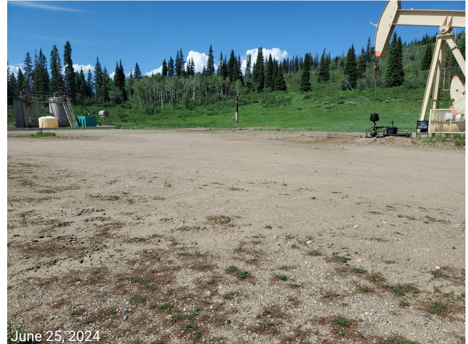
Photo 1: Photos 1-2 taken from the west end of the Location. Photos provide an overview of the Location from northwest, north, east, to southeast.