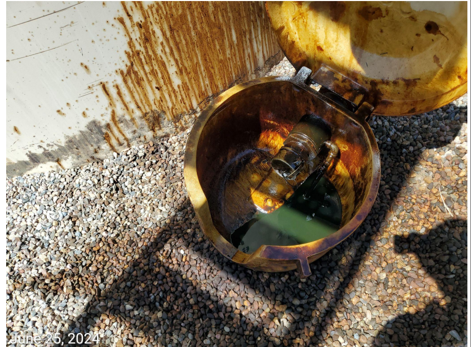
Photo 26: Photos show fluids remain in the honeypot. Photo also shows spills remaining around the loadline.