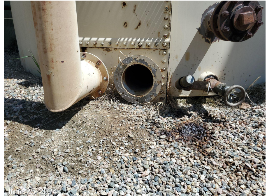
Photo 28: Photos examples showing covers at 3 of the 4 tanks on the Location have not been replaced. Photos also show stained soils due to spills at the battery facility have not been cleaned.