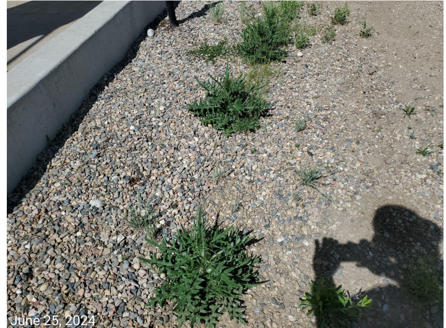
Photo 22: Photos examples of Noxious Weeds (Bull thistle, Houndstongue) observed on the production and interim areas of the Location.