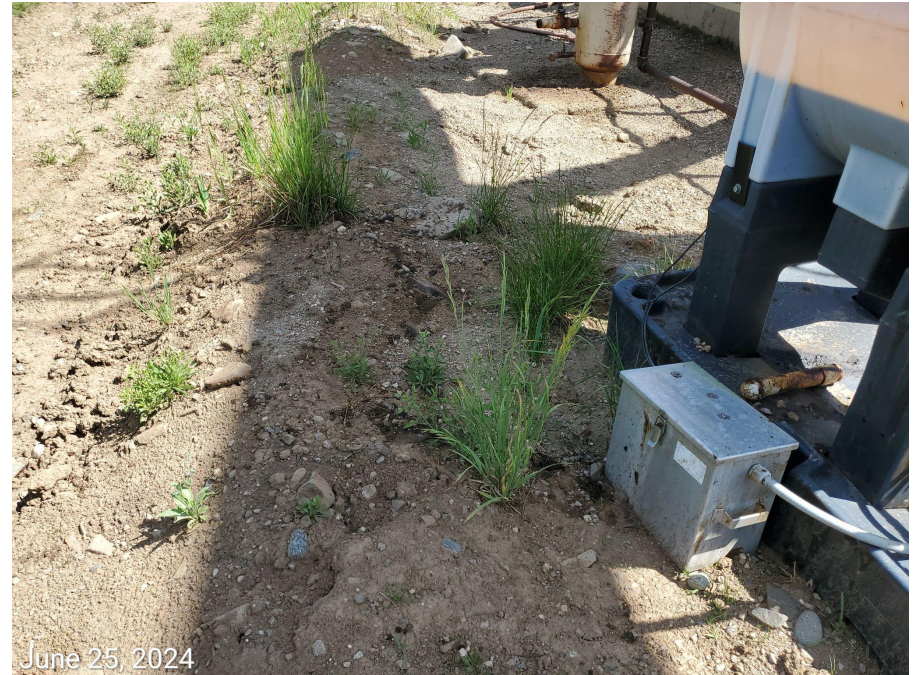
Photo 6: Photos taken from the well. Photo left shows fluids within the secondary containment measure. Photo also shows wildlife protection measures are missing from the containment BMP. Photo right shows additional soil staining around the well.