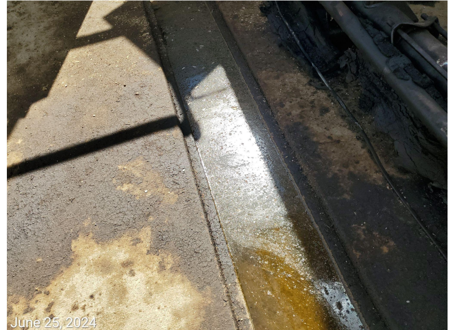
Photo 11: Photos 11-13 taken from the tank battery facility on the north end of the Location. Photos shows fluids/spills within containment.