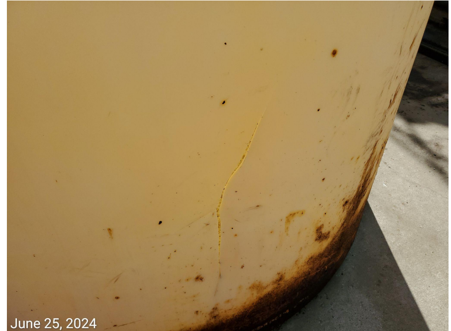
Photo 15: Unused tank with crack observed stored at the battery facility. Tank requires removal.