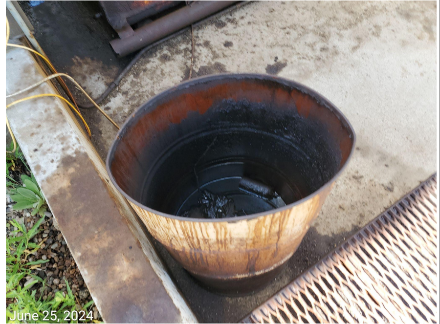
Photo 14: Photos right shows wildlife mortality within the tank battery facility containment. Photo right shows an open barrel containing unknown fluids. Wildlife protection measures missing or insufficient.