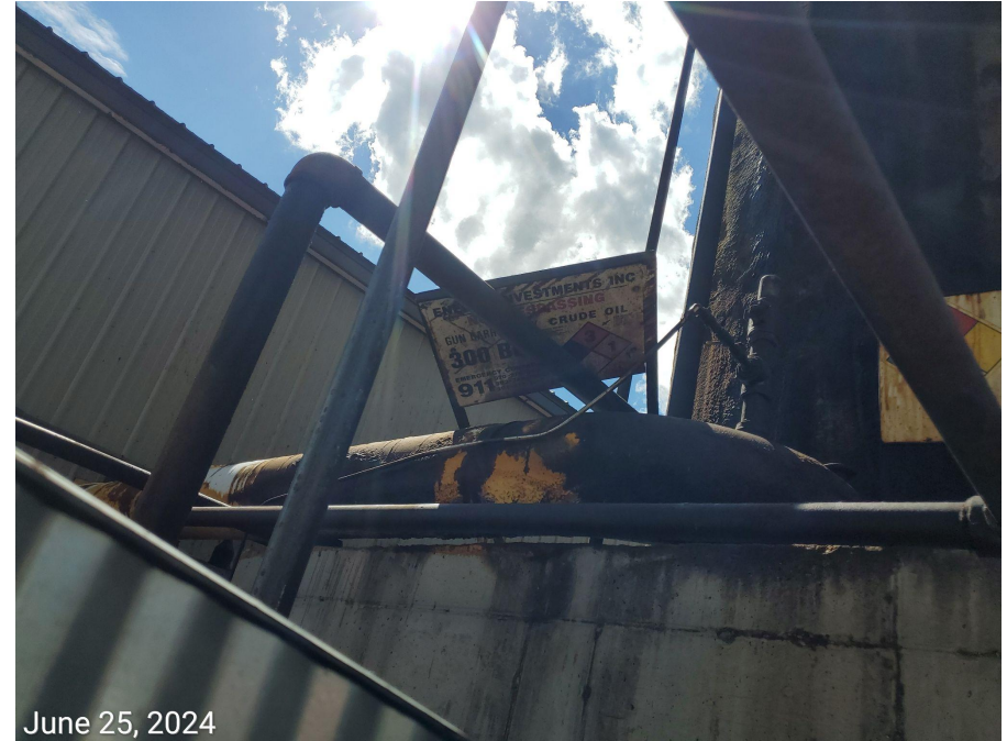
Photo 9: Photos taken from the tank battery facility on the north end of the Location. Photo left shows signage has not been posted at the battery facility. Photo right shows signage at the crude oil tank has not been maintained.