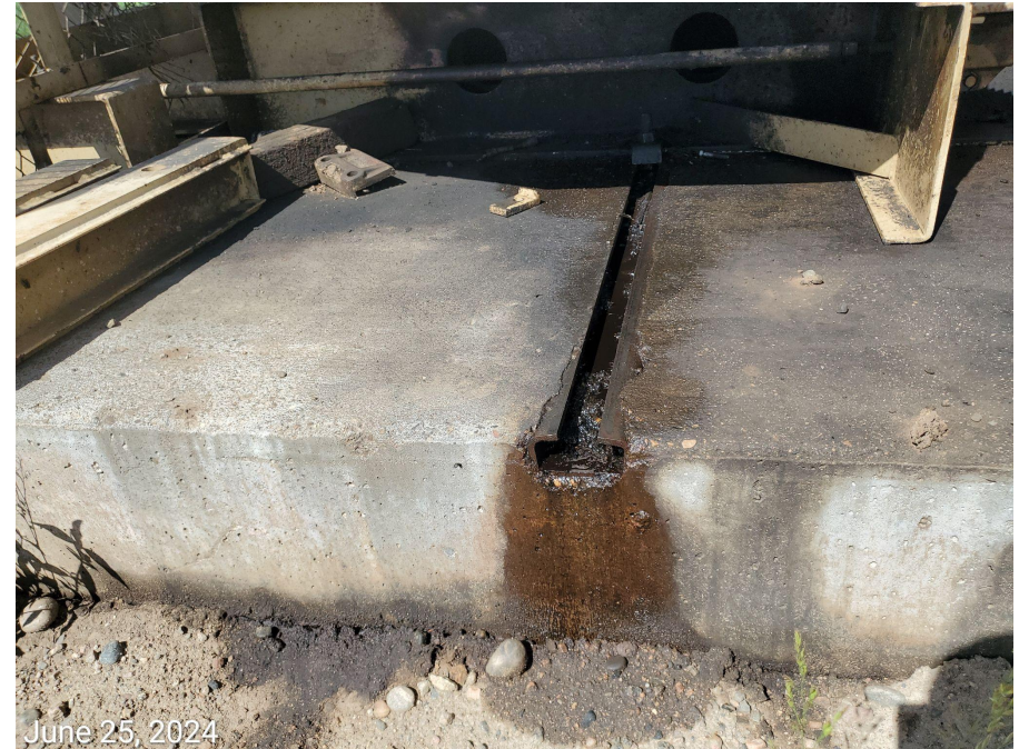
Photo 7: Fluids leaking from motor of the pump jack, resulting in stained soils.