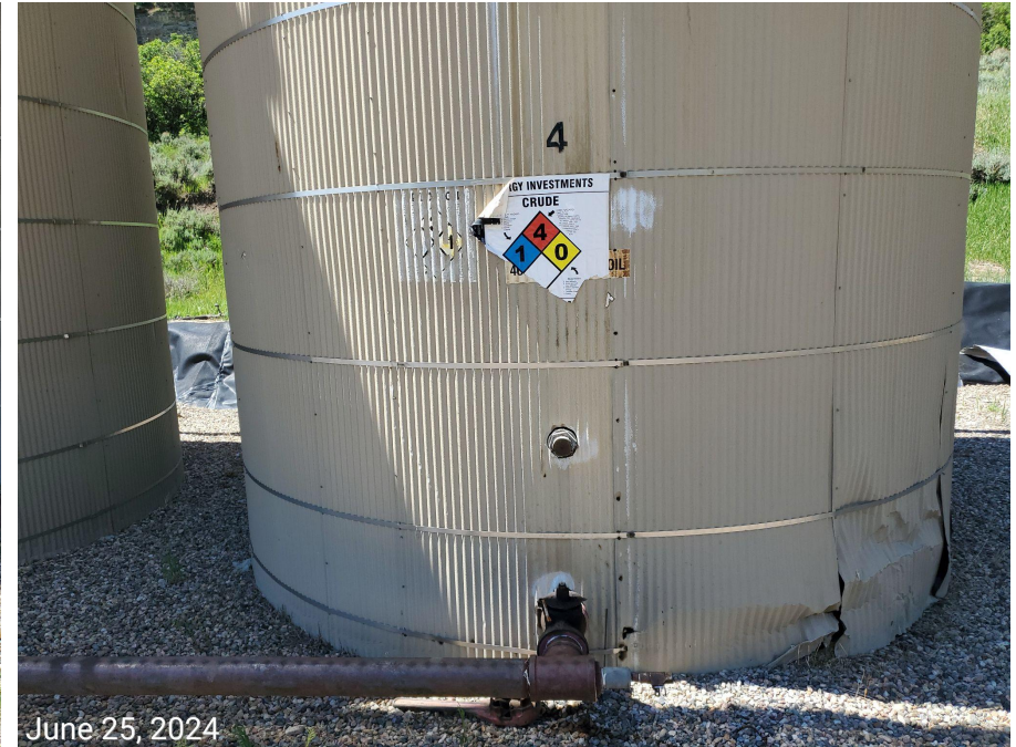
Photo 27: Photos show signage at the tank do not comport with 605 requirements.