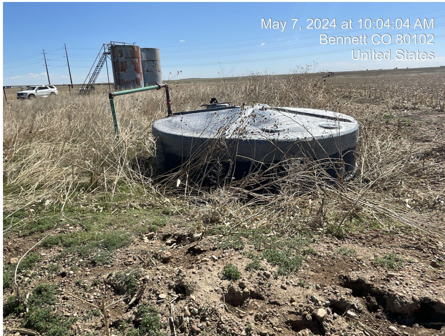
Photo 9. Photo taken of buried water tank on site.