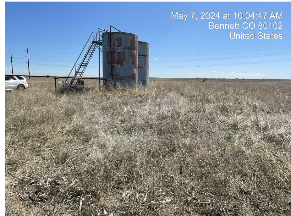
Photo 10. Photo taken facing east of tank battery and vegetation.