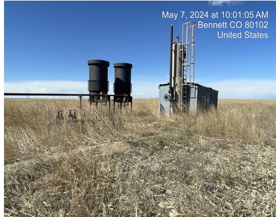
Photo 4. Photo taken facing southwest of burners and separator.