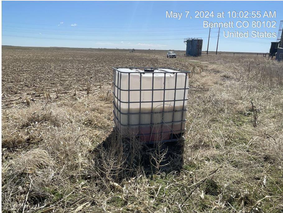
Photo 7. Photo taken of chemical tote on site.