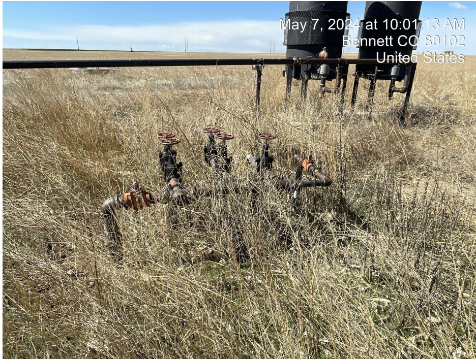
Photo 3. Photo taken facing southwest of pipe risers and burners.