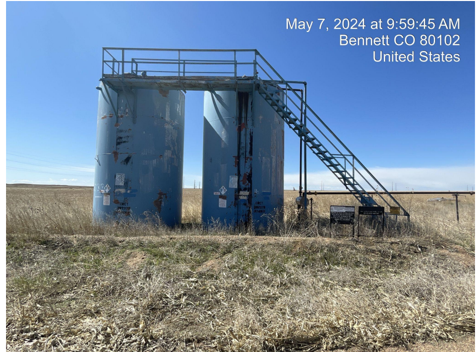
Photo 2. Photo taken facing south of tank battery.