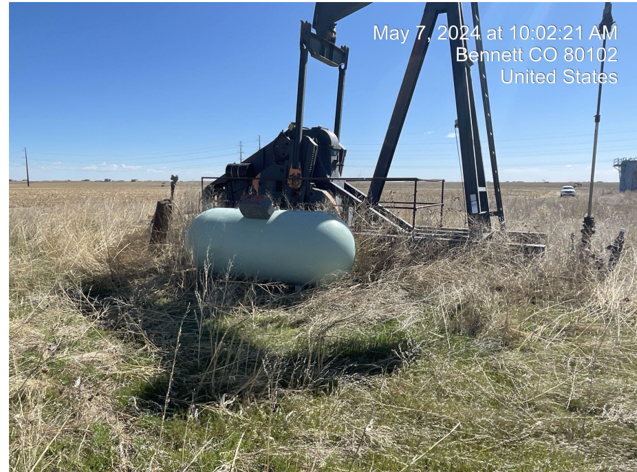
Photo 5. Photo taken facing northeast of pump jack and vegetation.

May 7, 2024 at 10:02:21 AM Bennett CO 80102 United States