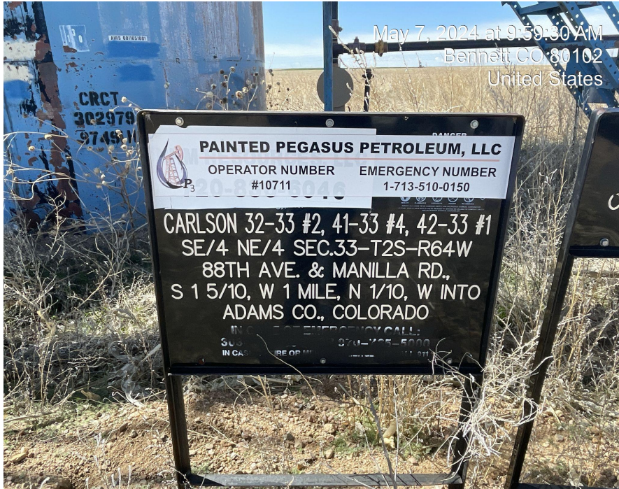
Photo 1. Photo of location sign on tank battery.