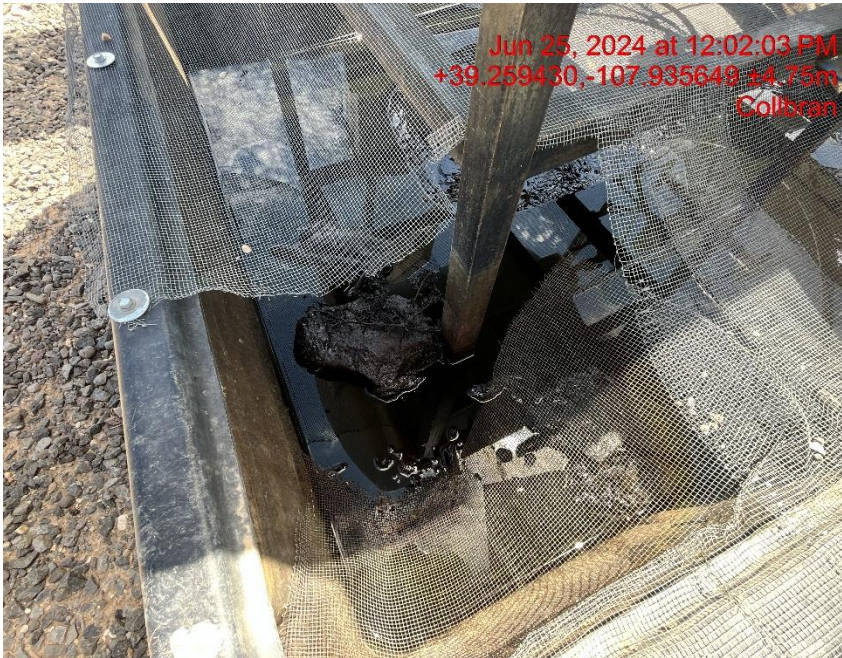
Chemical containment open to wildlife - Photo #02917