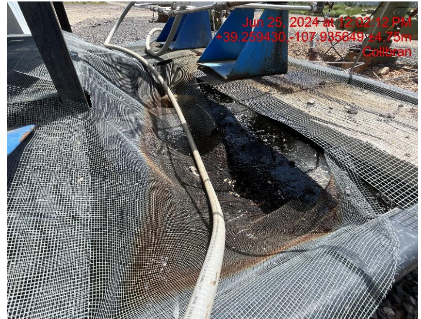
Chemical containment open to wildlife - Photo #02919