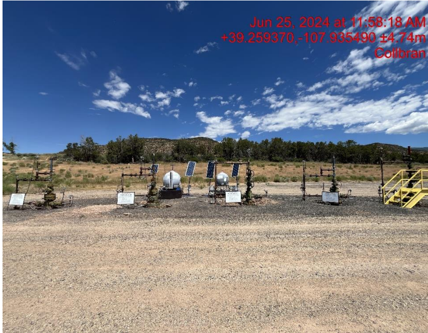
Well heads - Photo #02910