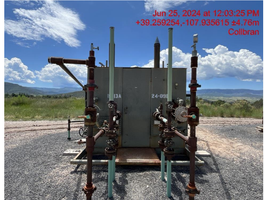
Separators - Photo #02920