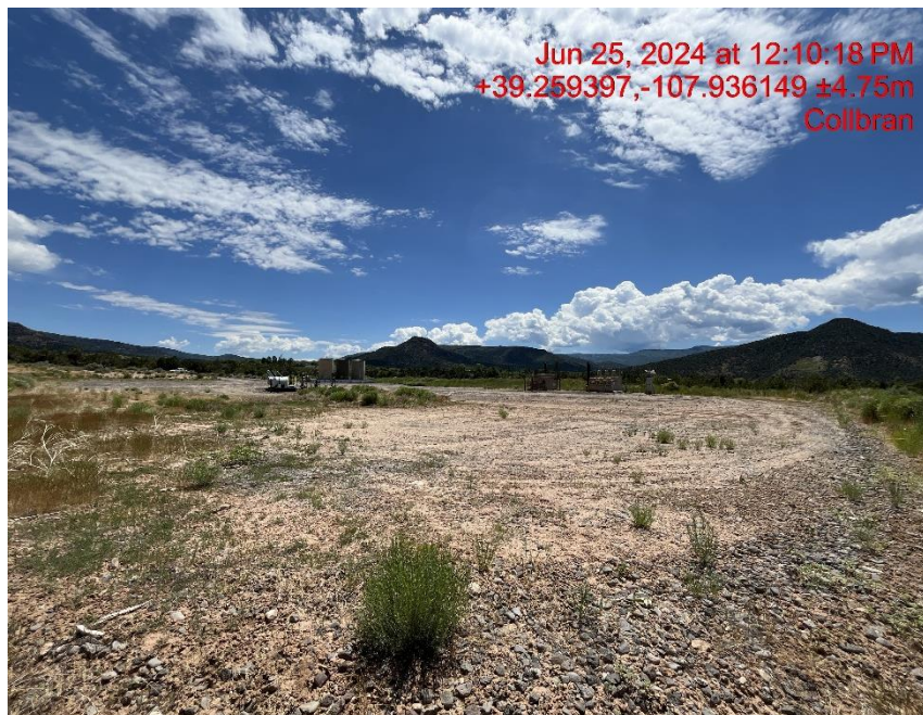
Northwest corner of location - Photo #02930