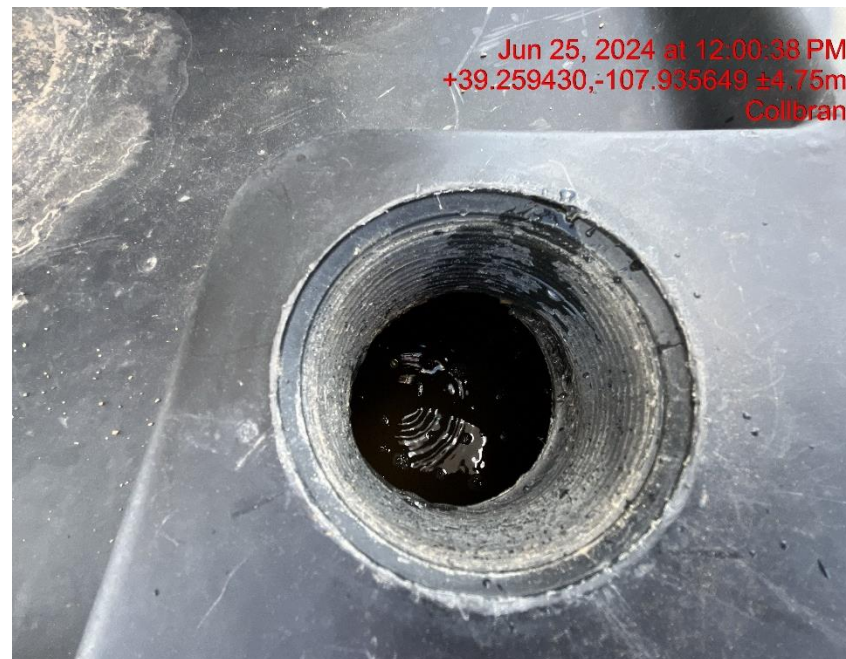
Failure to maintain chemical BMP/chemical containment approximately 3/4 full of fluid/not sufficient to contain possible spill - Photo #02914