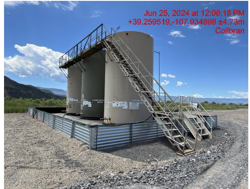
Separators - Photo #02921

Jun 25, 2024 at 12:06:18 PM +39.259519,-107.934898 ±4.73m Collbran