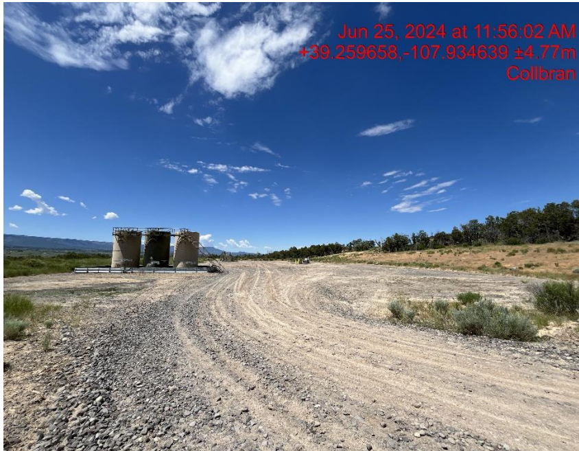
Entrance to location - Photo #02908