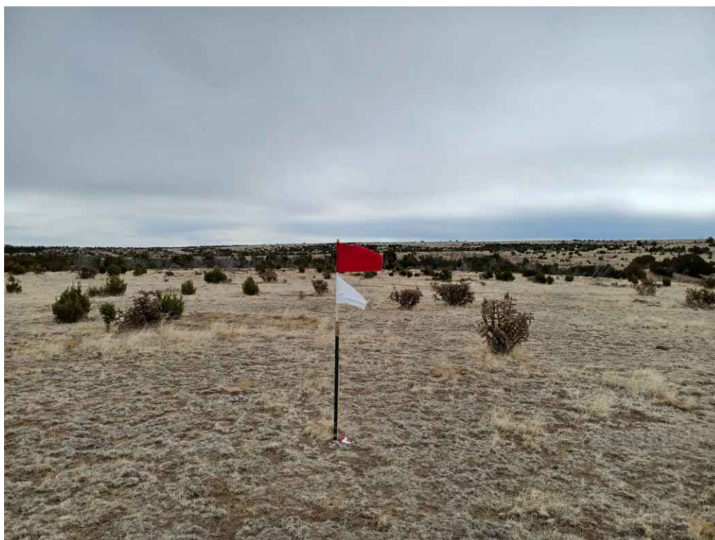
WELL LOCATION LOOKING EAST 4/1/22