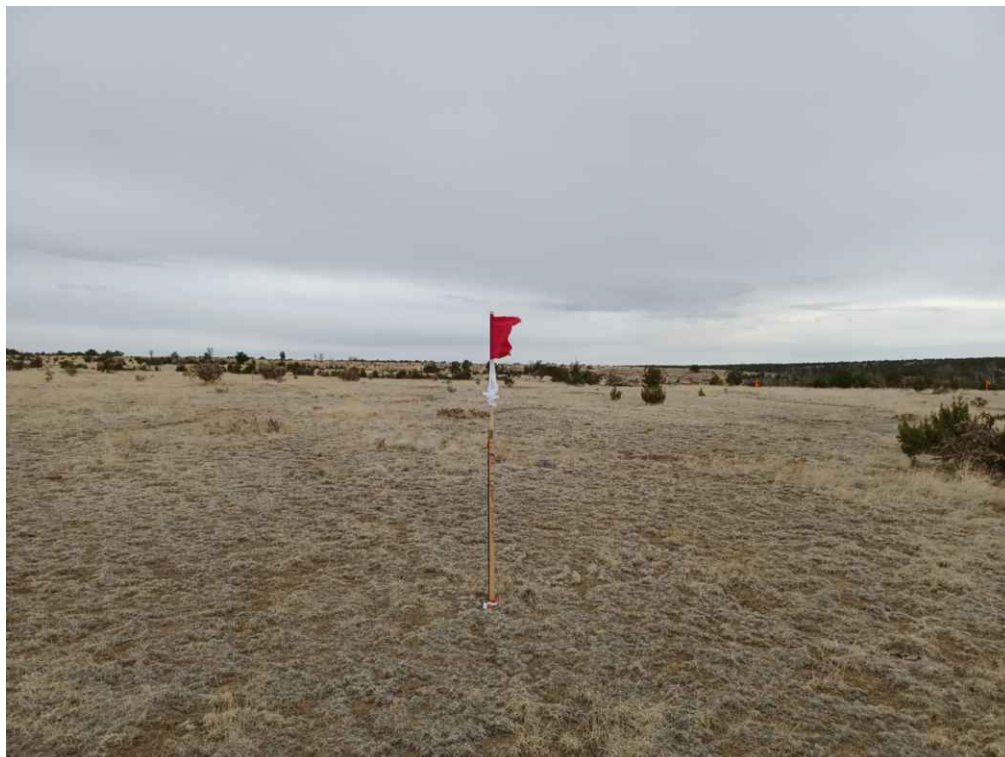
WELL LOCATION LOOKING NORTH 4/1/22