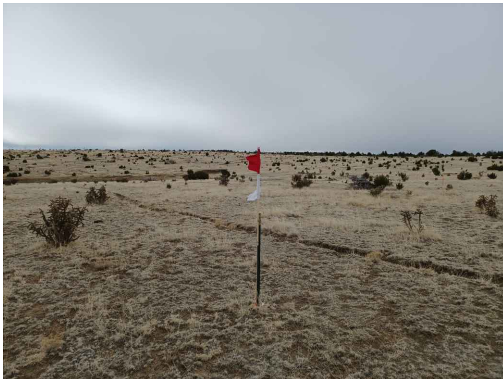
WELL LOCATION LOOKING SOUTH 4/1/22