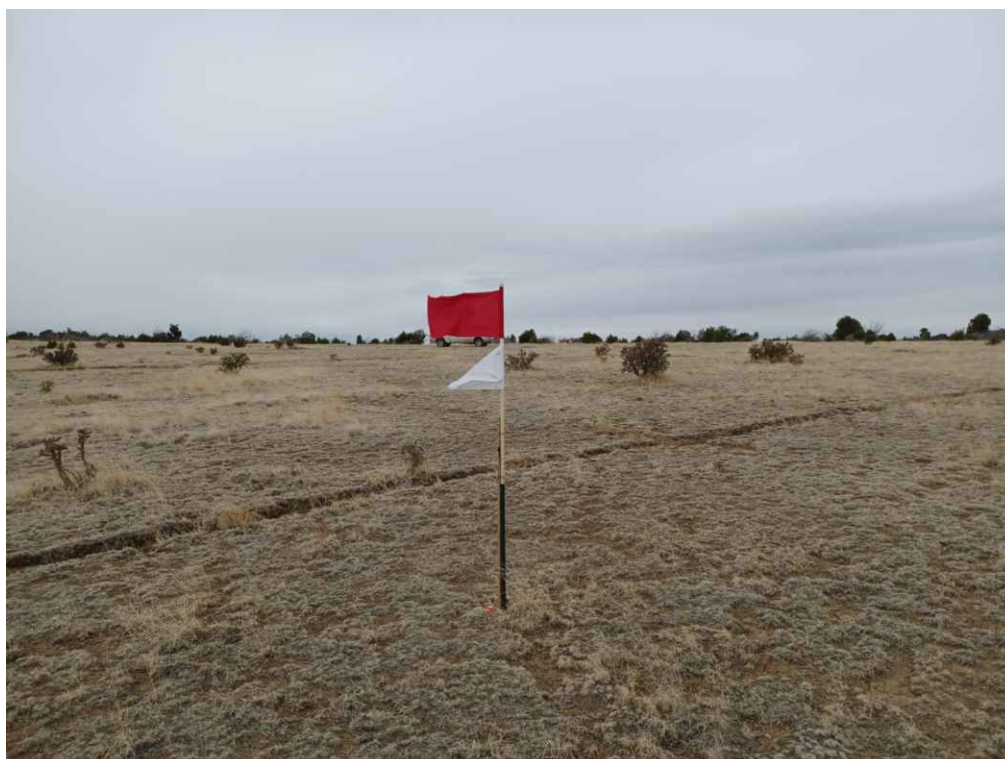
WELL LOCATION LOOKING WEST 4/1/22