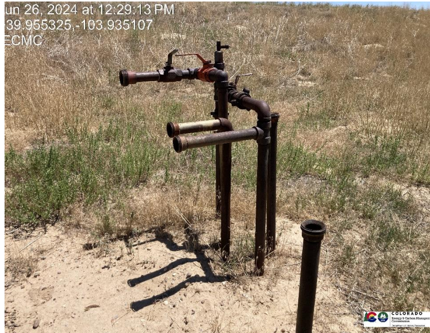
Pic 5 Risers are not LOTO