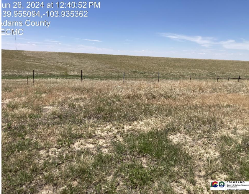
Pic 11 Pit has been filled, no form 27 on file

Jun 26, 2024 at 12:40:52 PM 39.955094,-103.935362 Adams County ECMC