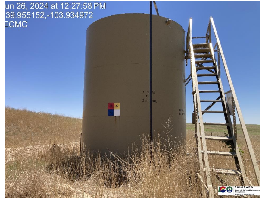
Pic 2 tank placard is inadequate/ weeds unmanaged

Jun 26, 2024 at 12:27:58 PM 39.955152,-103.934972 ECMC