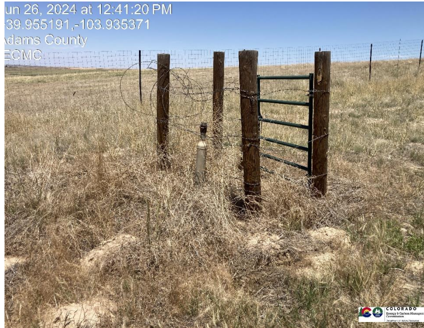
Pic 13 riser is lot LOTO