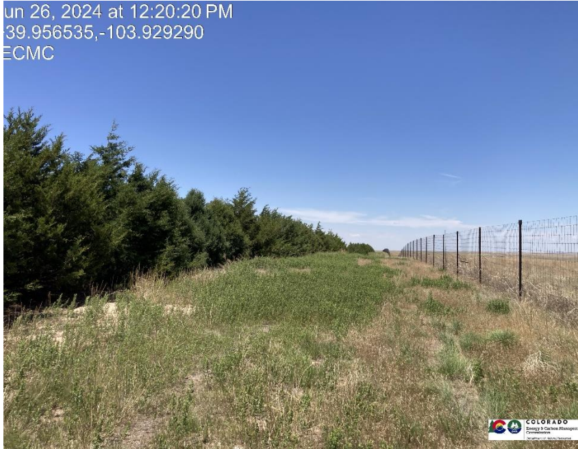
Pic 1 weeds unmanaged on lease road

Jun 26, 2024 at 12:20:20 PM 39.956535,-103.929290 ECMC