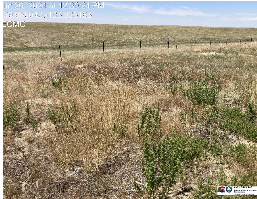
Pic 7 stormwater damage on south end of location