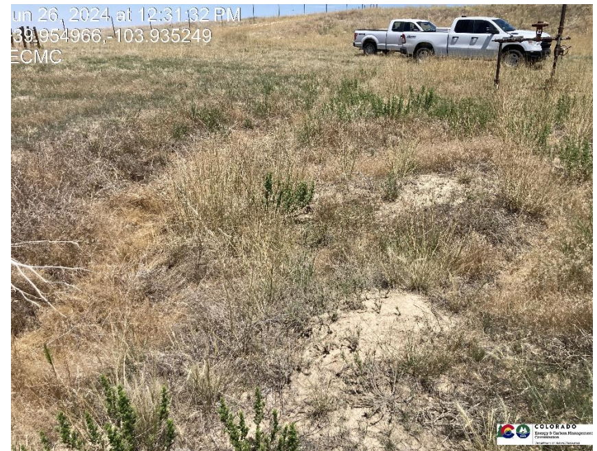
Pic 10 stormwater damage on south end of location