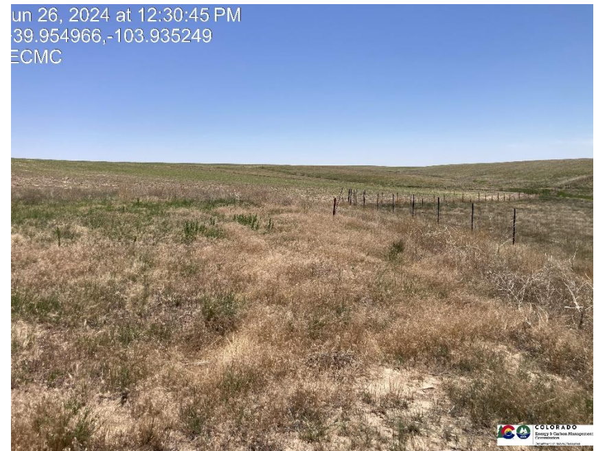
Pic 8 Anchors are not marked correctly, needs to be highly visible.