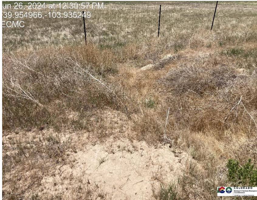
Pic 9 stormwater damage on south end of location