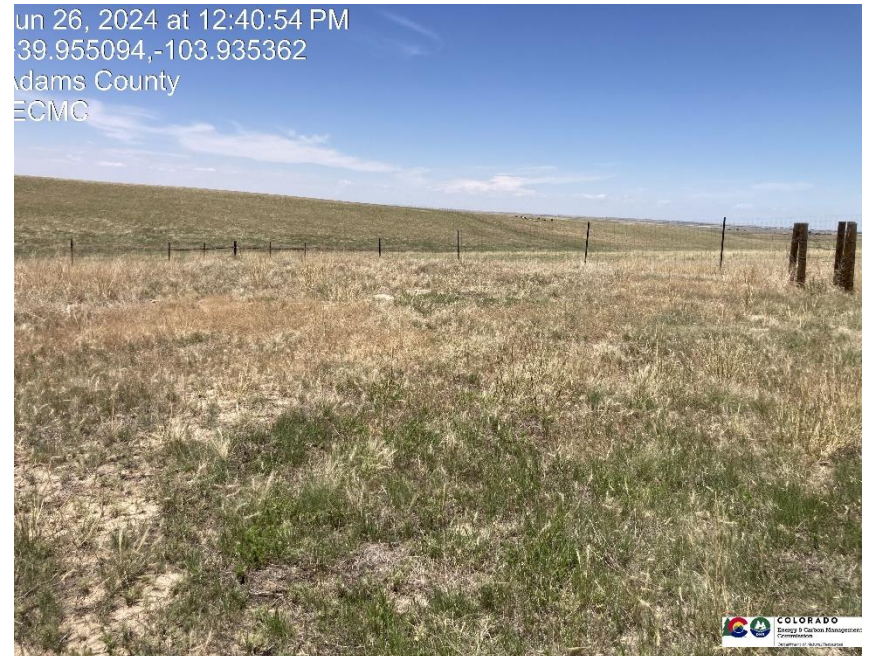
Pic 12 Pit has been filled no form 27 on file

Jun 26, 2024 at 12:40:54 PM 39.955094,-103.935362 Adams County ECMC