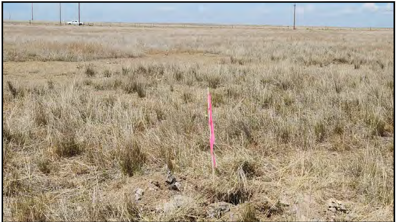
PHOTO: VIEW OF AS-DRILLED LOCATION