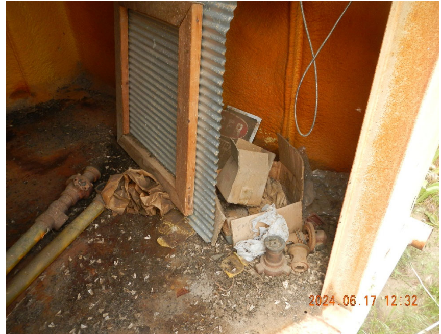
12. Trash inside Meter Shed.