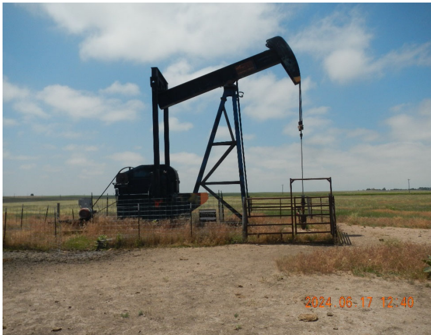
5. View of Pump Jack.