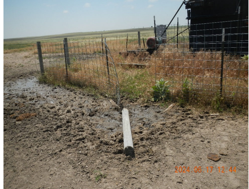
4. Broken post allowing fencing to separate and give cattle access into well fencing.