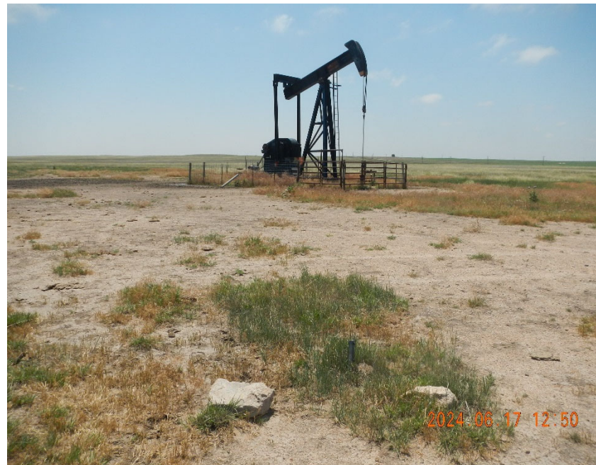
6. Well location overview.