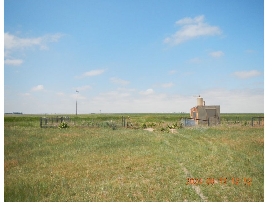
14. Remote metering location overview.