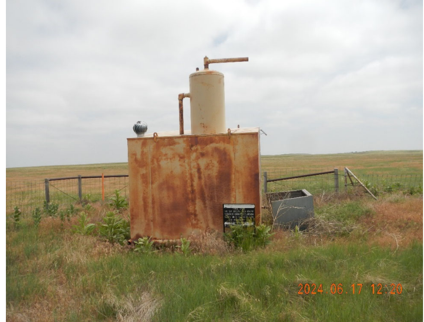
8. View of Separator/Meter Shed. Note vegetation.