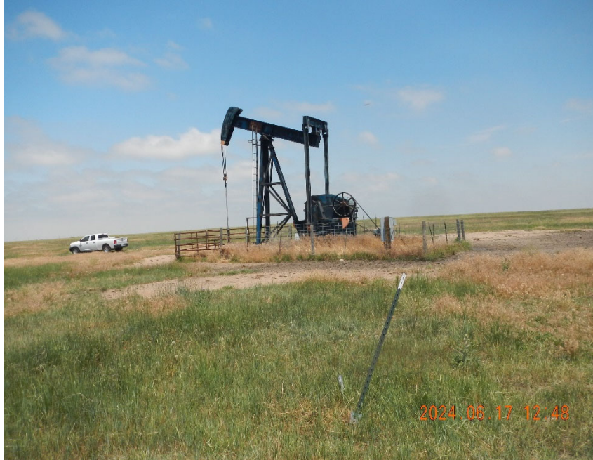
13. Additional well location overview.