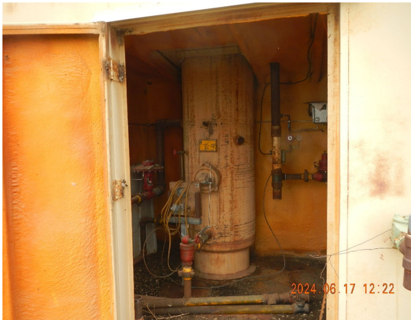
9. View of Vertical Separator inside shed.