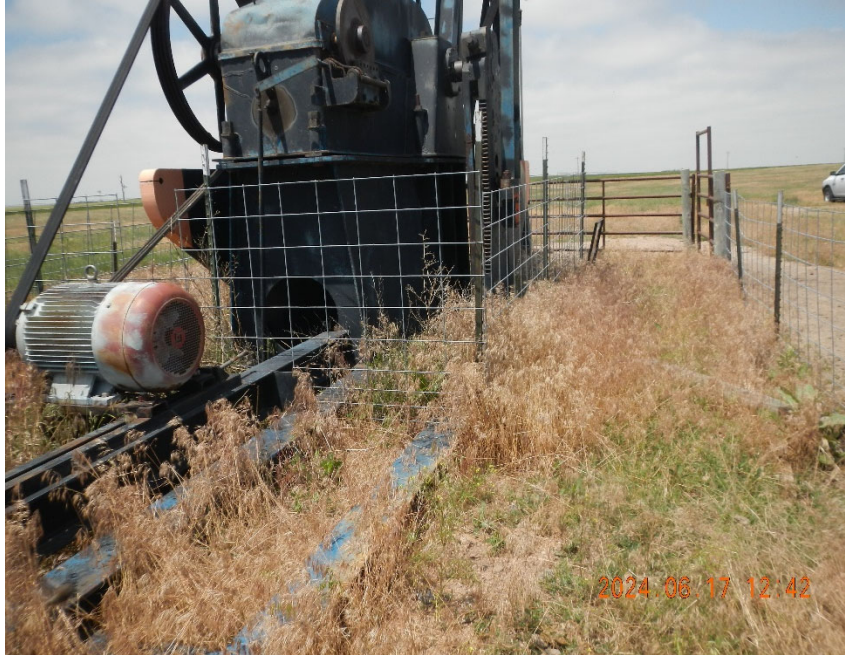
3. View of vegetation growing inside well fencing.