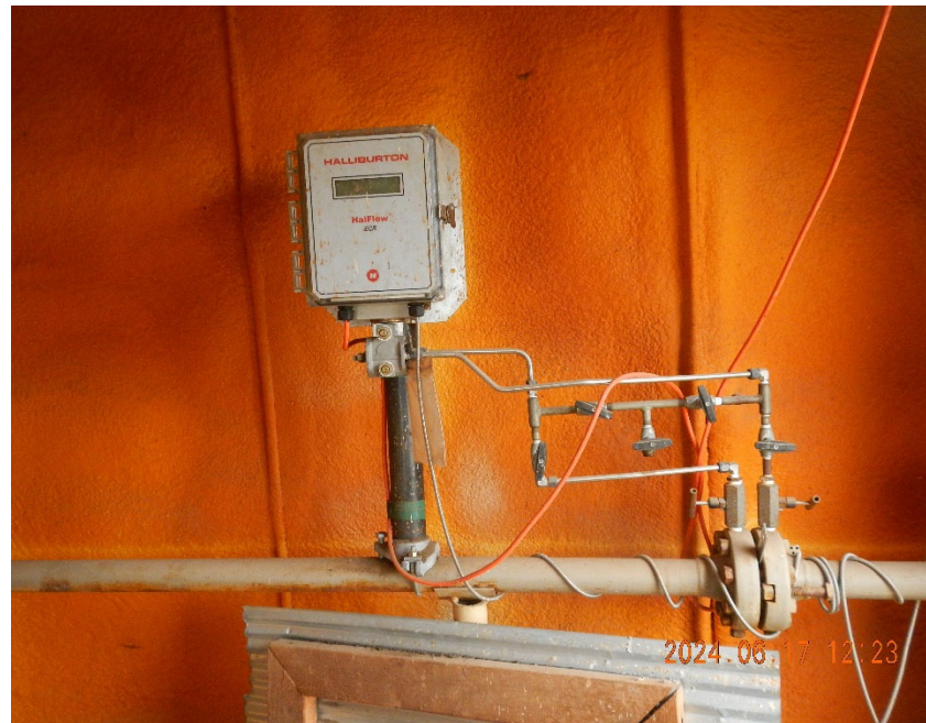
10. Digital gas meter inside shed.