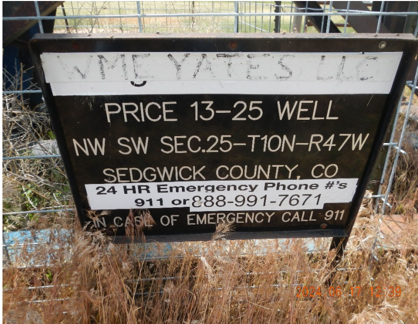
1. Lease sign at well location at time of inspection.