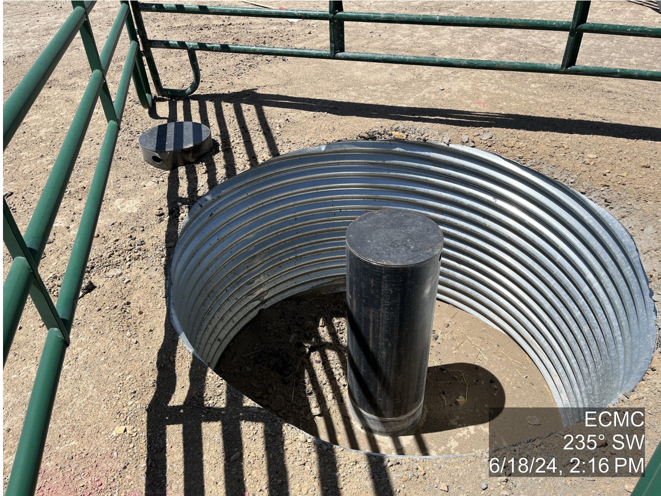
Photo 7. The photo was taken at the well location facing Southwest. The photo illustrates no wildlife protection on surface casings.