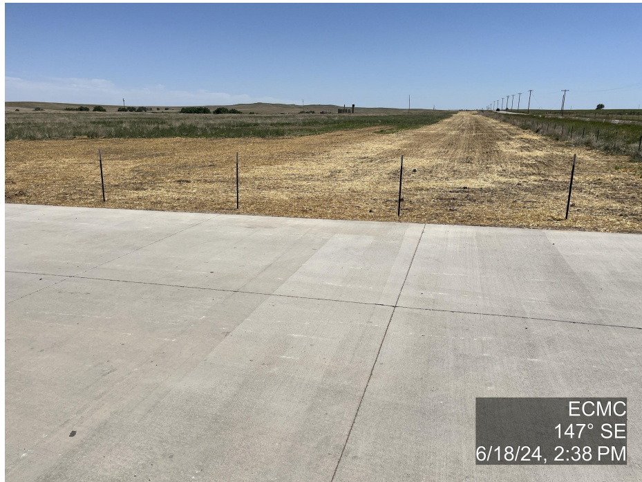
Photo 3. The photo was taken at the entrance to the well location facing Southeast. The photo illustrates the temporary access has been reclaimed.