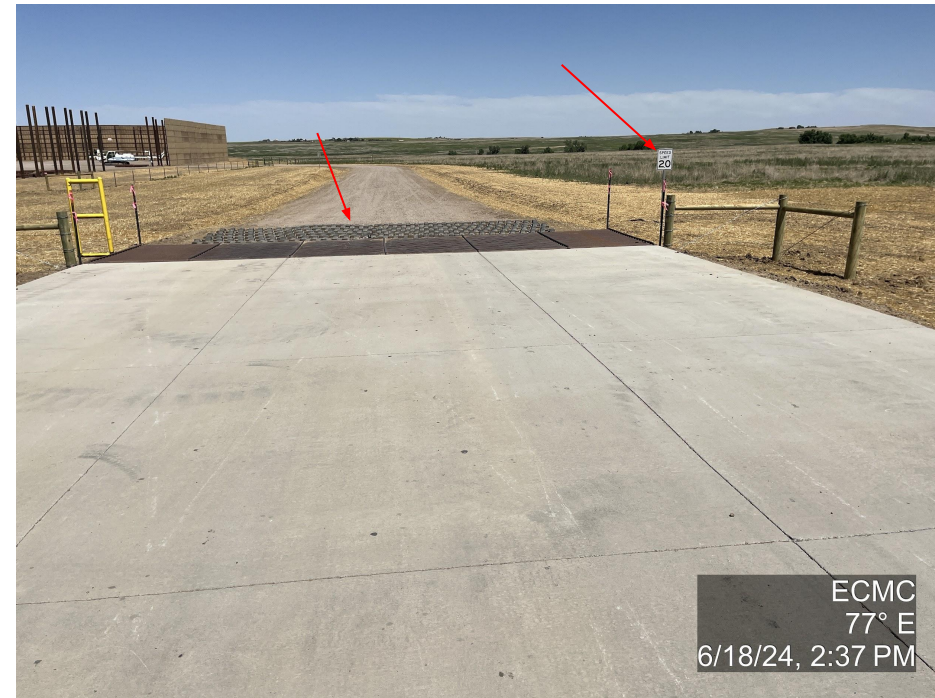
Photo 2. The photo was taken at the entrance to the well location facing East. The photo illustrates the sediment track out device, wind erosion BMP and concrete entrance.