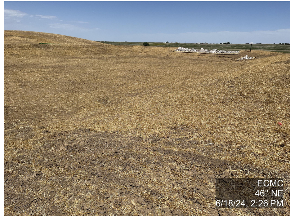
Photo 4. The photo was taken at the well location facing Northeast. The photo illustrates the sediment basin has been crimped and has an armored outlet/spillway per the stormwater plan.