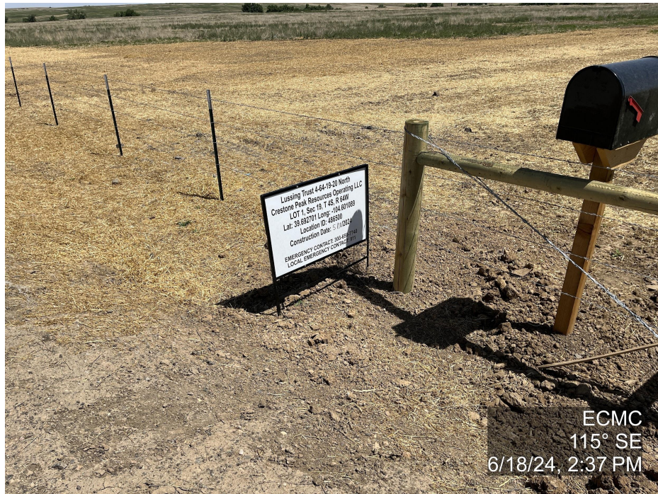
Photo 1. The photo was taken at the entrance to the well location facing Southeast. The photo illustrates the location sign and Form 2A mailbox.