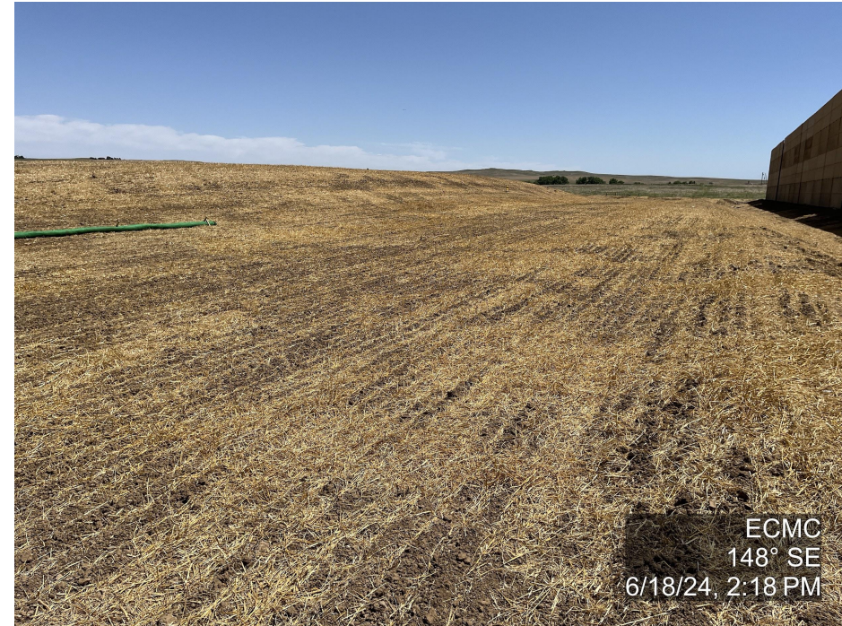
Photo 5. The photo was taken at the well location facing Southwest. The photo illustrates the stormwater ditch around the South and West side of the location has been crimped and culverts have been armored with rip-rap and straw wattles.

Photo 6. The photo was taken at the well location facing Southeast. The photo illustrates interim areas and the topsoil stockpile have been straw crimped and seeded.