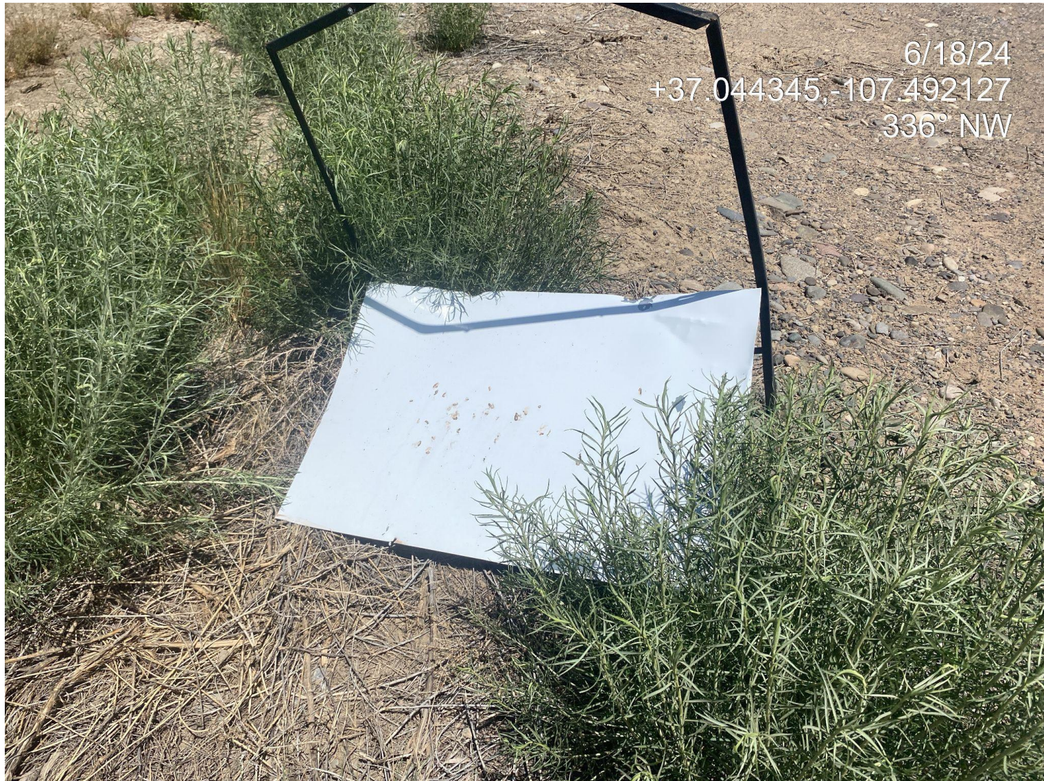
Photo 2. View of damaged location sign that needs repair.