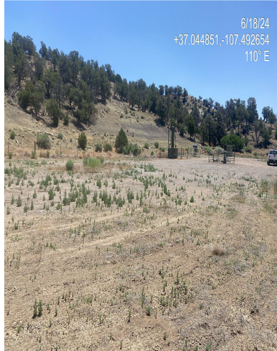
Photo 4. Northern portion of the disturbance that is not needed for production/operations. This area needs to be interim reclaimed.