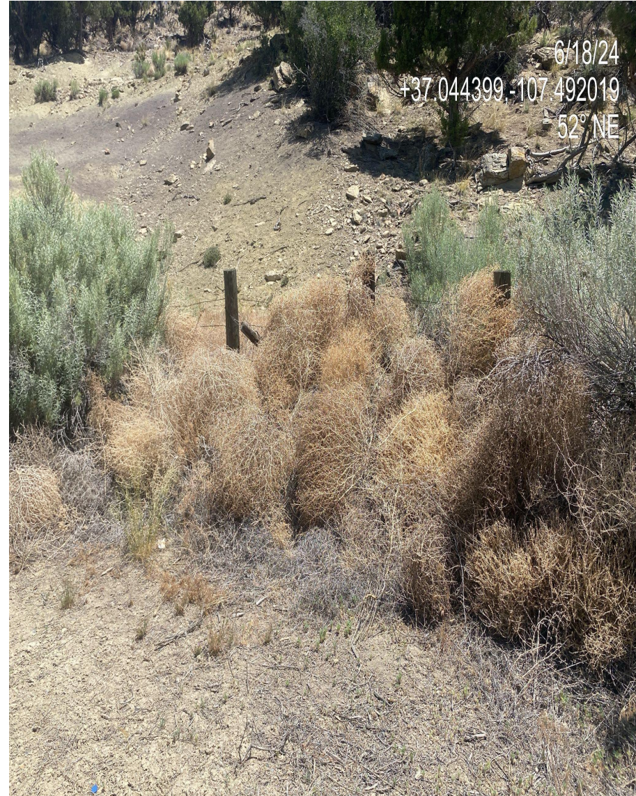
Photo 3. View of weedy russian thistle debris piling up in the eastern portion/fence line.