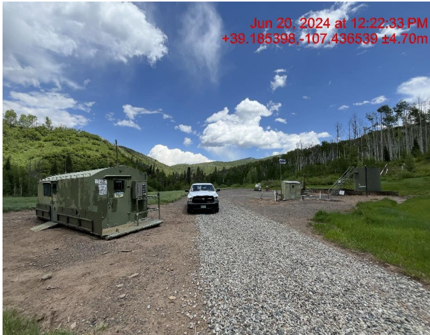
Entrance to location - Photo #02790