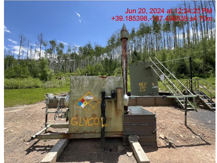
Separator - Photo #02792