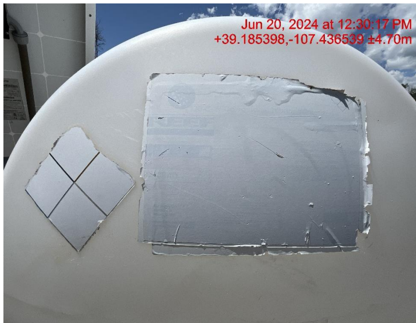
Chemical tank - Label is not legible and needs replaced - Photo #02804