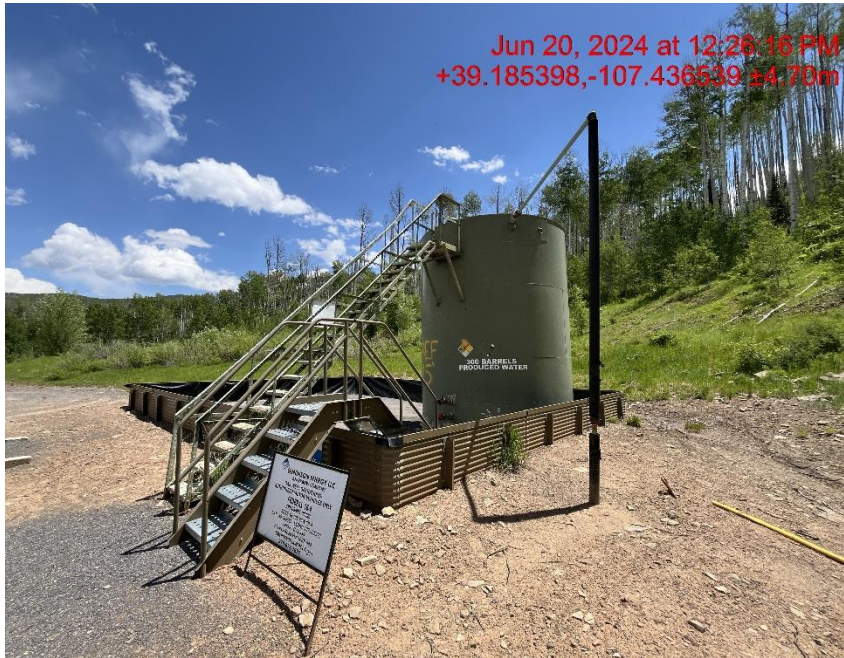
Tank battery - Photo #02797