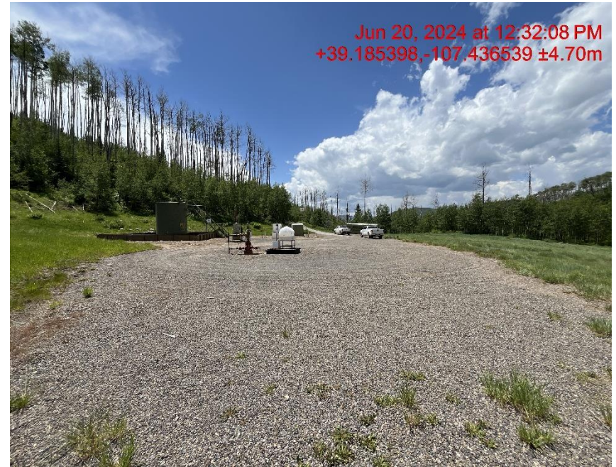
Northeast corner of location - Photo #02804