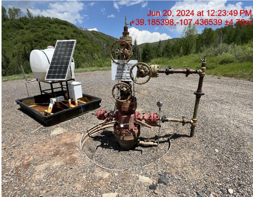
Well head and chemical tank - Photo #02791