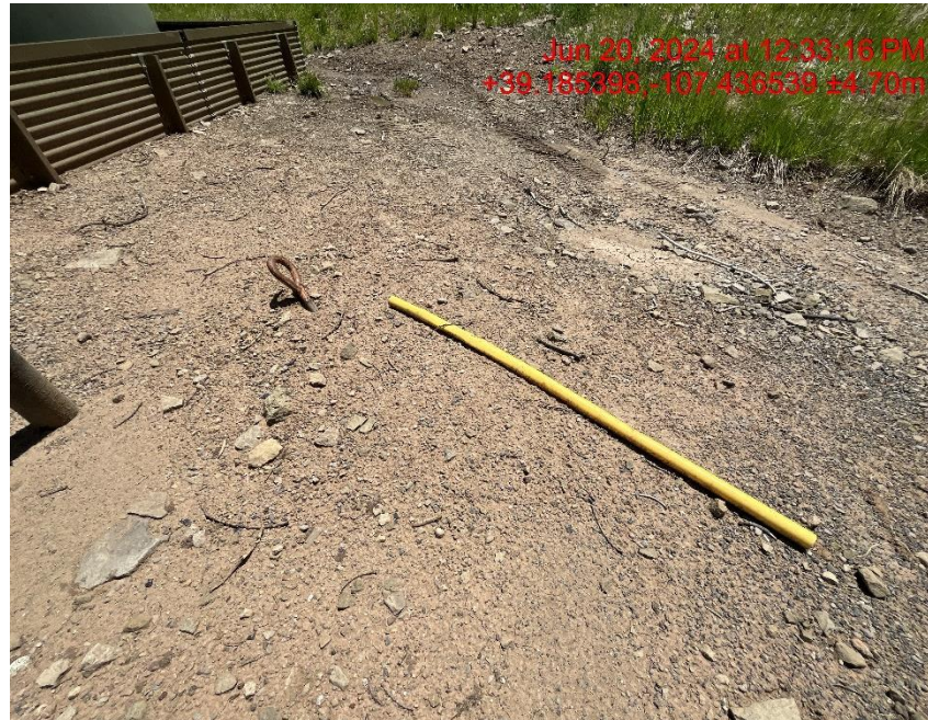
Debris, reinstall marker - Photo #02812