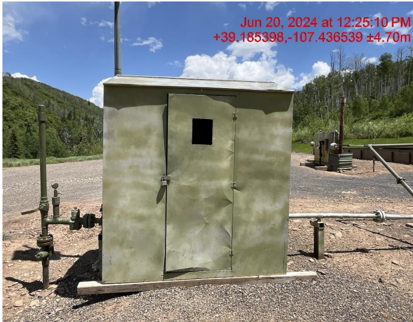
Meter run/wildlife entry - Photo #02794