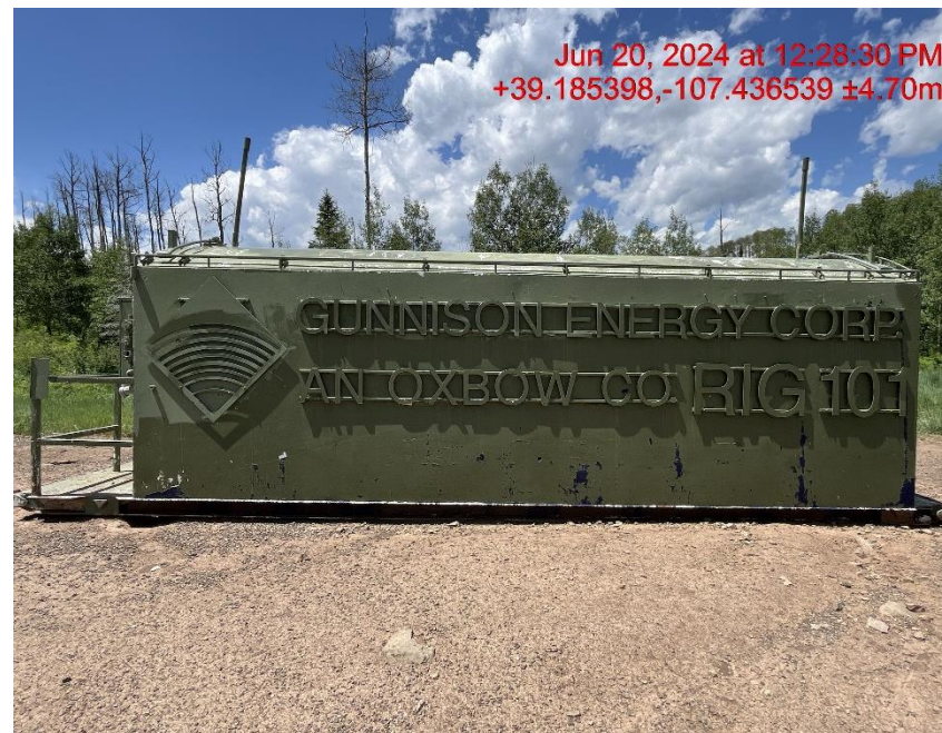
Unused equipment - Photo #02801