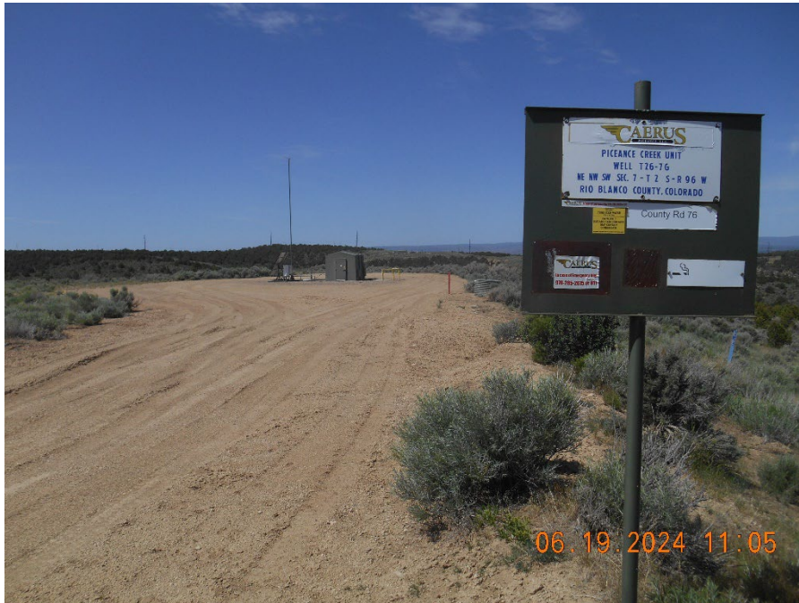
Location overview looking SW entrance with sign

Inspection Date: 6/19/2024 Inspection Doc#: 693807389