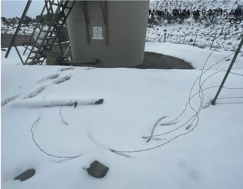
Photo # 8201 From inspection 708903205 conducted on 03/05/2024 Barbed wire fence needs maintenance/barbed wire laying on ground/wildlife hazard