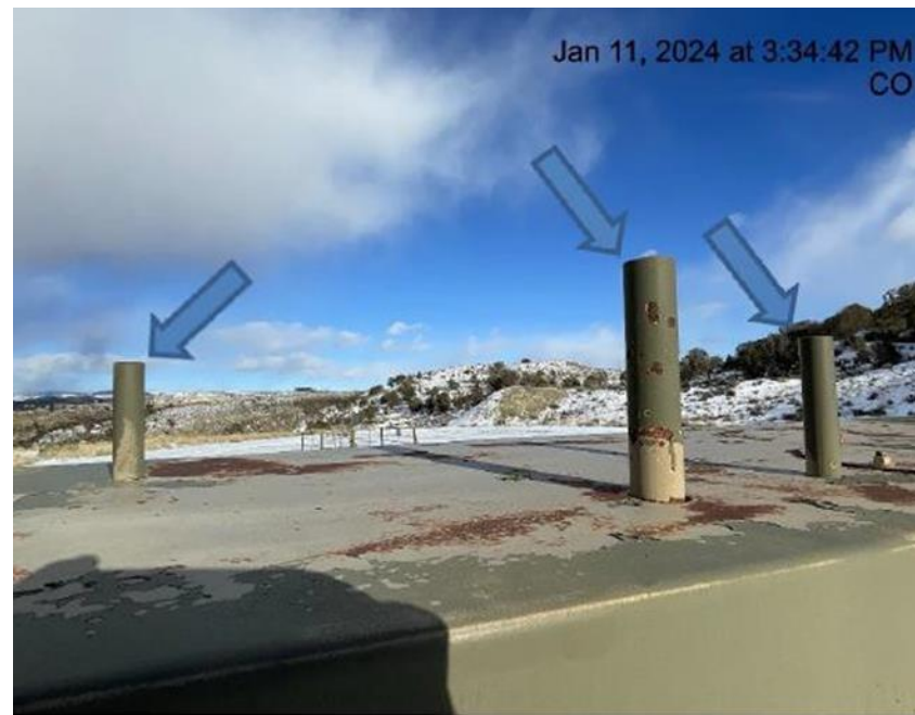
Photo # 2674 From inspection 708902787 conducted on 01/11/2024 PRV & rupture disc vent lines lack caps