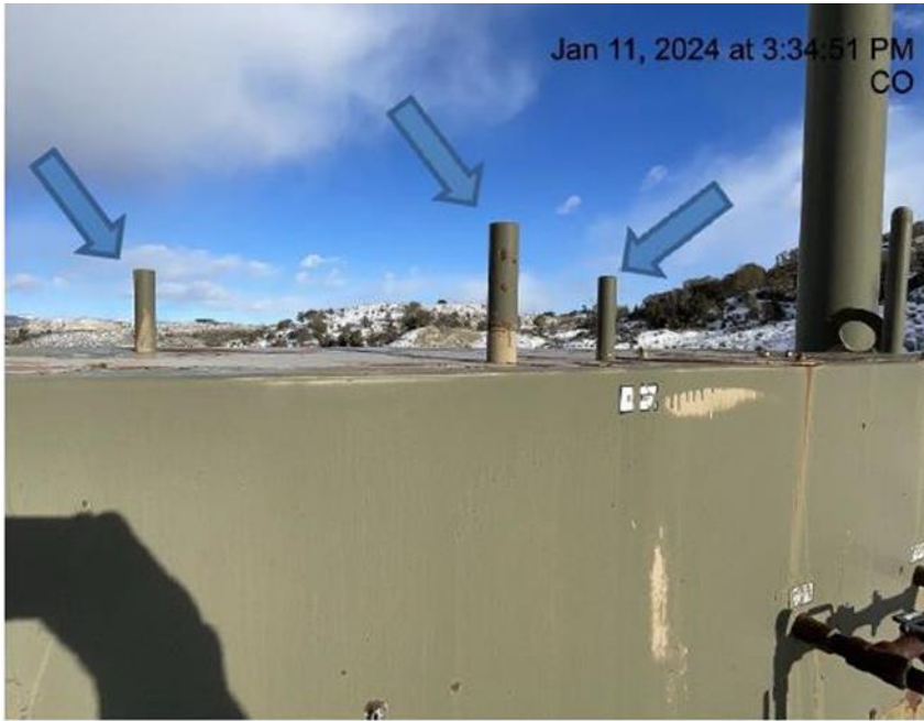
Photo # 2673 From inspection 708902787 conducted on 01/11/2024 PRV & rupture disc vent lines lack caps