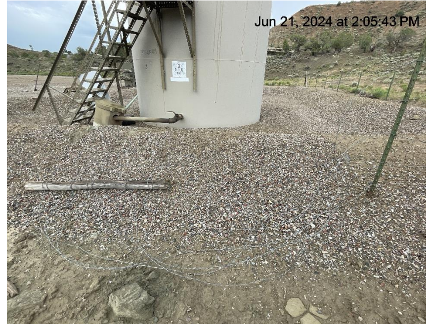
Photo # 1125 Barbed wire fence needs maintenance/barbed wire laying on ground/wildlife hazard