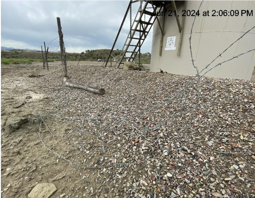
Photo # 1126 Barbed wire fence needs maintenance/barbed wire laying on ground/wildlife hazard