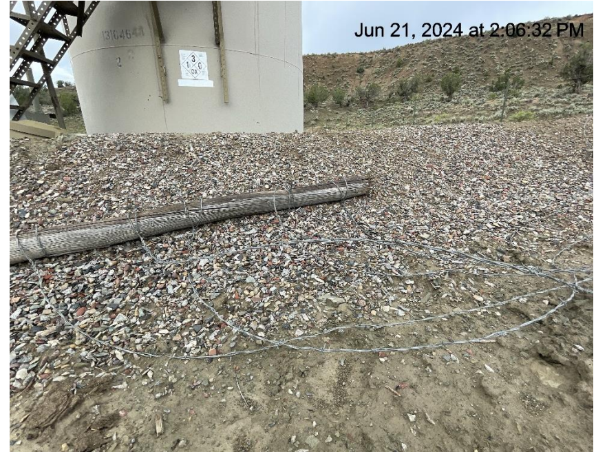
Photo # 1127 Barbed wire fence needs maintenance/barbed wire laying on ground/wildlife hazard