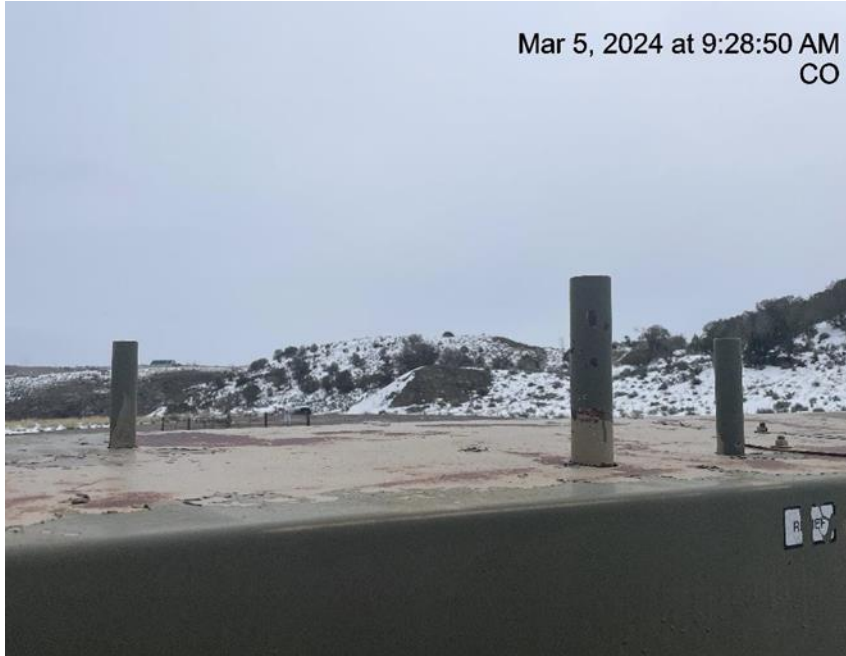
Photo # 8200 From inspection 708903205 conducted on 03/05/2024 PRV & rupture disc vent lines lack caps