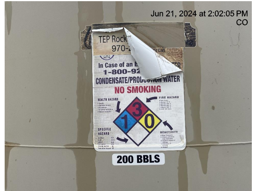
Photo # 1128 Tank label losing adhesion & some required info is not visible