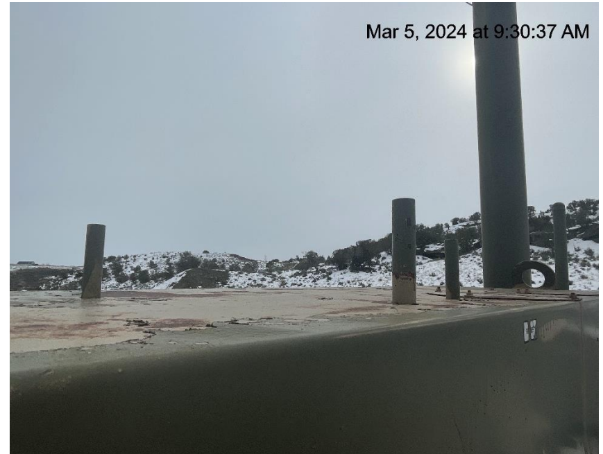
Photo # 8199 From inspection 708903205 conducted on 03/05/2024 PRV & rupture disc vent lines lack caps